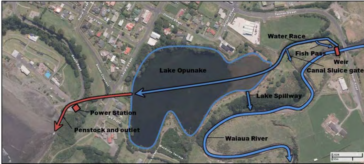
Photo 1 Opunake Power Limited scheme on the Waiaua River