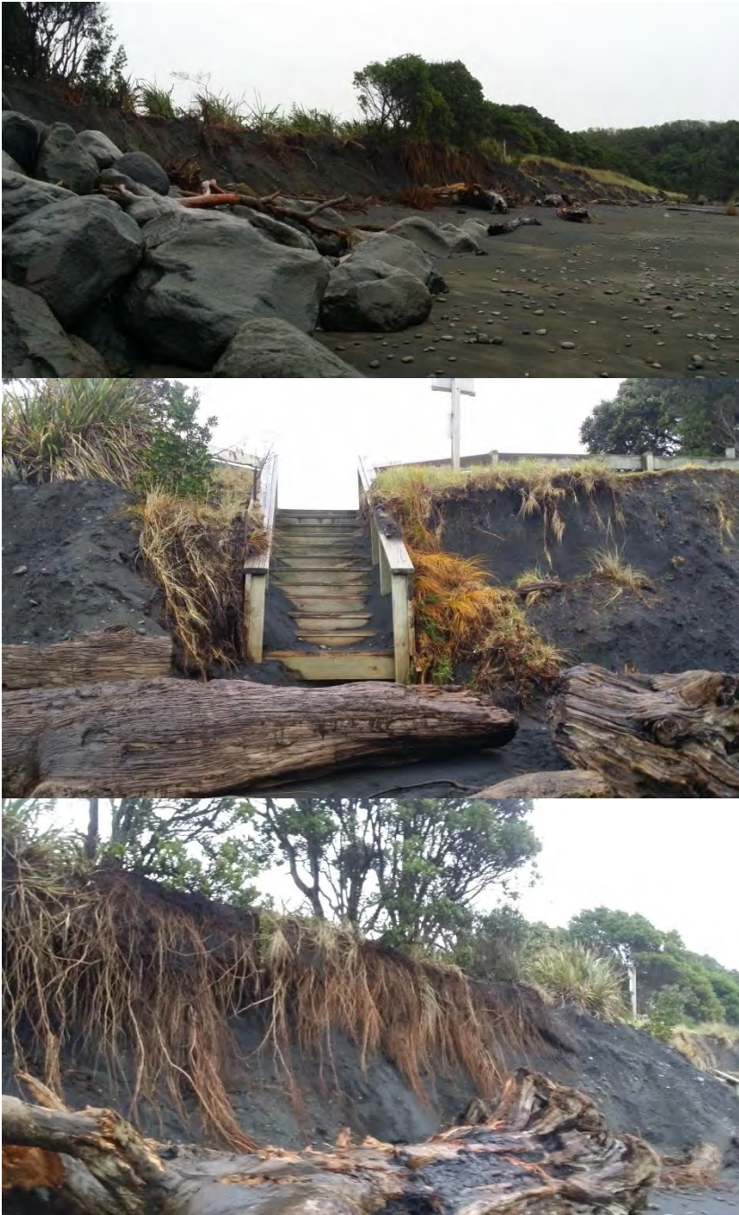
Photo 43 Erosion at the west end of Urenui Beach June 2016