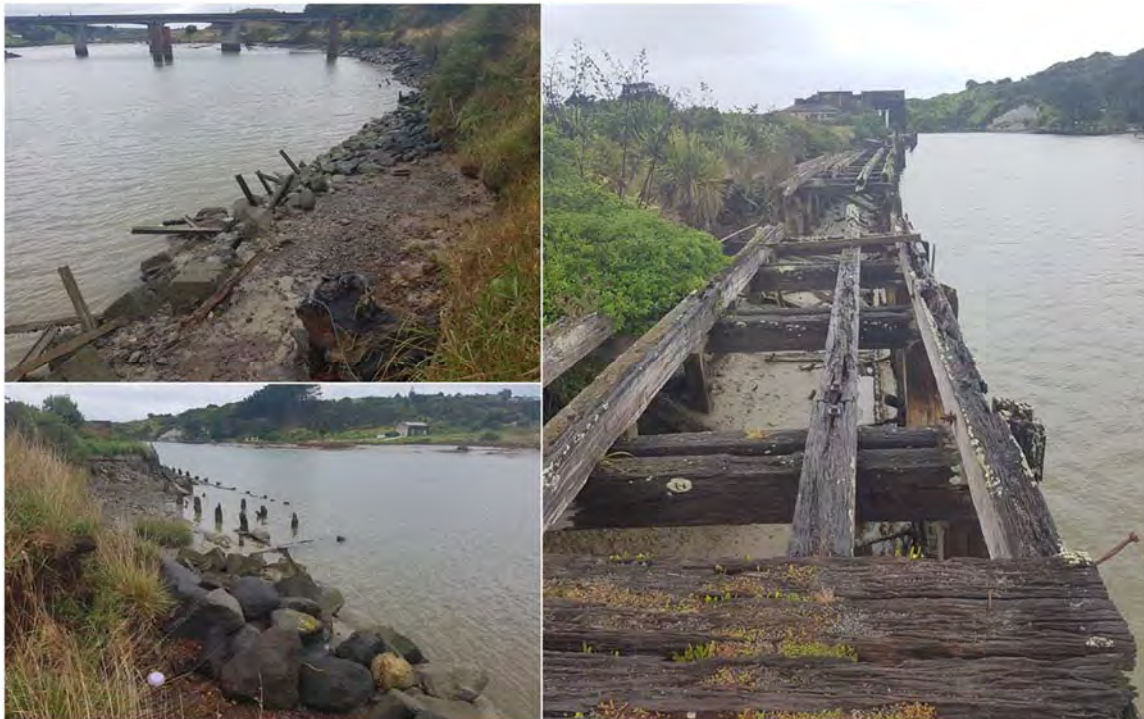
Photo 14 Patea wharf and rock wall, 11 April 2019

As noted in previous inspections, the wharf is in a dilapidated state and has been so for some time. The consent for this structure was renewed on 23 June 2010 with reduced maintenance requirements. This allows STDC to continue to occupy the space provided the derelict wharf does not pose a navigational hazard.