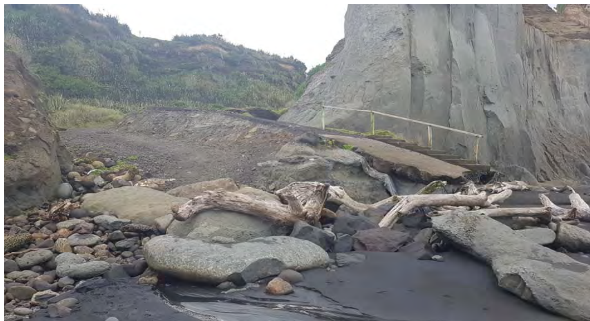
Photo 12 Denby Road access to Waihi Beach, 11 April 2019

The Waihi Beach access ramp was inspected on 11 April 2019. Since the previous inspection, an alternative access track had been excavated adjacent to the consented structure (Photo 12). All works were undertaken above mean high water springs and as such did not require a resource consent. This alternative track has improved beach accessibility. As per recent inspections, the remnant consented access structure is in a highly degraded state, and is continuing to be undermined by the tide. In this current state, the structure remains non-compliant with resource consent 6736-1.