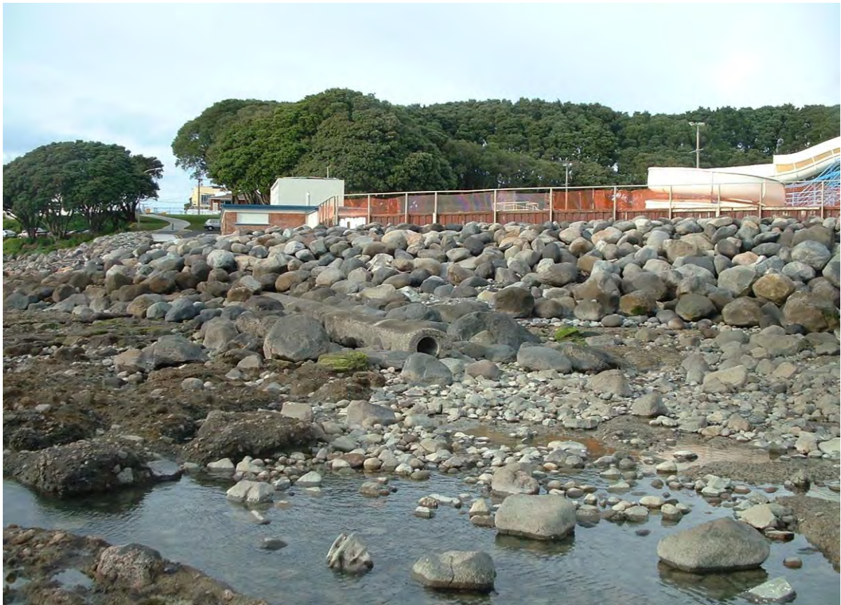
Photo 1 Aquatic Centre ocean outfall