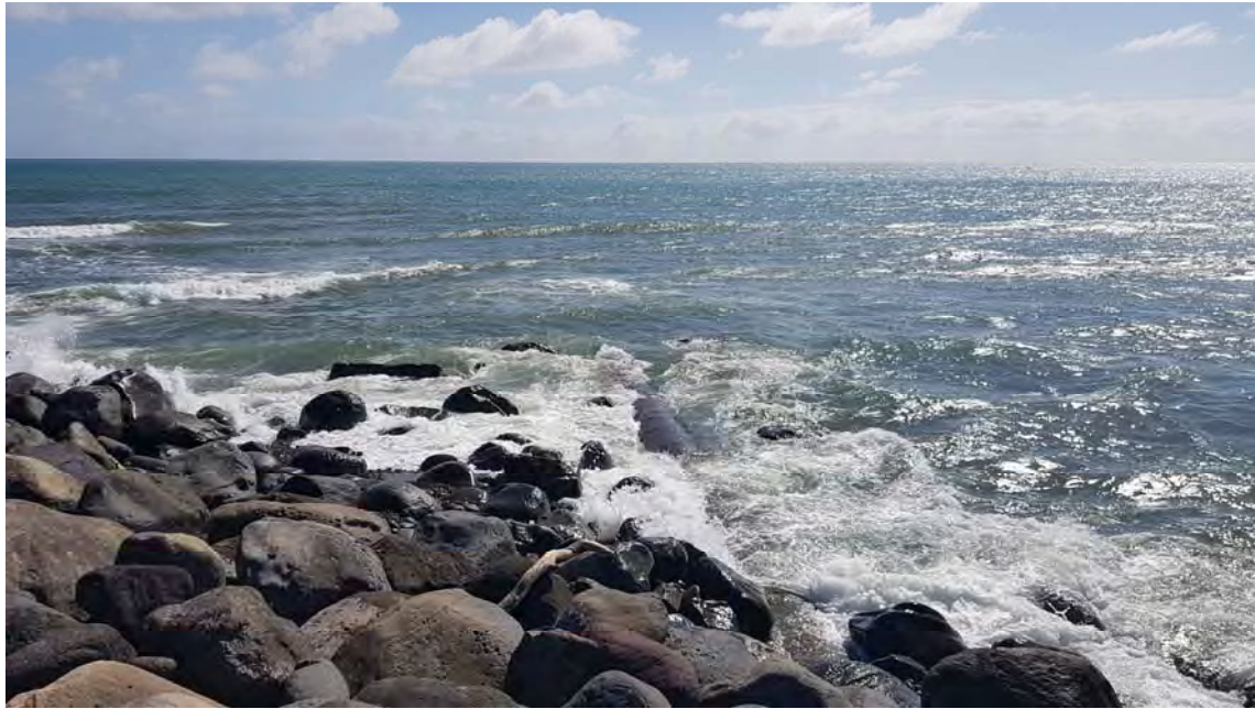
Photo 1 Outfall pipe during the 2017-2018 backwash inspection (4 April 2018)

The reef inspection was carried out at the next low tide (21:50 on 12 February 2019 at 1.0 m). Upon arrival at the reef at 20:30, a clear, odourless flow was found discharging from the outfall at a low rate. There were no objectionable odours, or conspicuous films or scums, at the discharge point. Although the extent of Ulva sp. cover in the vicinity of the outfall was slightly higher than that described in the 2017-2018 inspection, the high density cover was restricted to within 5 m of the outfall and was considerably lower than the Ulva sp. cover recorded in previous inspections (Photo 2). This overall improvement is most likely due to the reduction in freshwater output from the marine outfall since extensive works were undertaken at the Aquatic Centre in 2018-2019 to divert greywater discharge from the stormwater system, leading to the marine outfall, to the sewerage network.