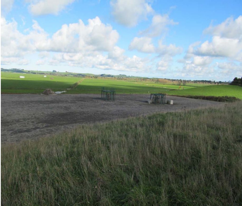
Photo 1 Photo showing the Arakamu wellsite