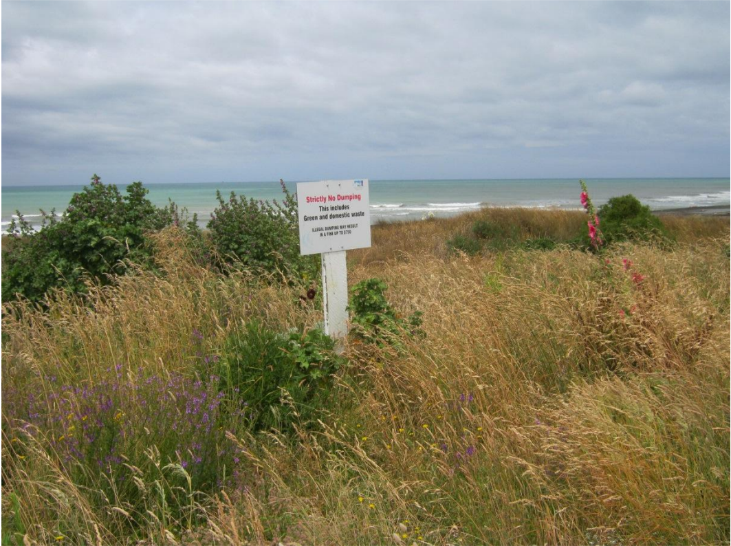
Photo 3 Sign instructing no dumping of waste