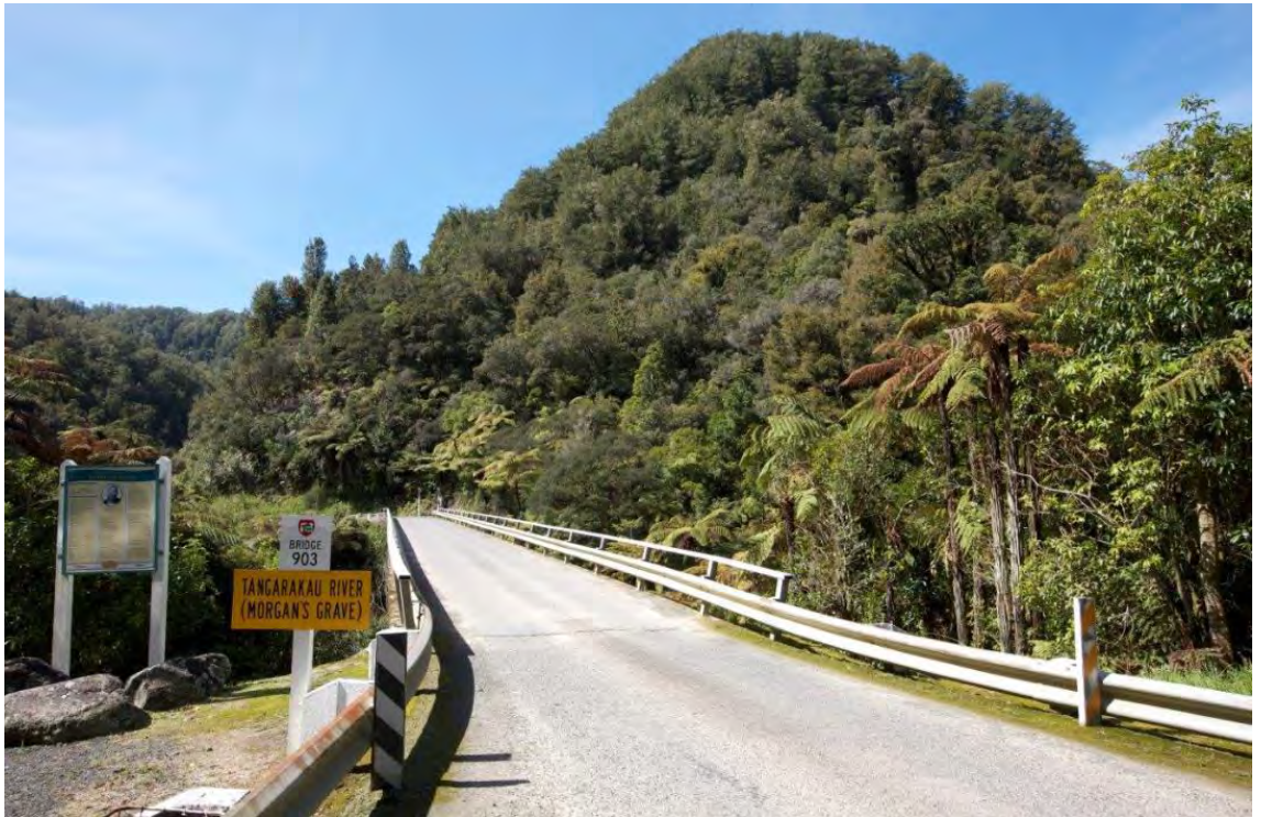
Figure 2.2 SH43 - The Forgotten World Highway