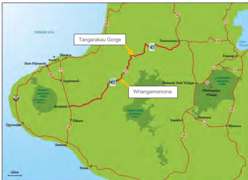
Figure 2.1 SH43 Location

Visitor internet reviews typically refer both to the views and quality of the scenery plus the attractions along SH43 including the Whangamomona Hotel, Mt Damper Falls, walks, lookout points and historic places. SH43 passes through what a local tourist operator describes as a “stunning and remote part of the country”, and offers a “beautiful drive through country that many people don’t get to see, e.g. the Tangarakau Gorge”.