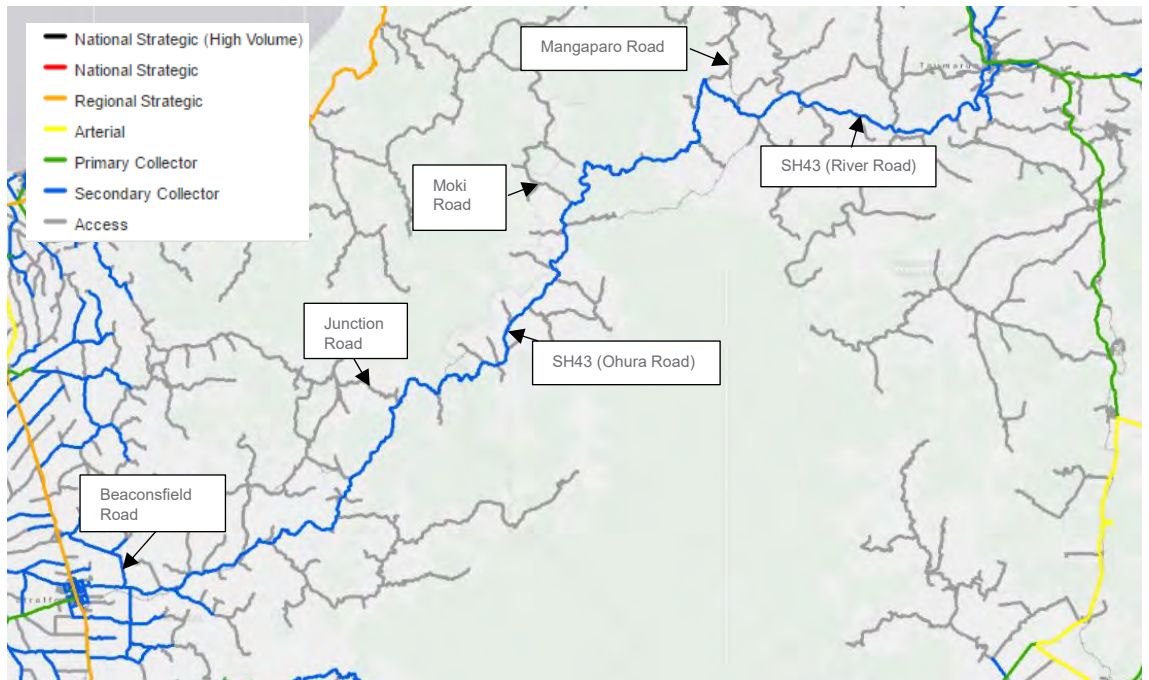
Figure 3.1 ONRC (Speed Management Framework)

The level of investment in maintaining SH43 is a factor of its classification as a Secondary Collector and the volume and type of traffic using the road. Re-classifying SH43 as a Primary Collector would enable an increase in expenditure on maintaining the route.