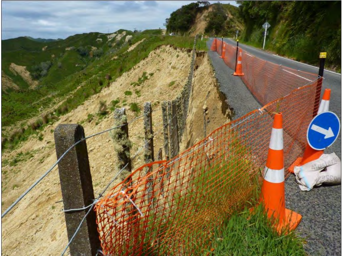
Figure 6.1 SH43 Storm Damage, June 2015