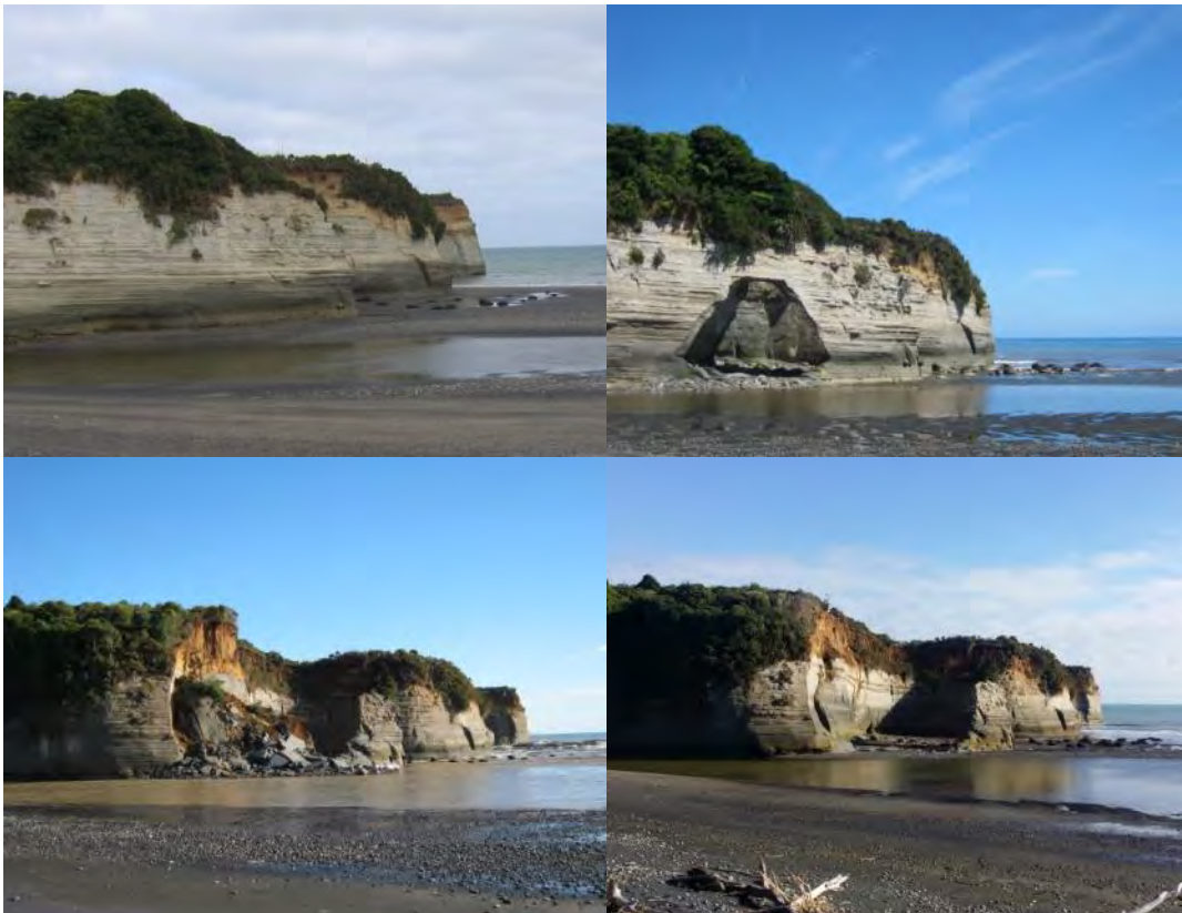
Photo 3 Urenui Beach cliff erosion (Clockwise from top left - August 2009, December 2012, June 2013, May 2015)