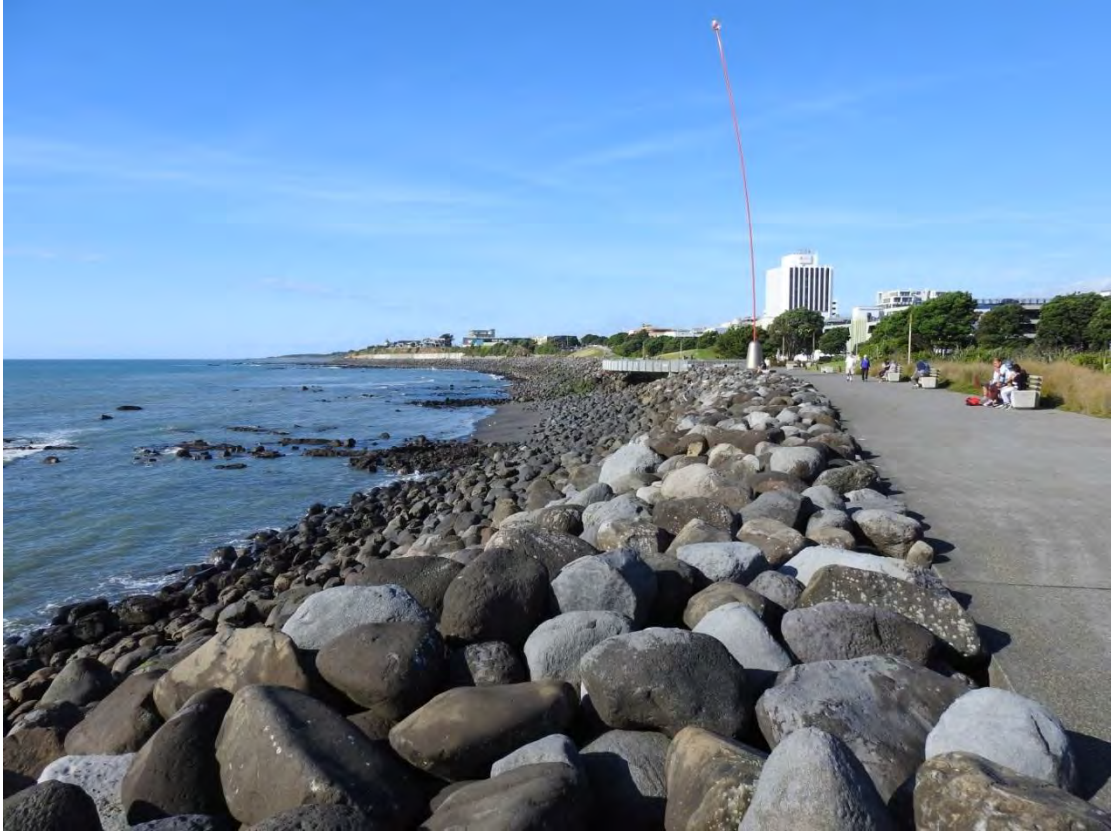
Photo 13 New Plymouth coastal walkway with rip rap seawall protection (April 2016)