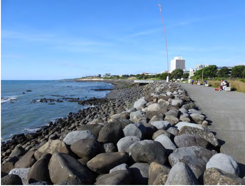
Photo 39 Foreshore rip rap protection between Te Henui and Kawaroa (April 2016)