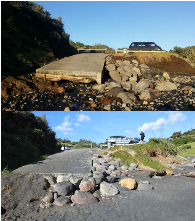
Photo 41 Boat ramp at Back Beach (top May 2015, bottom April 2016)

were placed at the toe of the structure and the cavity was filled with the aim of preventing further damage to the ramp and making public access easier/safer. The repair work undertaken was still in place and functioning well during the inspection on 21 April 2016 (Photo 41).