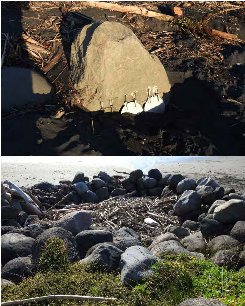
Photo 37 Stormwater outlets under coastal permit 4596 (top Fitzroy June 2016, bottom East End April 2016)

The rock rip rap protection on the right bank of the Te Henui Stream (permit 6242) appeared to be in good condition during the April 2016 inspection.