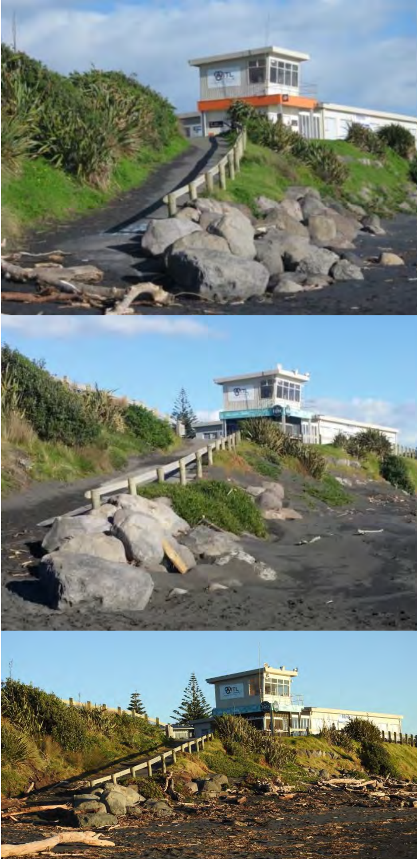
Photo 33 Boat ramp and rock protection works in front of Fitzroy Surf Lifesaving Club (top June 2013, middle May 2015, bottom June 2016)