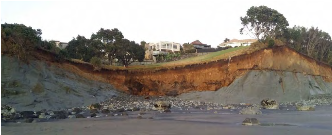
Photo 7 Eroding cliffs to the west of the seawall at Onaero (July 2015)

In July 2001 concern was raised by locals, through NPDC, regarding erosion of the reserve situated to the west of the seawall (Photo 7). In this regard it was noted that the reserve was specially set aside as a Coastal Hazard Zone at the time of the subdivision.