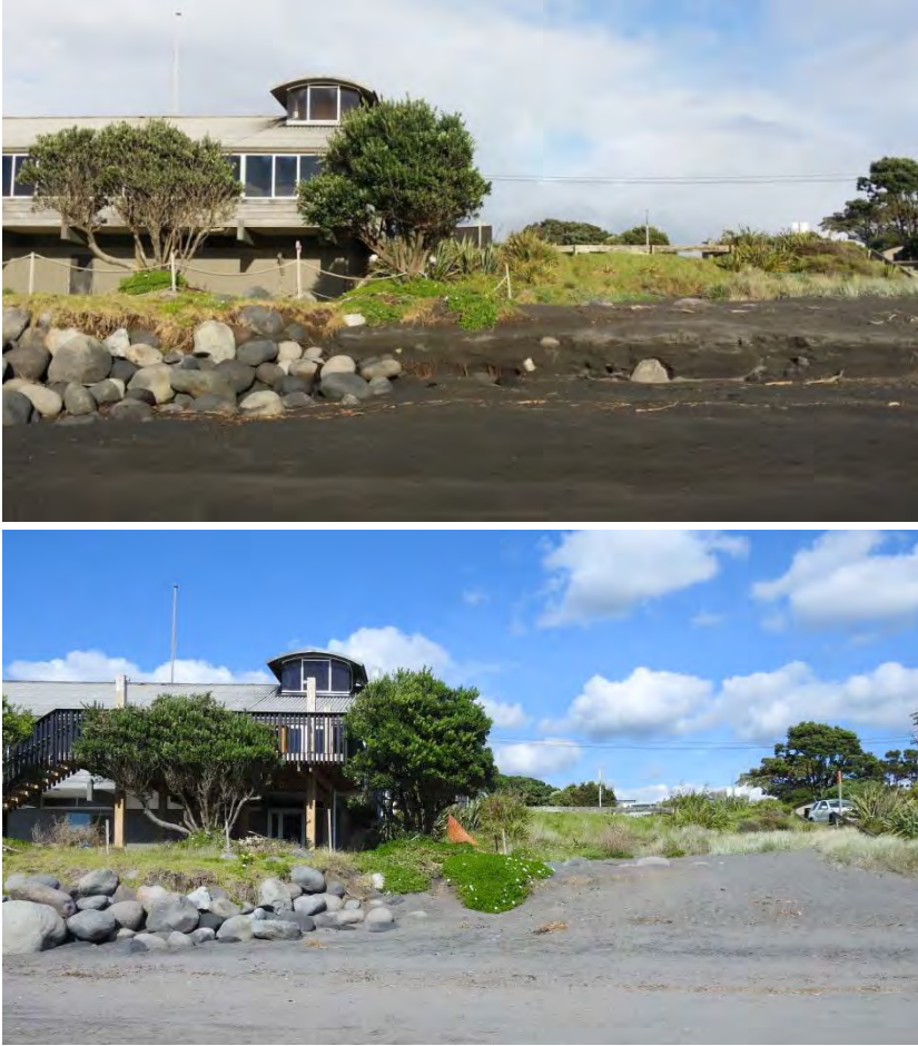
Photo 42 Protection works in front of Oakura Surf Life Saving Club showing erosion of the bank/dunes to the west of the club (top June 2015, bottom April 2016)

The stormwater outfall and rip rap toe protection works down the right-of-way at 63-65 Messenger Terrace (permit 5223) were in a good condition.