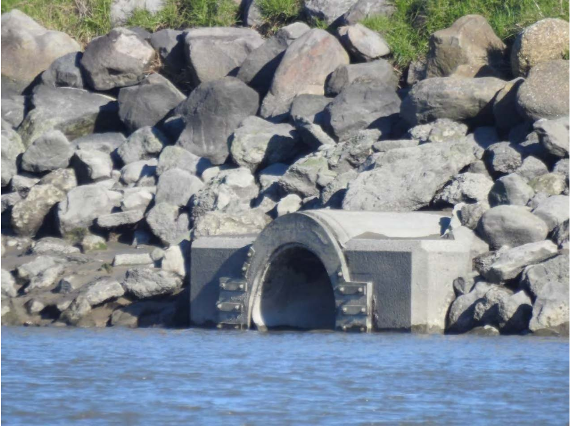
Photo 14 Stormwater outlet structure McNaughton Street, Waitara (June 2016)

NPDC holds coastal permit 6525 to erect, place and maintain a stormwater outlet structure in the coastal marine area on the true right stopbank of the Waitara River. This permit was issued by the Council on 4 February 2005 as a resource consent under Section 87(c) of the RMA. It is due to expire on 1 June 2021.