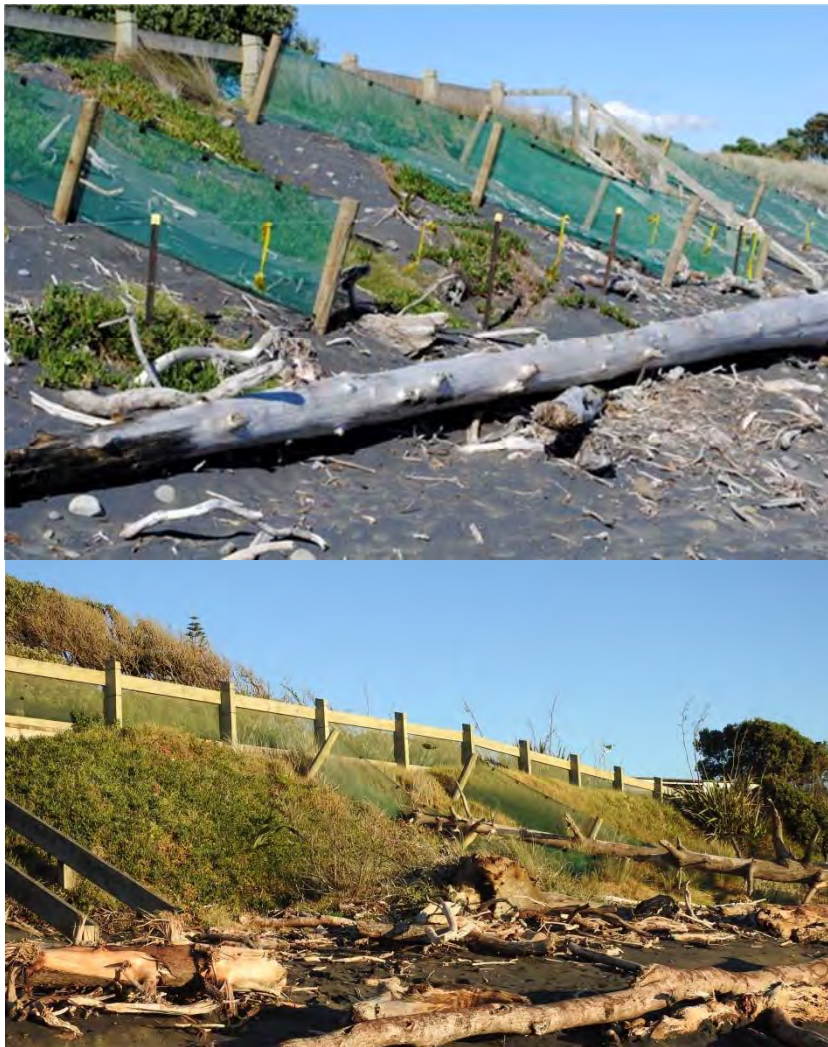
Photo 36 Plantings in front of the New Plymouth Surf Riders Club (April 2010 and June 2016)

The plantings in front of the New Plymouth Surf Riders Club have made major improvements in preventing erosion of the bank (Photo 36). The area is also well fenced. The tree trunk, usually at the base of the dune, had shifted on to the bank causing damage to one of the fences.