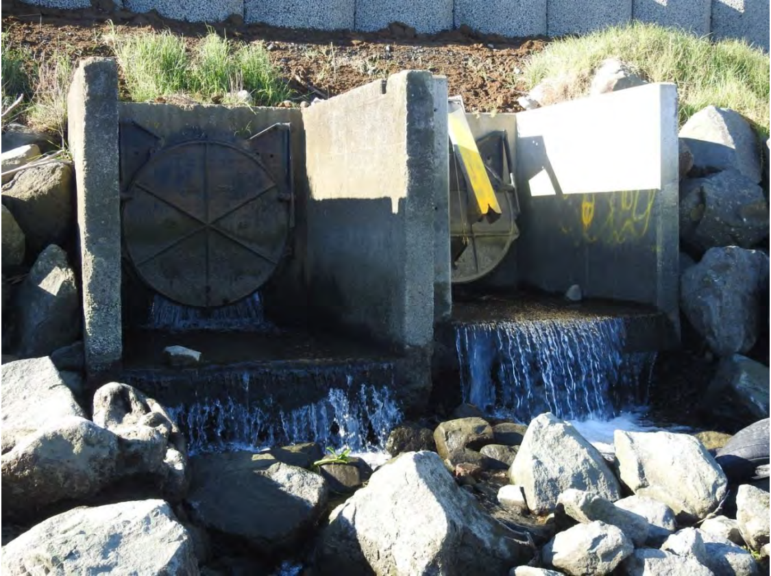
Photo 24 Stormwater outlet structure downstream of Atkinson Street (June 2016)

The stormwater outlet structure on McNaughton Street (permit 4900) appeared to be in satisfactory condition (Photo 14). The plate on the end of the pipe, replaced between the 2013 and 2014 inspection, had remained in place by the 2016 inspection.