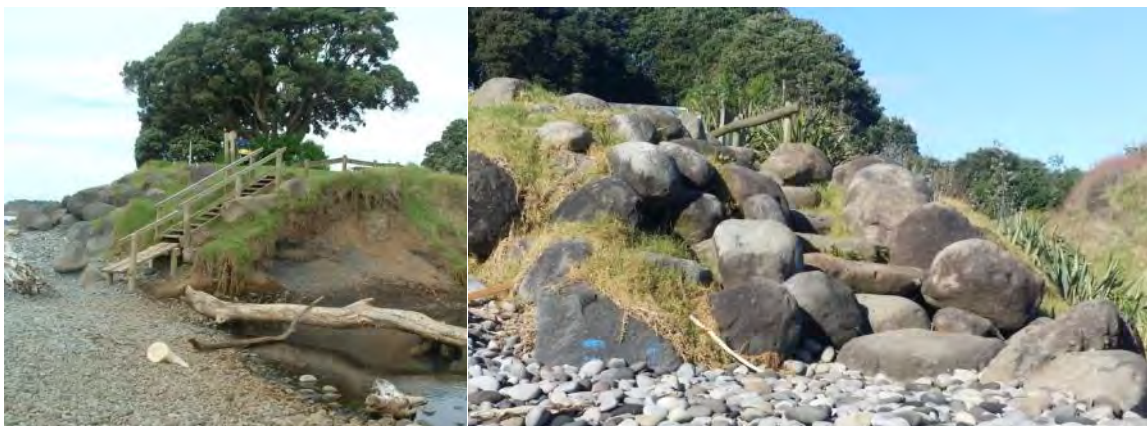
Photo 9 Step access to Bell Block Beach (previous wooden steps July 2005 and current rock steps May 2015)

Currently, the NPDC seawall extends to the eastern edge of the Wills Road reserve, with a private seawall extending a further 200 m to the east.