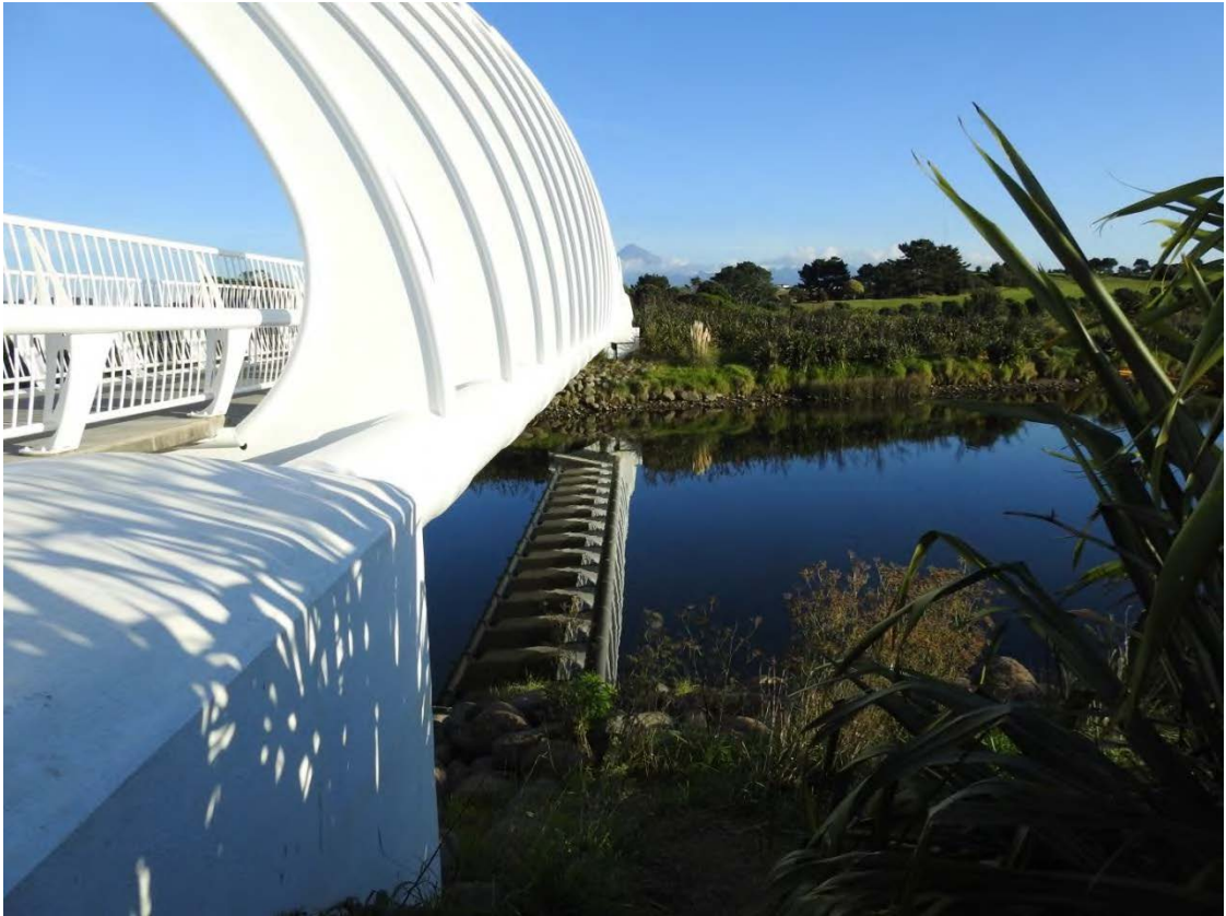
Photo 32 Te Rewarewa bridge over the Waiwhakaiho River (April 2016)