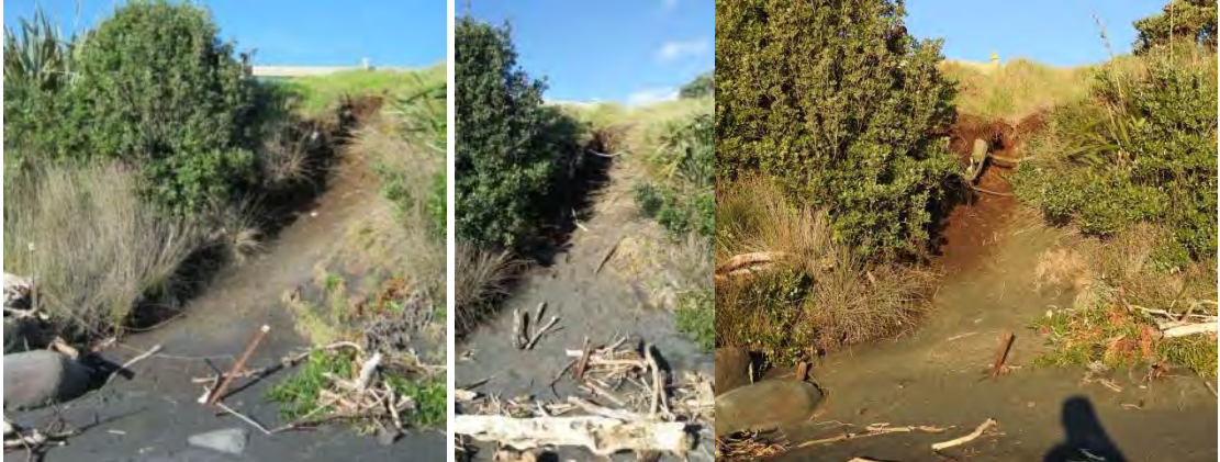
Photo 35 Close up of erosion present in front of Board Riders club caused by human foot traffic (June 2013, May 2015 and June 2016)

The plantings in front of the New Plymouth Surf Riders Club have made major improvements in preventing erosion of the bank (Photo 36). The area is also well fenced. The tree trunk, usually at the base of the dune, had shifted on to the bank causing damage to one of the fences.