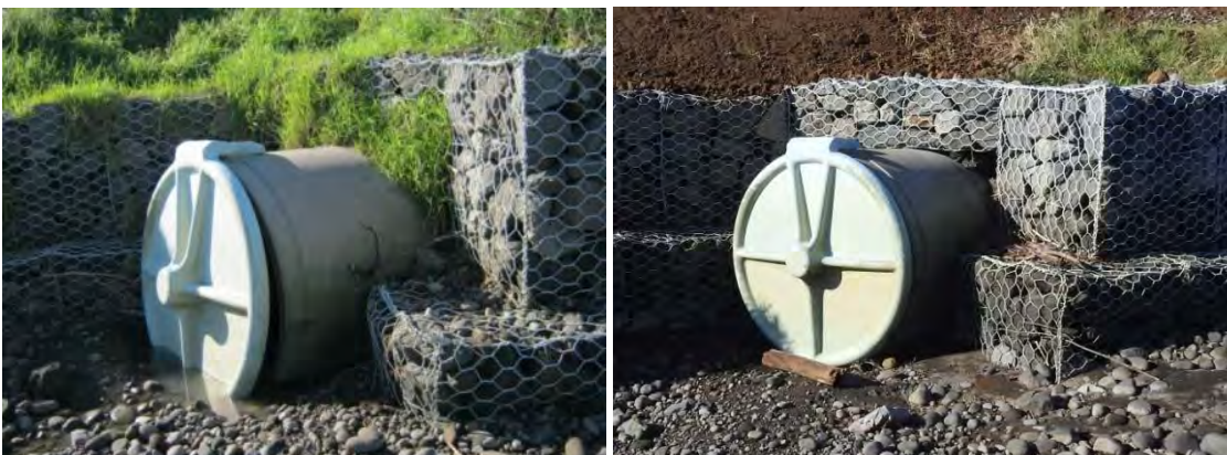
Photo 25 The stormwater outlet by the Atkinson Street/East Quay intersection (June 2013 and June 2016)

The stormwater outlet by the Atkinson Street/East Quay intersection (permit 6525) was in good condition. The build-up of stones in front of the outlet pipe, observed during the June 2013 inspection, was not present during the June 2016 inspection (Photo 25).