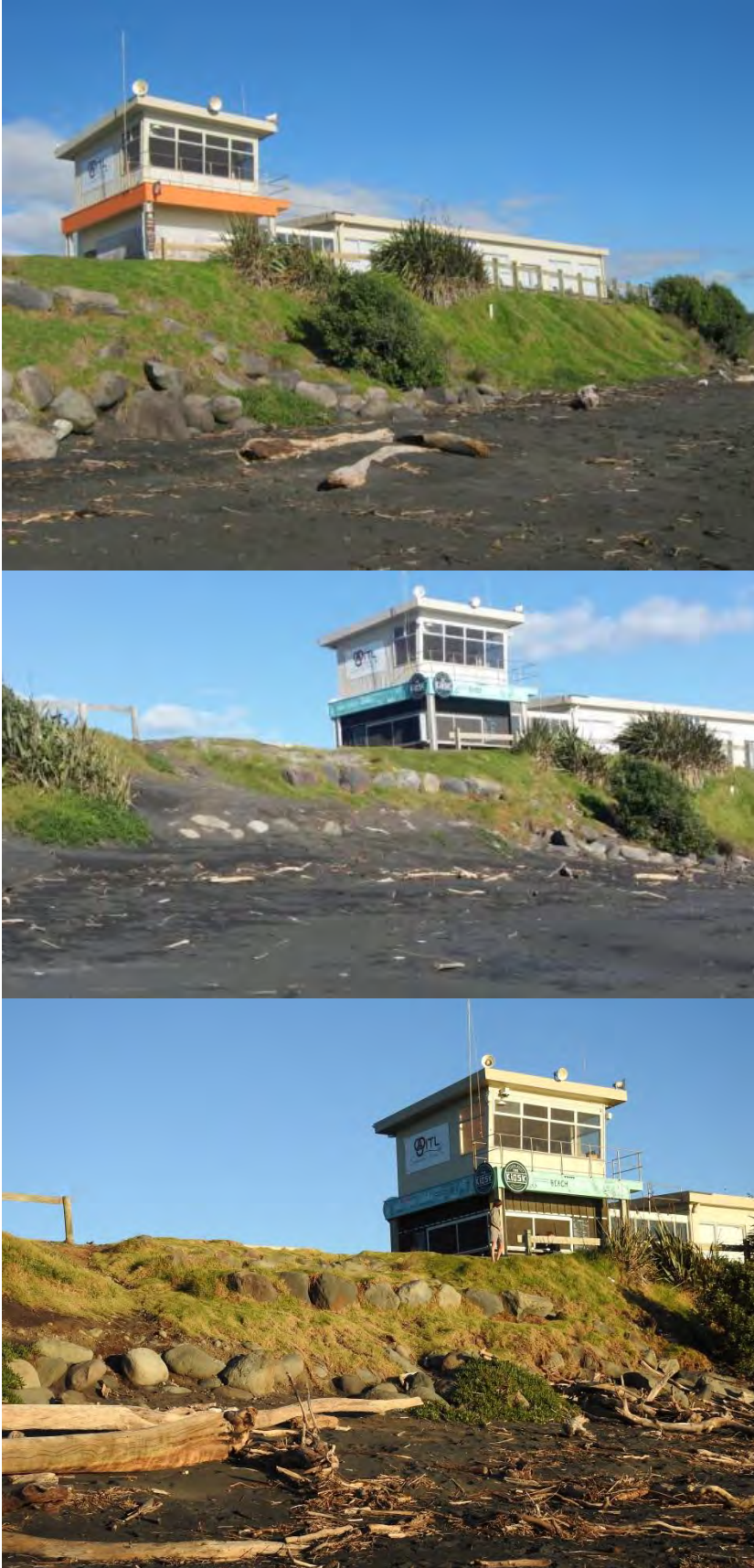
Photo 34 Rock protection works in front of Fitzroy Surf Lifesaving Club (top May 2014, middle May 2015, bottom June 2016)