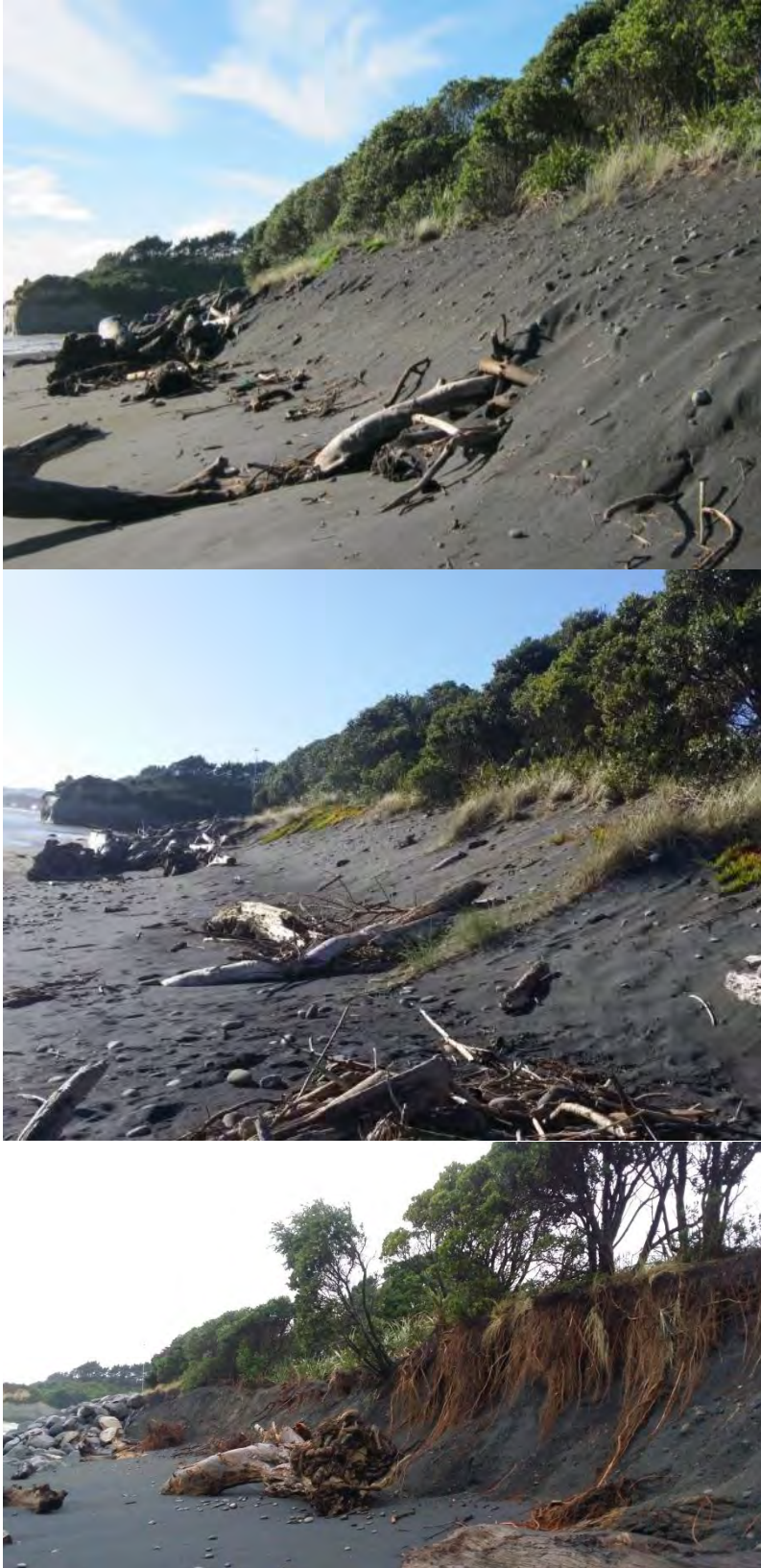
Photo 21 End effects from Urenui rip rap protection wall extension (top June 2013, middle May 2015, bottom June 2016)