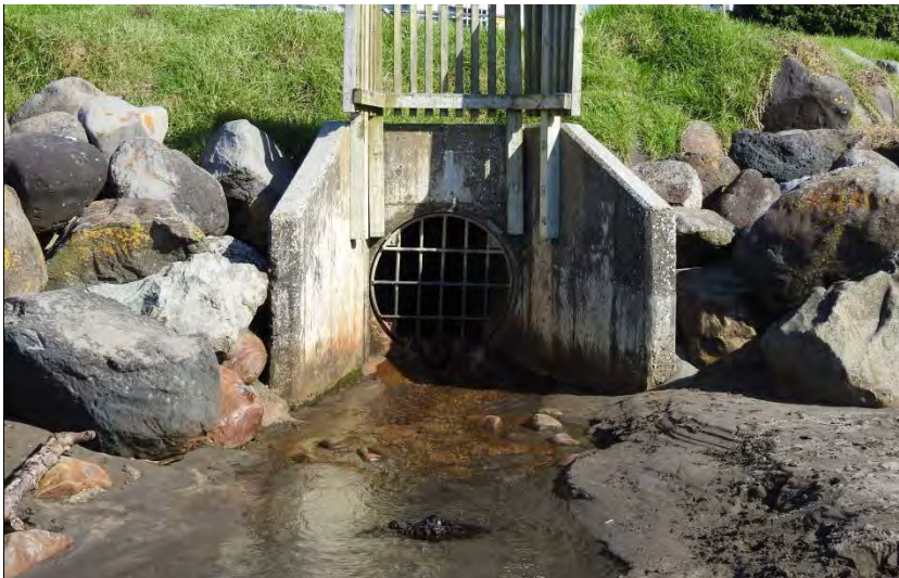
Photo 40 The Bayly Road stormwater outfall on Ngamotu Beach (April 2016)