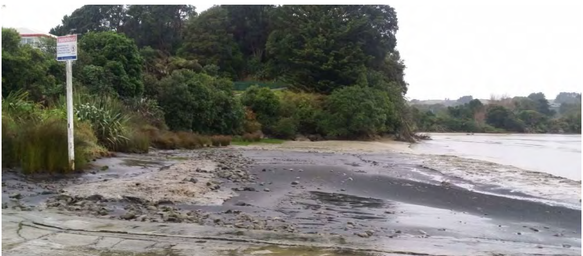
Photo 19 Riverbank protection works around the Manager's residence (June 2016)