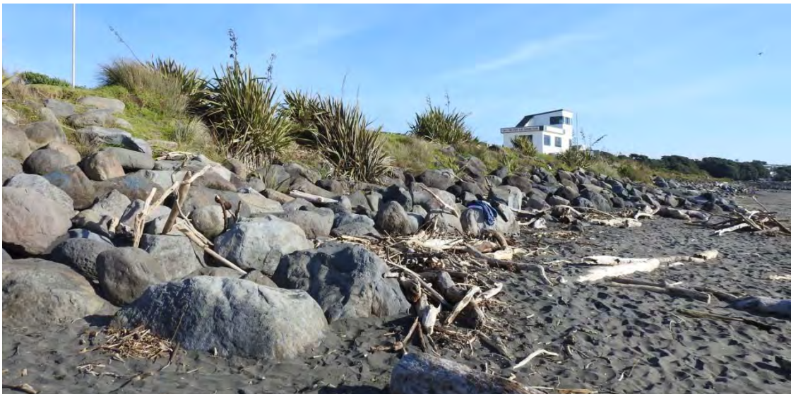
Photo 11 Rip rap seawall in front of East End Surf Life Saving Club (April 2016)

Changes to consent 4523 were granted in May 2005. These changes allowed an extension of the seawall from 290 m to 355 m.