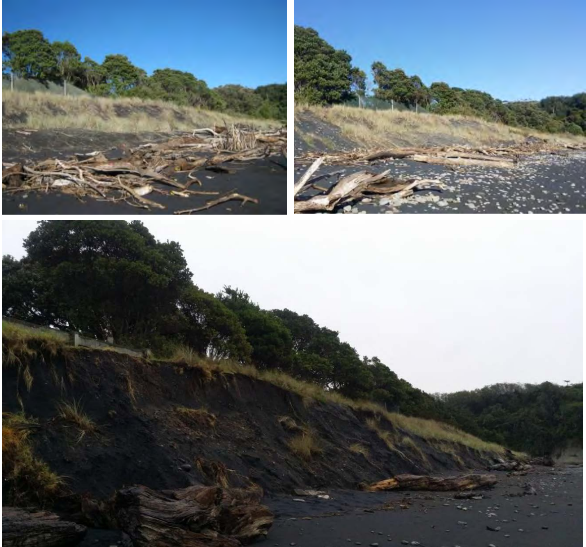
Photo 4 Sand push-up and dune restoration May 2014 and May 2015, major erosion June 2016

Following a notified consent process NPDC were granted a coastal permit in August 2001 to build a 295 m boulder rock rip rap seawall in the coastal marine area on the eastern end of the Urenui Beach foreshore for coastal erosion protection purposes. Construction began in September 2001 and was completed in December 2001.