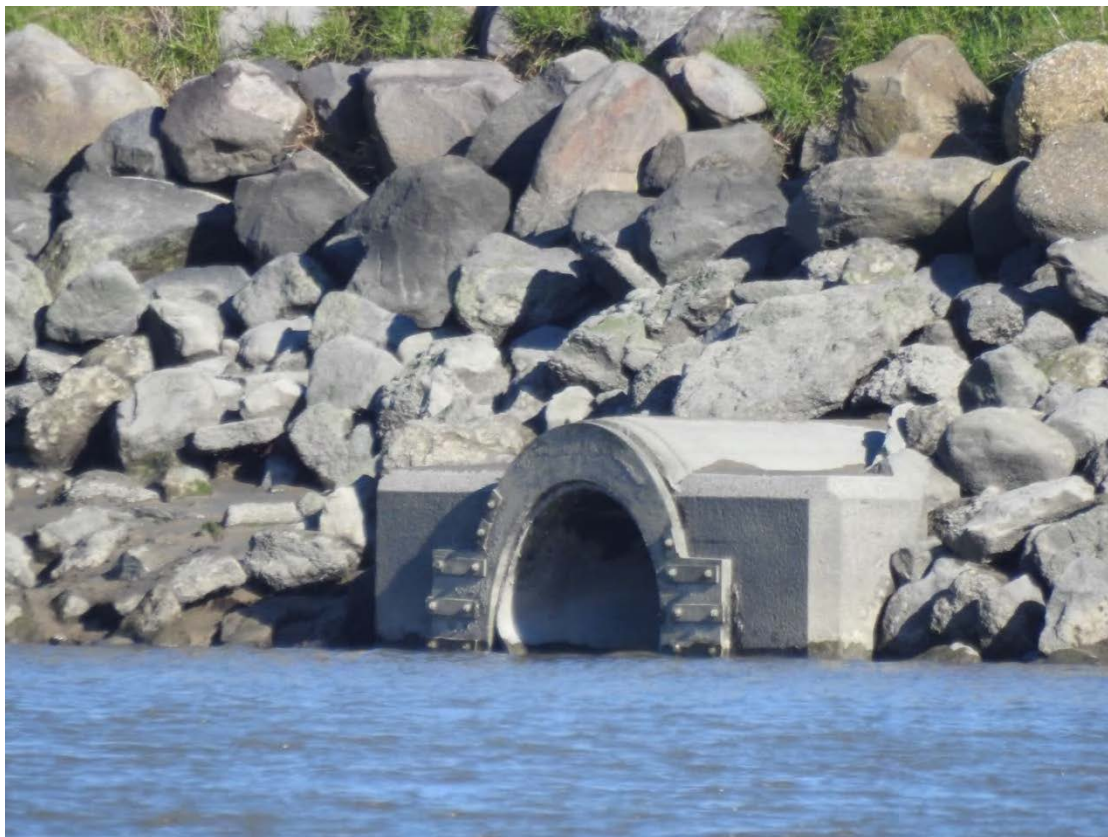
Photo 14 Stormwater outlet structure McNaughton Street, Waitara (June 2016)

NPDC holds coastal permit 6525-1 to erect, place and maintain a stormwater outlet structure in the coastal marine area on the true right stopbank of the Waitara River. This permit was issued by the Council on 4 February 2005 as a resource consent under Section 87(c) of the RMA. It is due to expire on 1 June 2021.