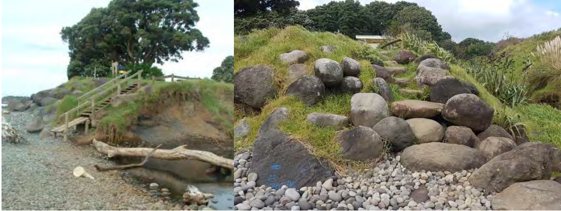
Photo 9 Step access to Bell Block Beach (previous wooden steps July 2005 and current rock steps May 2017)