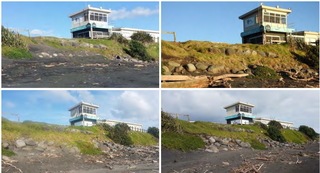
Photo 30 Fitzroy Beach rock rip rap (clockwise from top left; May 2015, June 2016, May 2017 and May 2018)

Coastal permit 4586 covers both the boat ramp and rock protection works in front of and adjacent to the Fitzroy Surf Life Saving Club. The boat ramp was in satisfactory condition at the time of the inspection. The condition of the bank appears to have remained stable over the last four years, with sand having built up at the base of the structure (Photo 30).