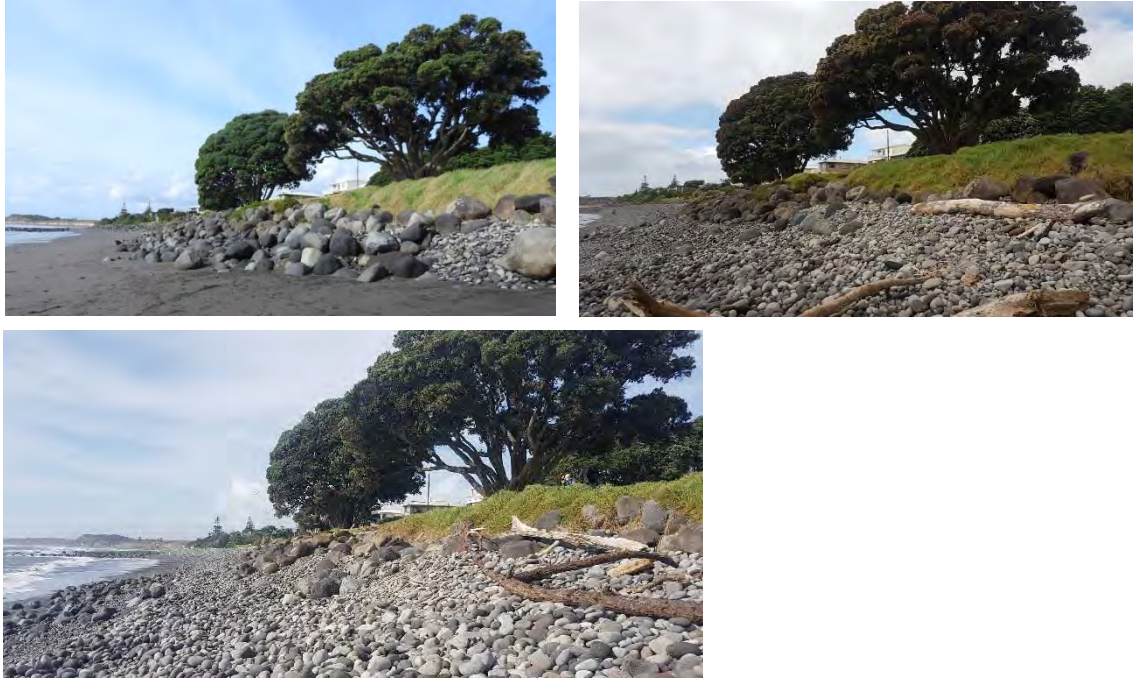
Photo 25 Bell Block seawall (Clockwise from top left; May 2016, May 2017 and May 2018)

An inspection took place on 9 May 2018 of the seawall at Bell Block Beach (permit 5102). The structure itself appeared to be in a good condition and no end effects were apparent. The volume of cobble and rock on the beach appeared to have built up even more than what was observed the previous year (Photo 25, Photo 26). NPDC cleared rocks from the boat ramp in December.