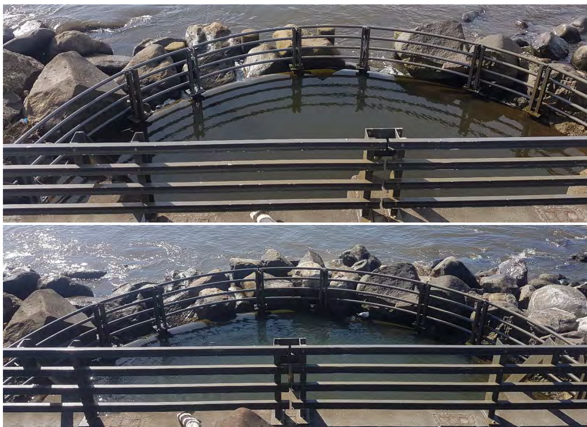
Photo 35 Mangaotuku Stream outlet before and after repair works (top; 8 Mar 2018, bottom; 9 Mar 2018)

The outlet structure from the Mangaotuku Stream (at the Lee Breakwater; permit 4594) was in a satisfactory condition when inspected in May (Photo 35). Earlier in the year, maintenance works were required under permit 4602 to ensure adequate protection of the outlet after boulders had been moved following a storm.