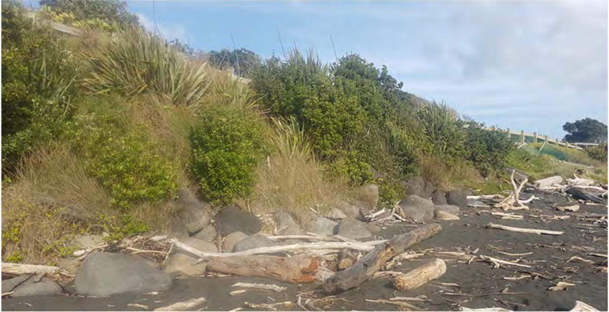
Photo 31 Rock rip rap and vegetated bank between the Fitzroy Surf Club and New Plymouth Board Riders Club

Coastal permit 4596 enables the maintenance of two stormwater outlets, one being just north of the East End Surf Life Saving Club and the other west of the Fitzroy Surf Life Saving Club. No issues were observed at either structure during their inspection in May (Photo 32).