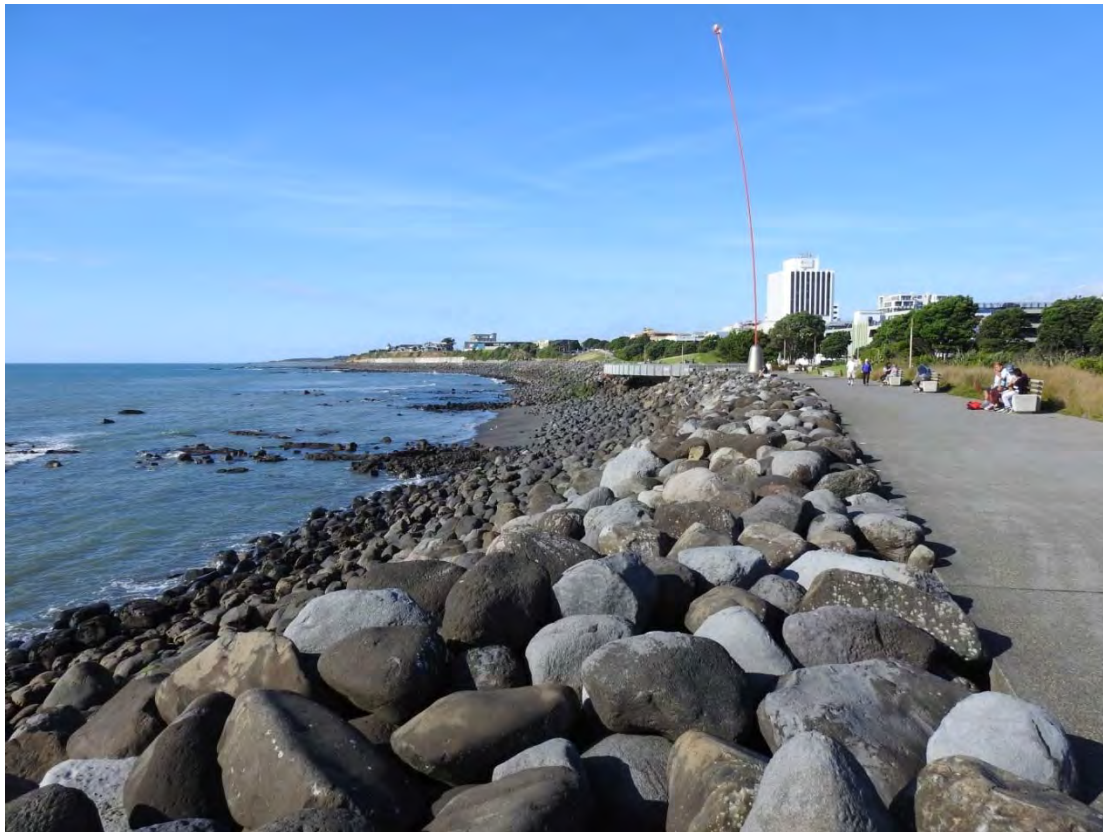
Photo 13 New Plymouth coastal walkway with rip rap seawall protection (April 2016)

In July 2001 the Council confirmed that NPDC proposed upgrades to the section of seawall between the Lee Breakwater and Belt Road would also be deemed as a permitted activity pursuant to Rule C1.1 of the RCP, provided the upgraded structure essentially remained within the general footprint of the existing structure. It was also recommended that the written agreement of Port Taranaki should be obtained.