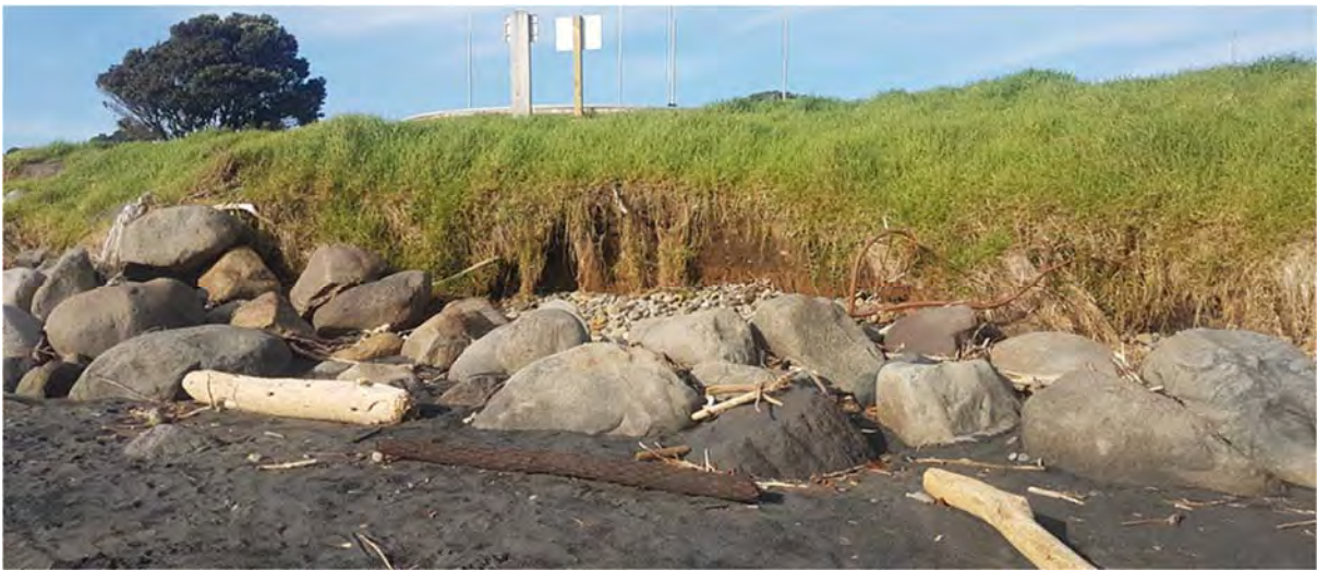
Photo 34 Scouring on true right bank of Te Henui river mouth (May 2018)

The rock rip rap protection on the right bank of the Te Henui Stream (associated with the bridge; permit 6242) appeared to be in good condition during the inspection.