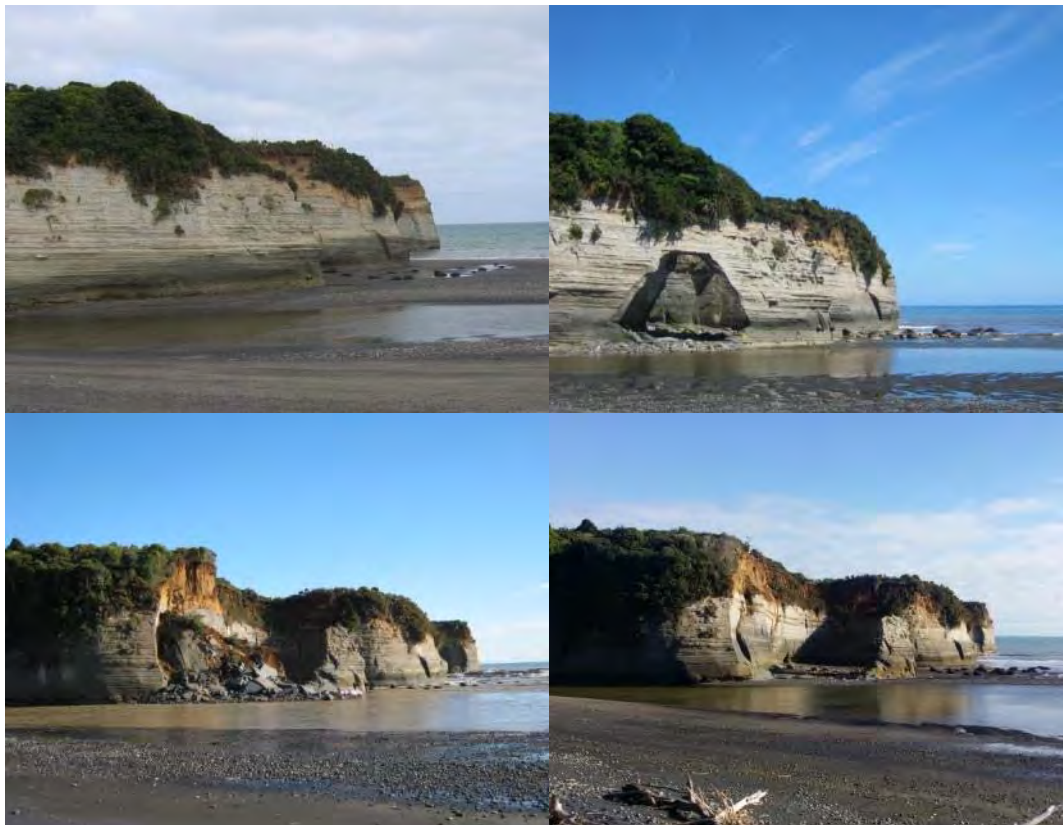
Photo 3 Urenui Beach cliff erosion (Clockwise from top left - August 2009, December 2012, June 2013, May 2015)