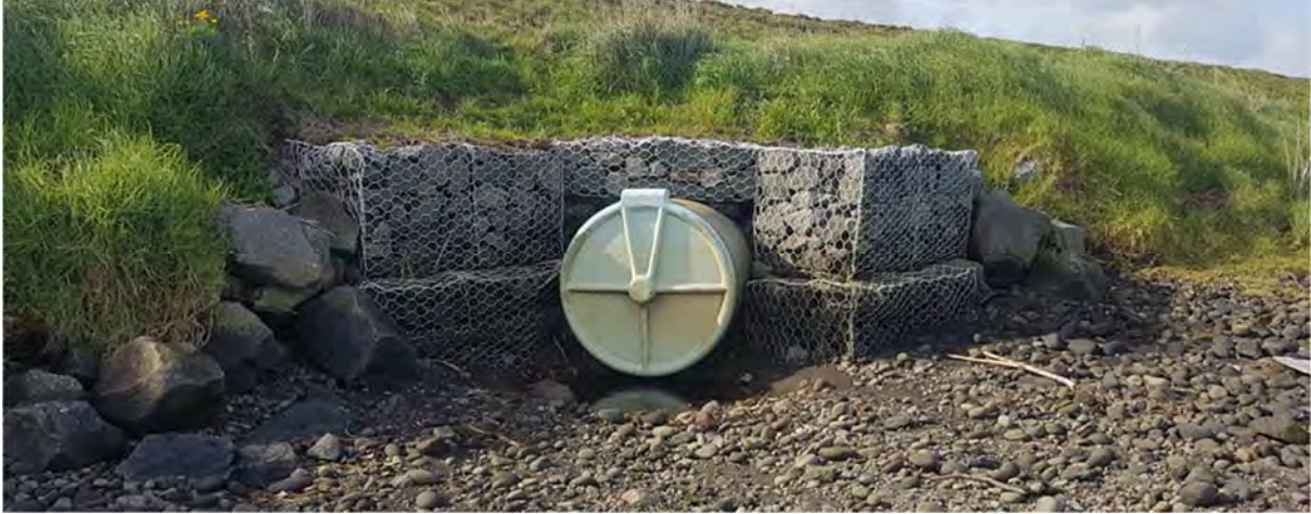
Photo 23 The stormwater outlet by the Atkinson Street/East Quay intersection (May 2018)

The stormwater outlet by the Atkinson Street/East Quay intersection (permit 6525) was also in good condition (Photo 23).