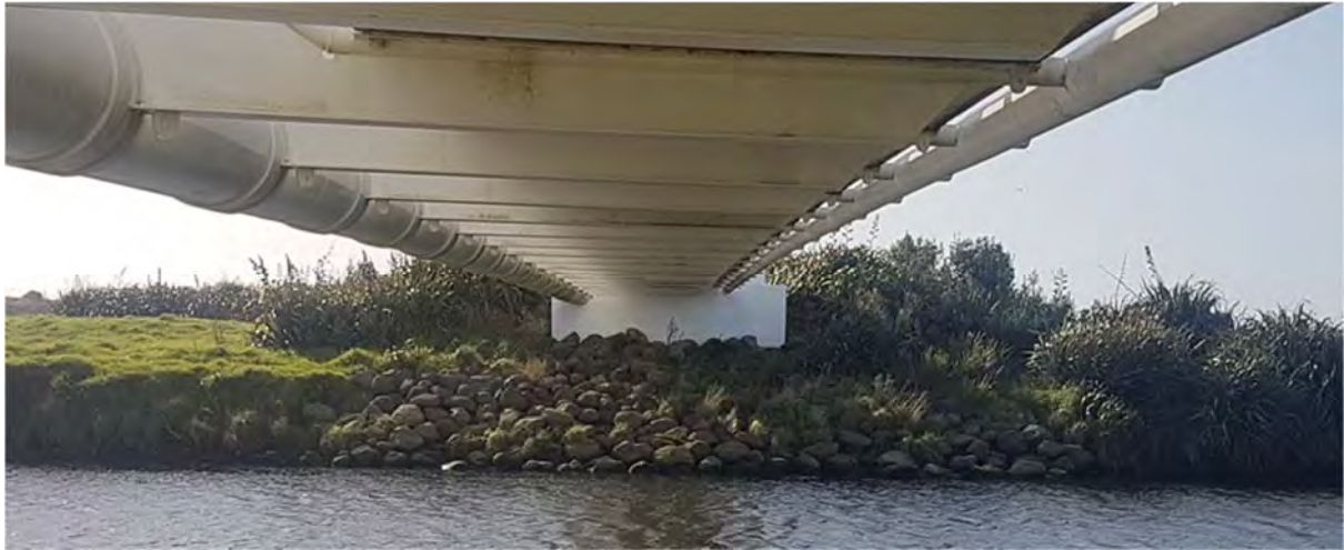
Photo 29 Te Rewa Rewa bridge over the Waiwhakaiho River (May 2018)