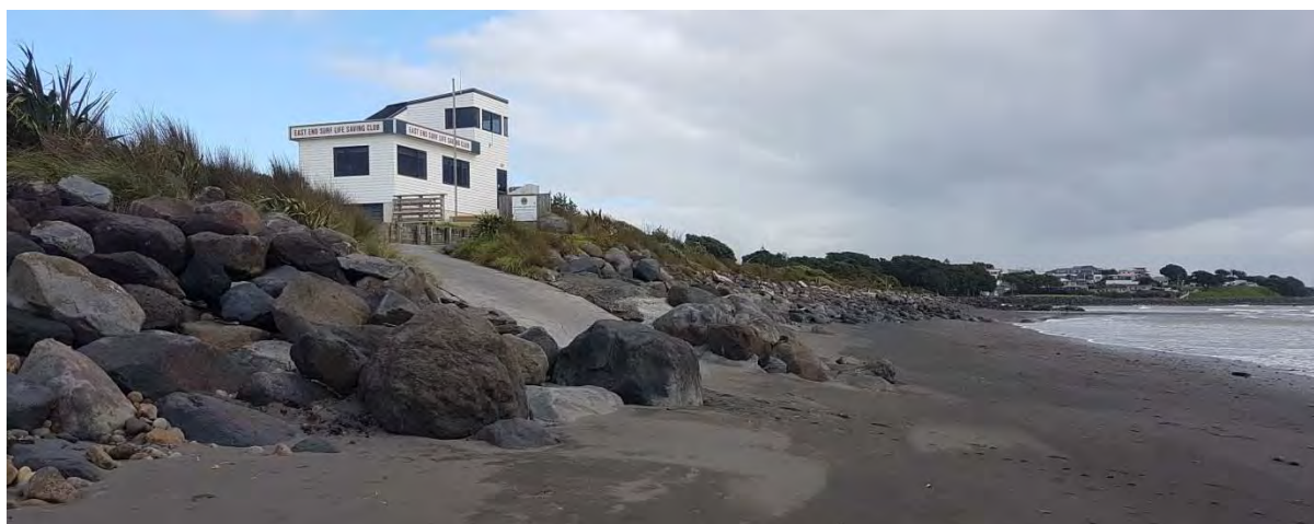
Photo 11 Rip rap seawall in front of East End Surf Life Saving Club (May 2017)

Changes to consent 4523 were granted in May 2005. These changes allowed an extension of the seawall from 290 m to 355 m.