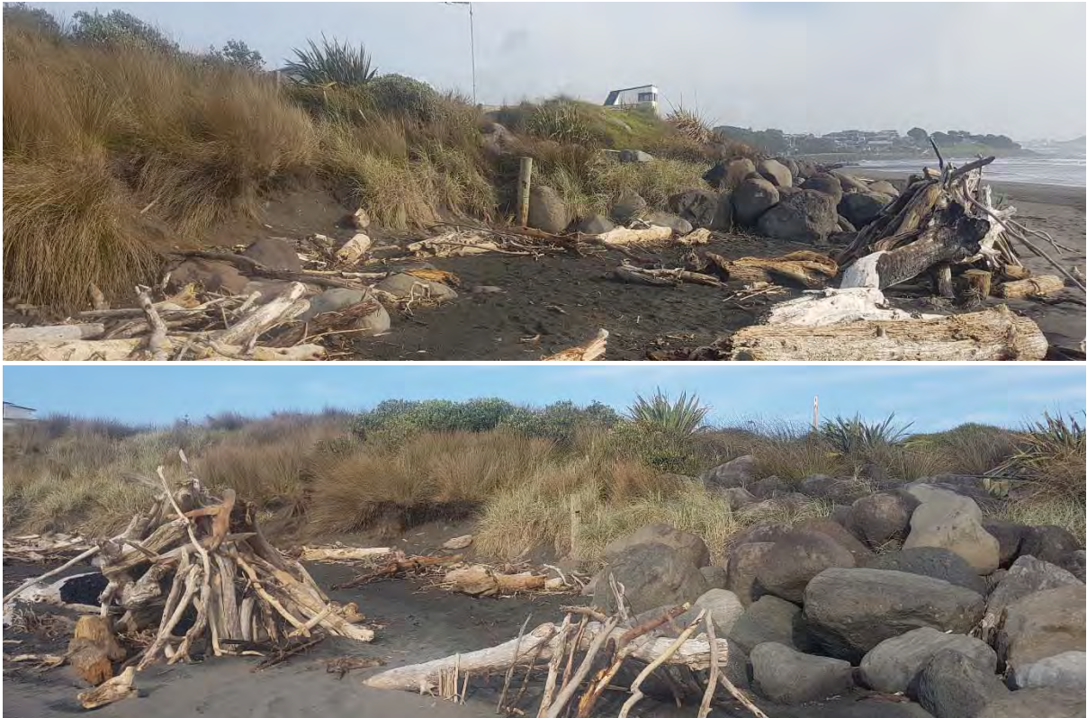
Photo 33 Potential end effects at East End beach access (May 2018)