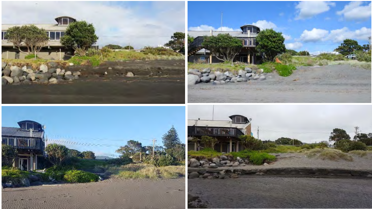
Photo 40 Oakura Beach change (clockwise from top left: June 2015, April 2016, May 2017, and May 2018).

NPDC straightened both the Wairau and Waimoku Streams during the year under review.