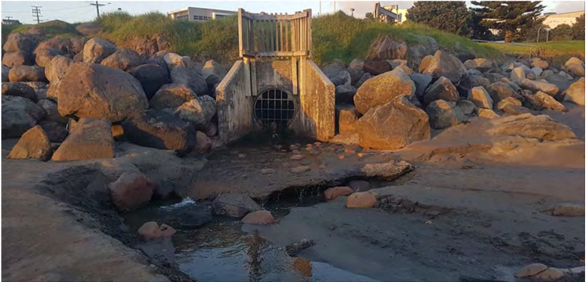
Photo 36 The Bayly Road stormwater outfall on Ngamotu Beach (May 2018)