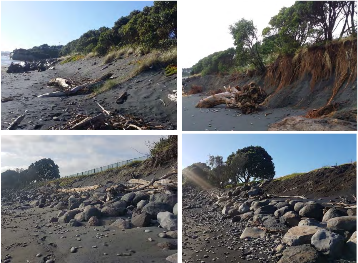
Photo 19 Recovery from end effects at Urenui Beach (clockwise from top left May 2015, June 2016, May 2017 and May 2018)

The gabion basket and rip rap in the estuary (permit 6411) were all in good order at the time of inspection (Photo 20).