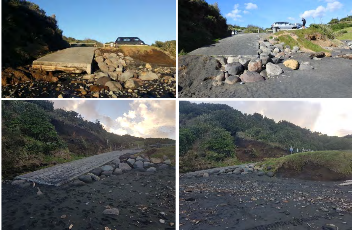
Photo 39 Boat ramp at Back Beach (top left; May 2015, top right; April 2016, bottom; May 2018)

An inspection of the boat ramp (permit 6553) was undertaken on 8 May 2018. The ramp was in good condition and was not being affected by any obvious erosion processes. The beach appeared to be in an accretion phase considering the volume of sand that had built up around the ramp (Photo 39). The eroding bank immediately west of the ramp did not appear to have worsened.