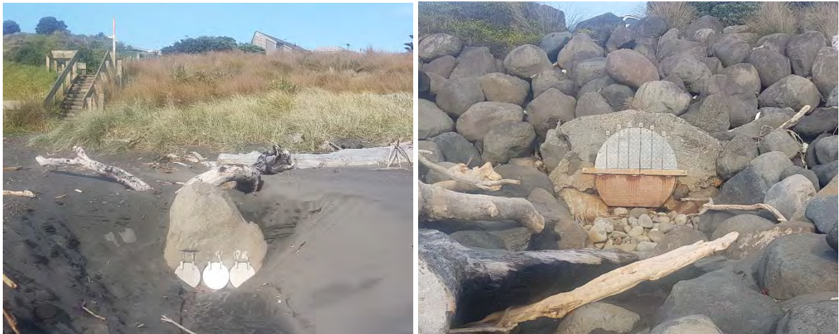
Photo 32 Fitzroy and East End stormwater outlets (permit 4596; May 2018)

Coastal permit 4596 enables the maintenance of two stormwater outlets, one being just north of the East End Surf Life Saving Club and the other west of the Fitzroy Surf Life Saving Club. No issues were observed at either structure during their inspection in May (Photo 32).