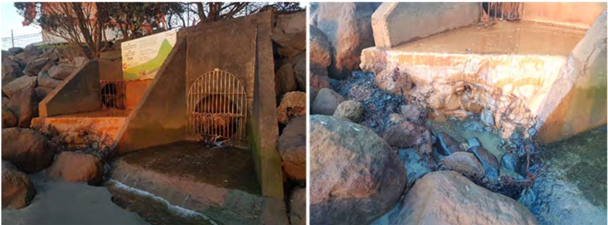
Photo 37 Hongihongi Stream outlet structure and rusted wire (May 2018)