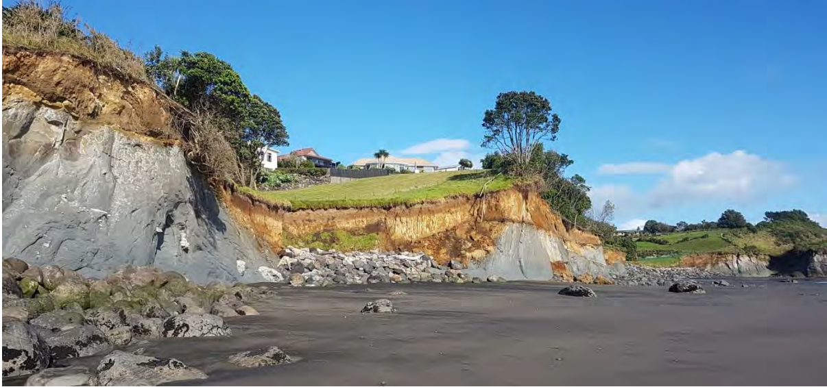
Photo 7 Eroding cliffs to the west of the seawall at Onaero (May 2017)