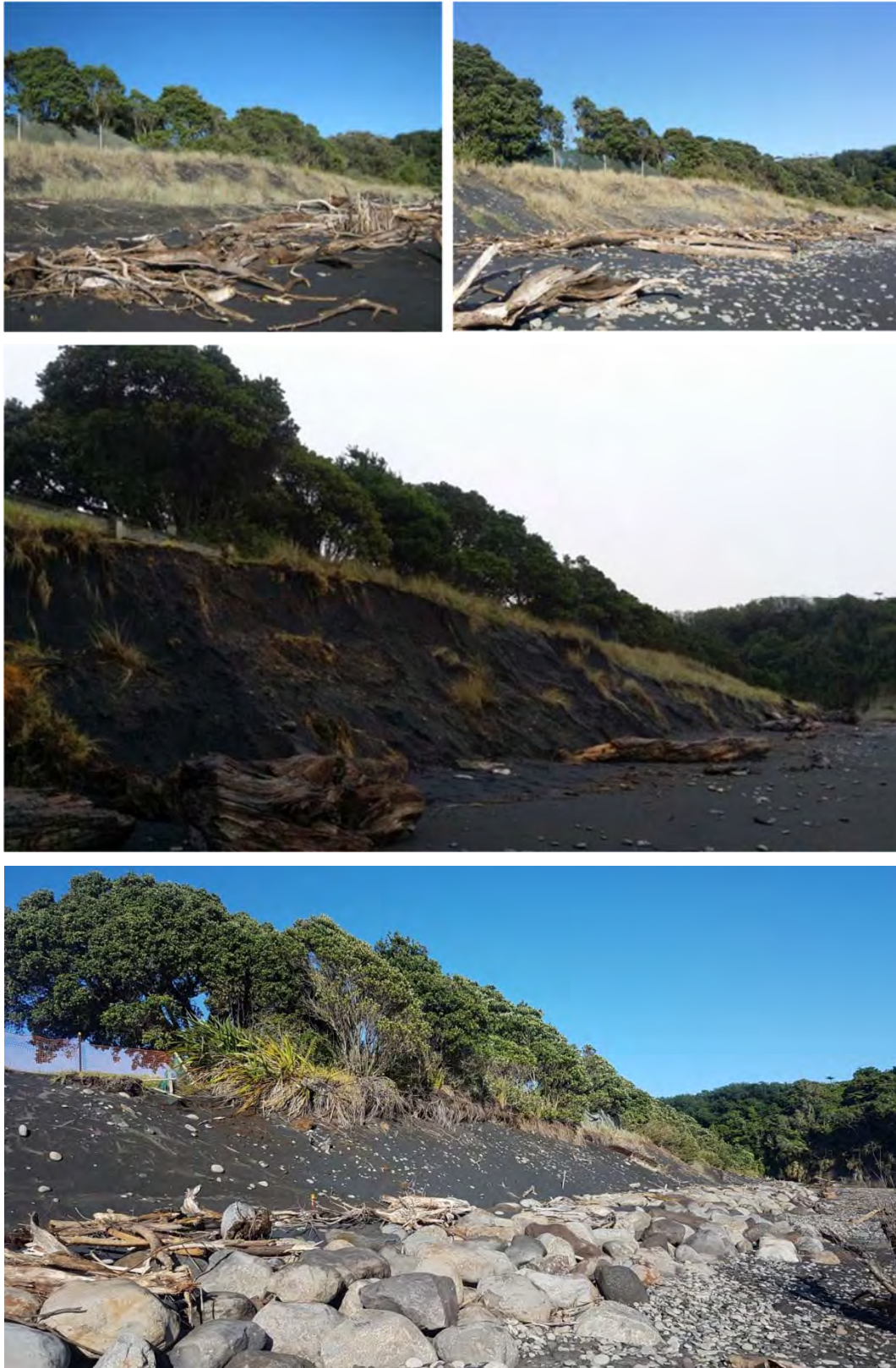
Photo 4 Sand push-up and dune restoration May 2014 and May 2015, major erosion June 2016, seawall extension May 2017

A permit for a further 311 m of rock rip rap seawall to the west of the existing Urenui seawall was granted in September 2007. However, only 151 m of the seawall was constructed during 2008. Coastal permit 7007-2