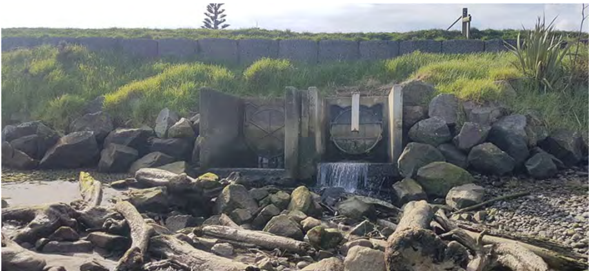
Photo 22 Stormwater outlet structure downstream of Atkinson Street (May 2018)

Coastal structures at Waitara were visited on 9 May 2018 in relation to five coastal permits. The stormwater outlet structure downstream of Atkinson Street (permit 4598) was in good condition and there was no evidence of erosion (Photo 22).