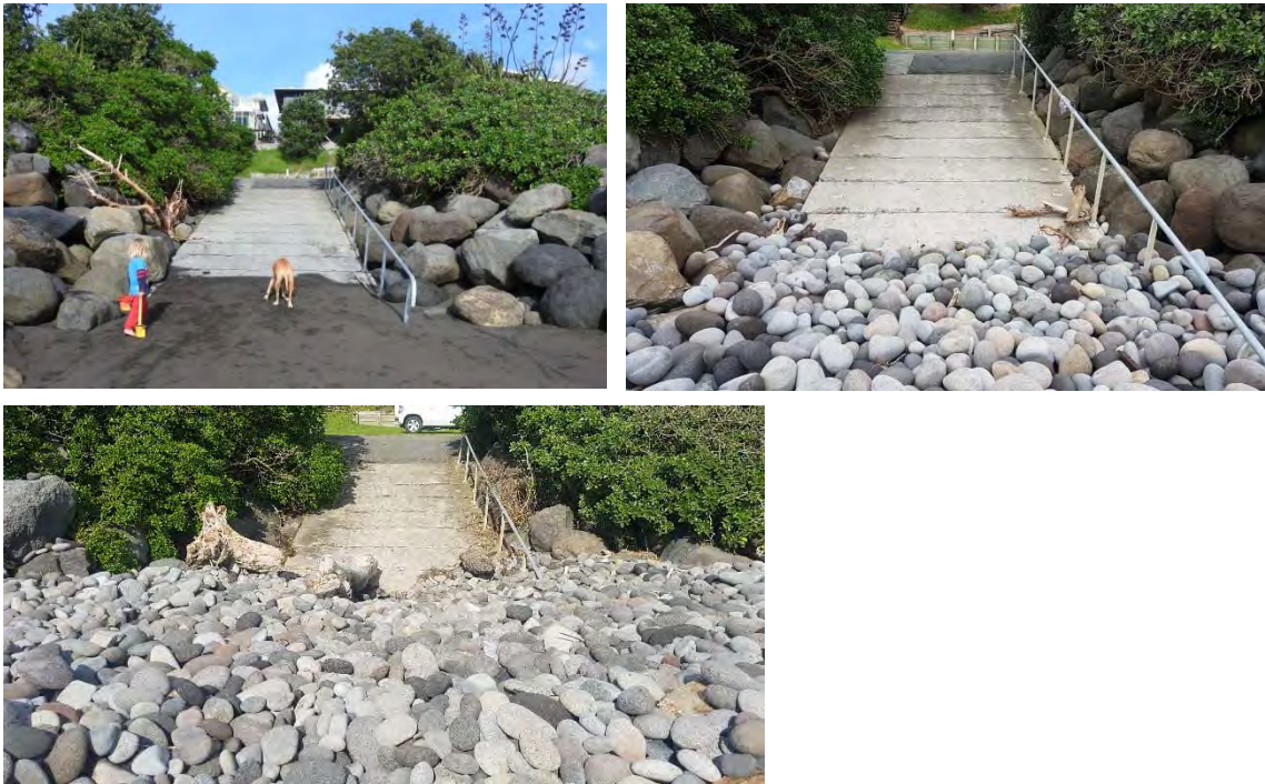
Photo 26 Bell Block seawall (Clockwise from top left; May 2016, May 2017 and May 2018)