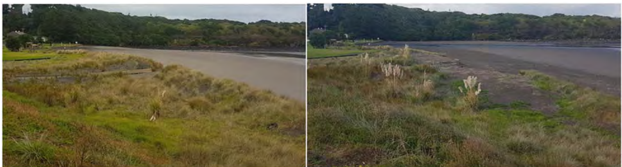
Photo 11 Fore dune in front of surf club at Opunake Beach, May 2018 (left) and April 2019 (right)