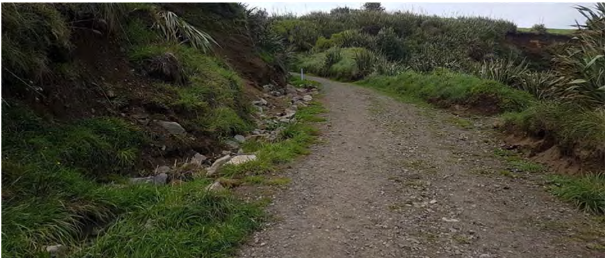
Photo 4 Beach track at the end of Denby Road leading to the gabion mattress consented under 6736 (April 2017)

STDC installed a gabion mattress at the bottom of the access track with the intention of improving access to the beach and helping control the erosion problems. The mattress measured 6 m x 2 m x 0.23 m in size and was placed on existing rocks. Surrounding the rocks a geo textile fabric was used to prevent the scouring of sand and to increase the longevity of the structure. Once completed, the structure was covered in concrete to further aid pedestrian access. The structure is authorised by coastal permit 6736 .