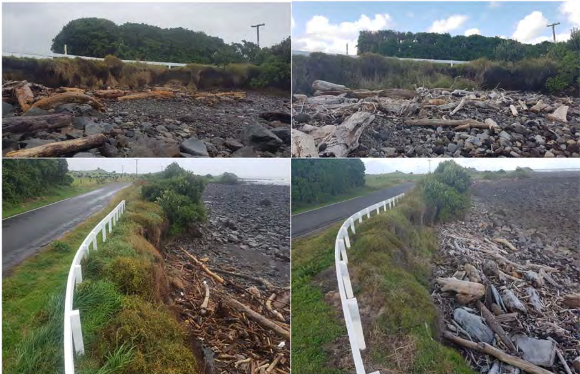
Photo 8 Bayly Road erosion, 11 May 2018 (left) and 12 April 2019 (right)

An inspection of the Bayly Road seawall was undertaken on 12 April 2019. As per the previous inspection, there were a number of sections along the scarp where scour and erosion were evident. This appeared to be a result of decreased wave protection due to slumping and/or loss of material from the seawall. Significant erosion at the intersection between Bayly and Coast Roads was still evident although the scarp was now covered with overgrown grass (Photo 8). The repair works which had been planned in the previous year had not been carried out. No wider environmental effects were apparent. The current state of this structure is non-compliant with resource consent 5512-2.