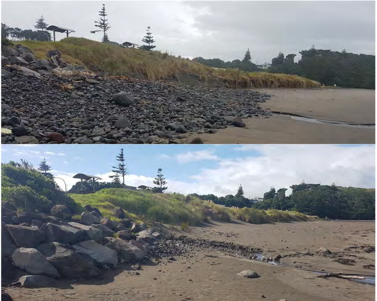
Photo 10 Dune toe recovery at Opunake Beach, May 2018 (top) and April 2019 (bottom)

in 2018 (Photo 10). STDC's dune lowering work was also evident (Photo 11). Further south along the beach, the exposed sections of the pylon retaining wall showed signs of deterioration.