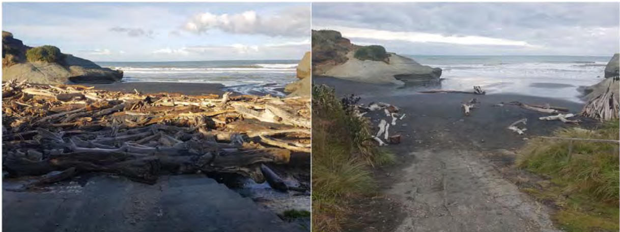
Photo 15 Caves Beach access ramp, May 2018 (left) and April 2019 (right)

Caves Beach was visited on 11 April 2019. The poor condition of the steps was comparable with previous inspections as they remained overgrown with grass in sections. However, the steps and ramp still provided access to the beach, as required by the resource consent. The beach itself had changed considerably since the previous inspection, with a greater volume of sand on the shore, and the driftwood pile having disappeared (Photo 15). Any scouring that had been previously noted at the base of the structure was now buried by sand.