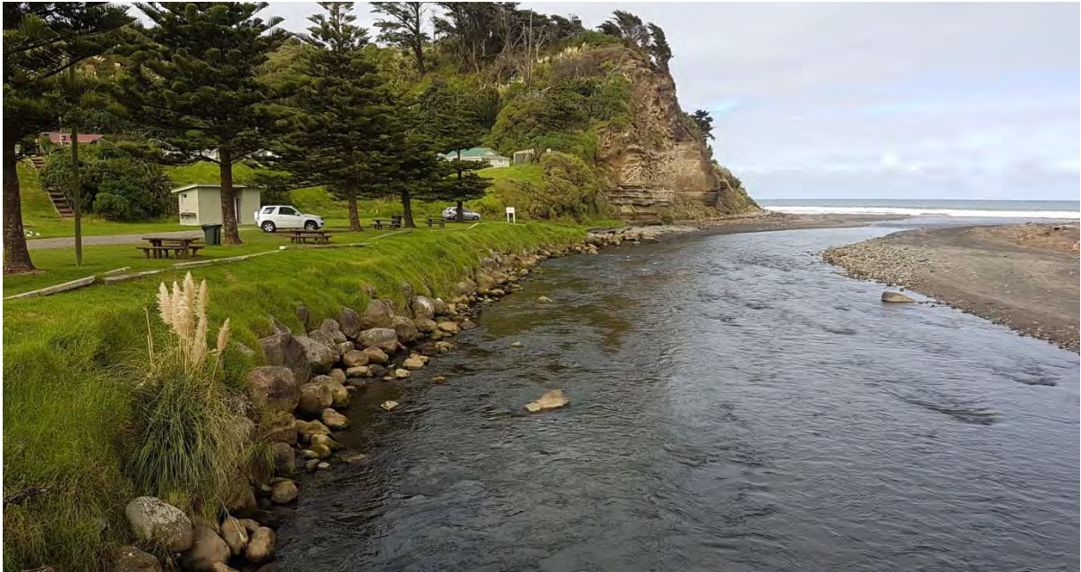
Photo 3 Looking downstream along rock protection works in the Kaupokonui Stream (April 2017)