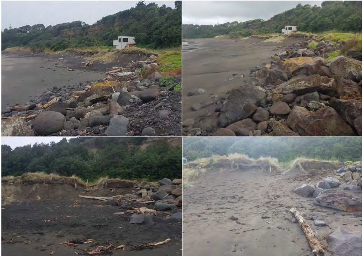
Photo 9 Northern end of Middleton Bay seawall, 11 May 2018 (left) and 12 April 2019 (right)

An inspection of the Middleton Bay seawall was undertaken on 12 April 2019. The structure and adjacent coast was found in similar condition to the previous inspection. Most of the seawall structure appeared to have remained in good condition, except for the northern end where it has deteriorated to a condition which is not compliant with resource consent 5504-1 (Photo 9). The obvious scouring adjacent to the northern end of the wall may be attributable to end effects, though it is likely accelerated by pedestrian beach access. Further around the bay, the dunes appeared to be in a similar condition to the previous year (Photo 9).