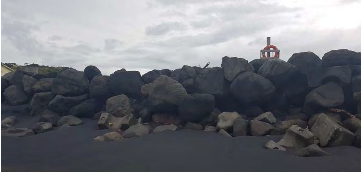
Photo 13 Perched boulders at the western end of the Mana Bay seawall, 11 April 2019