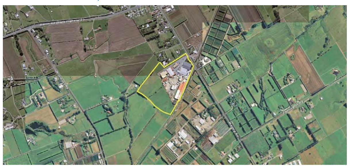
Figure 1 Aerial location map of Hickman JD 1997 Family Trust

This site was originally the Brixton Dairy Factory until it shut down and the discharge resource consent was transferred into Hickman JD 1997 Family Trust.