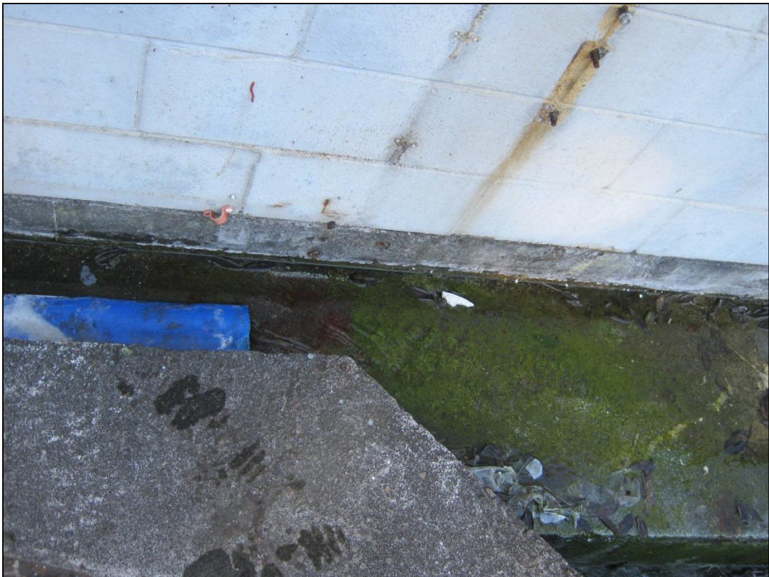
Photograph 2 Oil cooling water sampling point