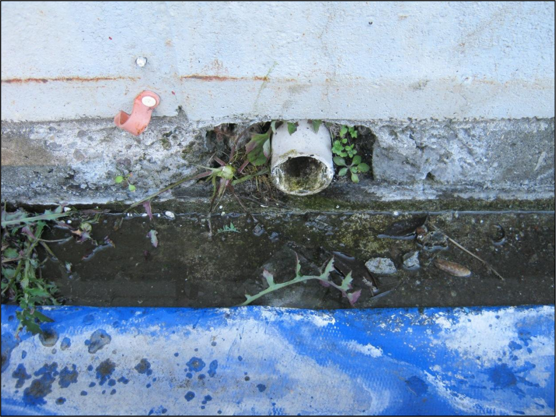
Photograph 3 Cooling water from evaporative condenser sampling point