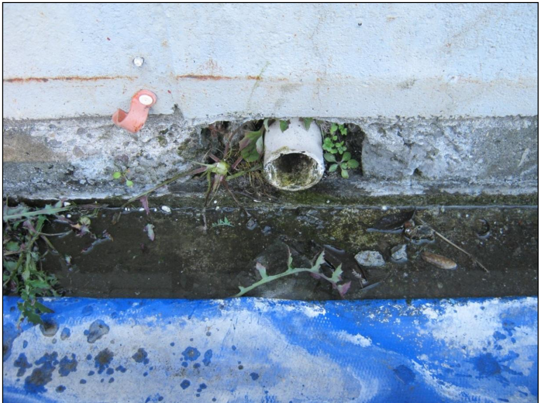
Photograph 3 Cooling water from evaporative condenser sampling point