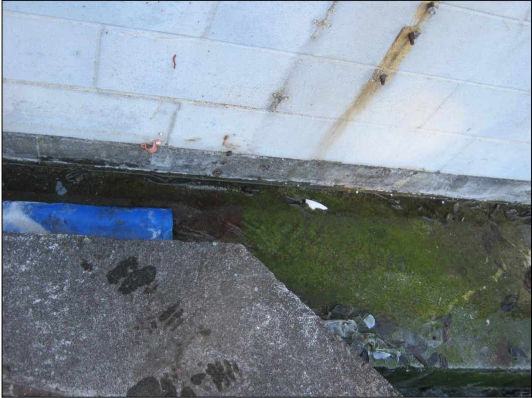
Photograph 2 Oil cooling water sampling point