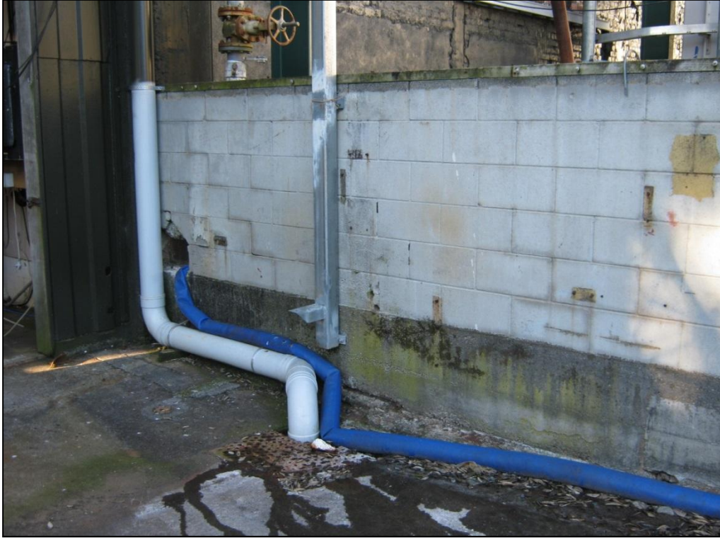
Photograph 1 Oil cooling water sampling point at end of blue hose

Samples of cooling water from the oil cooling water discharge point were collected on one occasion and analysed for chlorine, un-ionised ammonia, ammoniacal nitrogen, pH, chlorine, conductivity and turbidity.