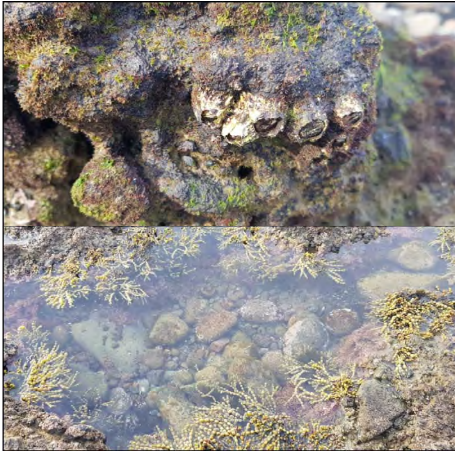
Photo 4 (A) Species characteristic of the exposed upper shore, within 5 m of the outfall; (B) Greater abundance and biodiversity in a rockpool approximately 15 m away from the outfall

In summary, the composition of intertidal species identified during this inspection was considered normal for this type of environment. No adverse effects on local intertidal communities were observed beyond the 5 m mixing zone as a result of the outdoor pool discharge, as specified in consent 2339-4.