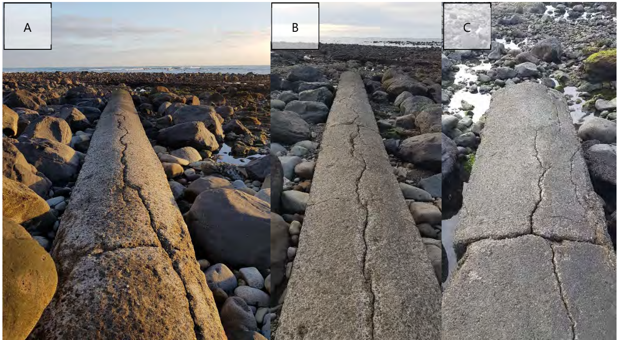
Figure 3 Surface cracks along ocean outfall, on A) 15 June 2017 and B) 6 May 2019, indicating little change in structural integrity. A close-up of the end of the pipe, also taken 6 May 2019, is shown in C).

The ocean outfall was also inspected during the site visit and found to be compliant with consent conditions. Although the structural integrity of the ocean outfall has declined in recent years, the inspection indicated little change since a 2.4 m length of the structure dislodged in the 2016-2017 year (Figure 3).