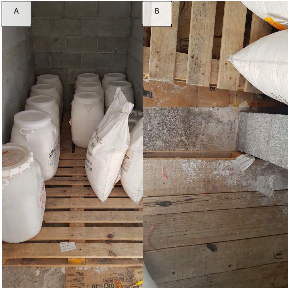
Figure 2 Maintenance shed, showing A) chemicals stored on pallets and B) chemical solids on floor of shed (6 May 2019)

An inspection of the maintenance shed was conducted on 6 May 2019. The shed was found to be mostly tidy, with all chemical sacks stored on pallets away from the door (Figure 2). However, some spilt chemical powder was noted on the floor of the shed, and was brought to the attention of the accompanying NPDC staff member (Figure 2).