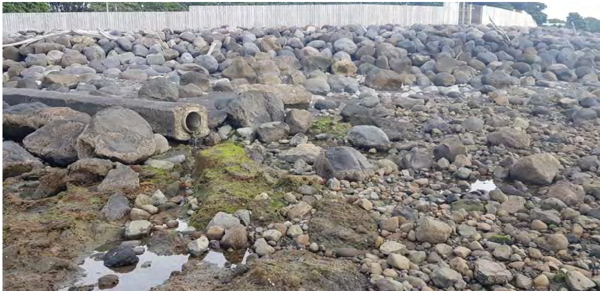
Photo 3 Ulva sp. cover extending up to 5 m east of the marine outfall

The cover of Ulva sp. appeared to track the flow path of discharge from the outfall and was similar to the extent of cover recorded during the February 2019 reef inspection (<5 m, Photo 3). In comparison with the intertidal community further down the shore, the area surrounding the pipe supported very little biomass and was less diverse (Photo 4). However, this assemblage was similar to that found on previous inspections in the vicinity of the pipe, and is typical for this height on the shore. It was also noted that some gastropods (e.g. Diloma aethiops ) found within 5 m of the marine outfall were more weakly attached to the substrate than gastropods found outside of the mixing zone. Attachment strength is a key determinant of gastropod survival on the rocky shore, as weakly attached individuals are more likely to be dislodged by predation and wave action, leading to higher mortality rates (O'Dwyer, Lynch & Poulin, 2014). However, these adverse effects were not detected outside of the 5 m mixing zone.