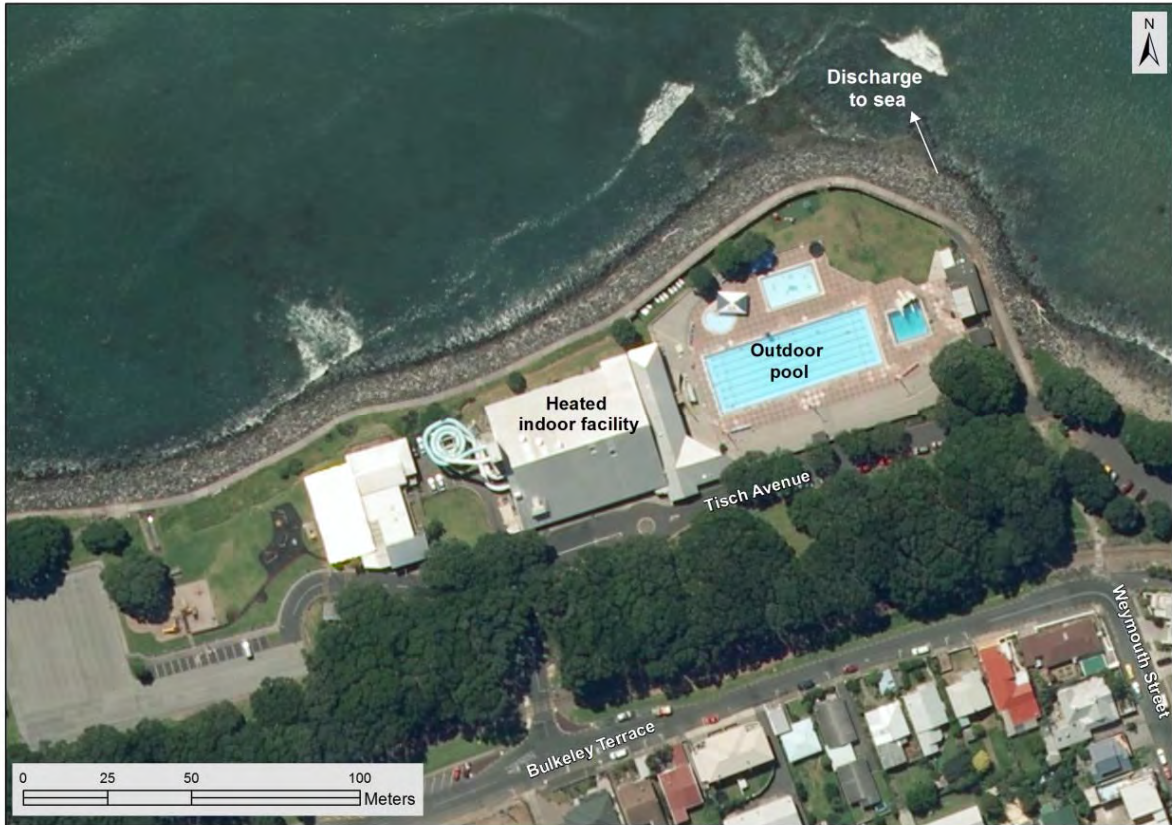
Figure 1 Location of the Aquatic Centre