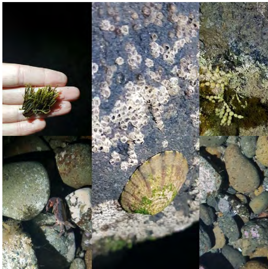
Photo 3 A range of species identified during the intertidal reef inspection (12 February 2019)

Upper shore species diversity was found to be considerably higher than recorded in recent surveys, indicative of an improvement in reef health since the completion of works at the Aquatic Centre on 23 September 2017 (Photo 3).