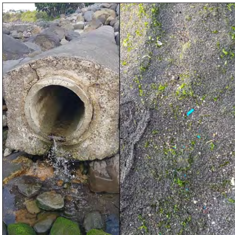
Photo 2 (A) Low flow discharging from the outfall at 15:30 (6 May 2019), with blue paint chips visible; (B) Close-up of paint chips

A reef inspection was carried out during the next low tide, which was at 16:47 on 6 May 2019 (0.4 m). Upon arrival at the reef at approximately 15:30, a low flow was found to be discharging from the marine outfall (Photo 2). There were no objectionable odours, or conspicuous films or scums, at the discharge point. As with previous inspections, blue paint chips were found in the immediate vicinity of the outfall (Photo 2). The outdoor pool had only been partly emptied since the morning inspection, indicating compliance with the consent condition of only discharging in batches within two hours either side of high tide. The reef inspection found no detectable chlorine odour or any visual issues outside of the discharge mixing zone.