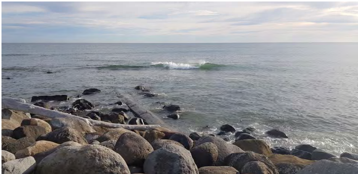
Photo 1 Shoreline seawater sampling adjacent to the marine outfall (6 May 2019)

Pool water testing found that the concentration of total chlorine was compliant with the limit set out in condition 4 of resource consent 2339-4 ( <0.5 \text{ g/m}^3 , Table 1). Aquatic Centre staff were advised of this, and that they could begin emptying the pool within 2 hours of the next high tide (providing compliance with condition 8). High tide was at 10:29 (NZST) on the day of the inspection. Samples were collected from the outdoor pool at 08:30, prior to emptying, and from the Tasman Sea at 09:15 (Photo 1).