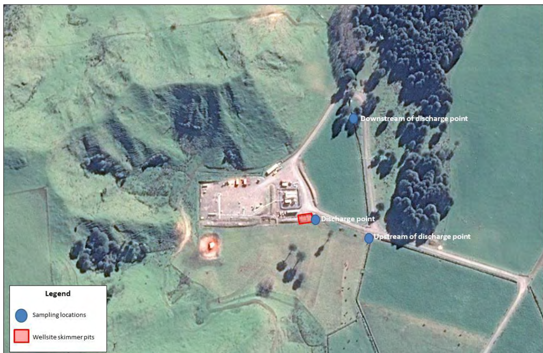
Figure 2 Stormwater and surface water sampling locations at the Puka A wellsite

The receiving surface water body was inspected regularly in conjunction with site inspections. No effects were observed and the stream appeared clear with no visual change in colour or clarity. In addition, no odour, oil, grease films, scum, foam or suspended solids were observed in the stream as a result of activities at the Puka A wellsite during the monitoring period.