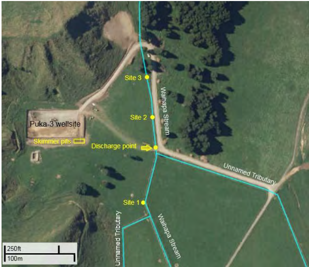
Figure 1 Biomonitors sites in the Waihapa Stream in relation to the Puka-3 wellsite

Samples were preserved with Kahle's Fluid for later sorting and identification under a stereomicroscope according to Taranaki Regional Council methodology using Protocol P1 of NZMVG protocols of sampling macroinvertebrates in wadeable streams (Stark et al, 2001). Macroinvertebrate taxa found in each sample were recorded as: