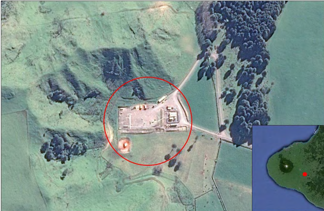
Figure 1 Aerial view depicting the locality of the Puka A wellsite, with approximate regional location (inset)