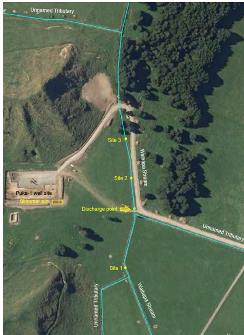
Figure 1 Biomonitoring sites in the Waihapa Stream in relation to the Puka-1 wellsite

Samples were preserved with Kahle's Fluid for later sorting and identification under a stereomicroscope according to Taranaki Regional Council methodology using Protocol P1 of NZMWG protocols of sampling macroinvertebrates in wadeable streams (Stark et al, 2001). Macroinvertebrate taxa found in each sample were recorded as: