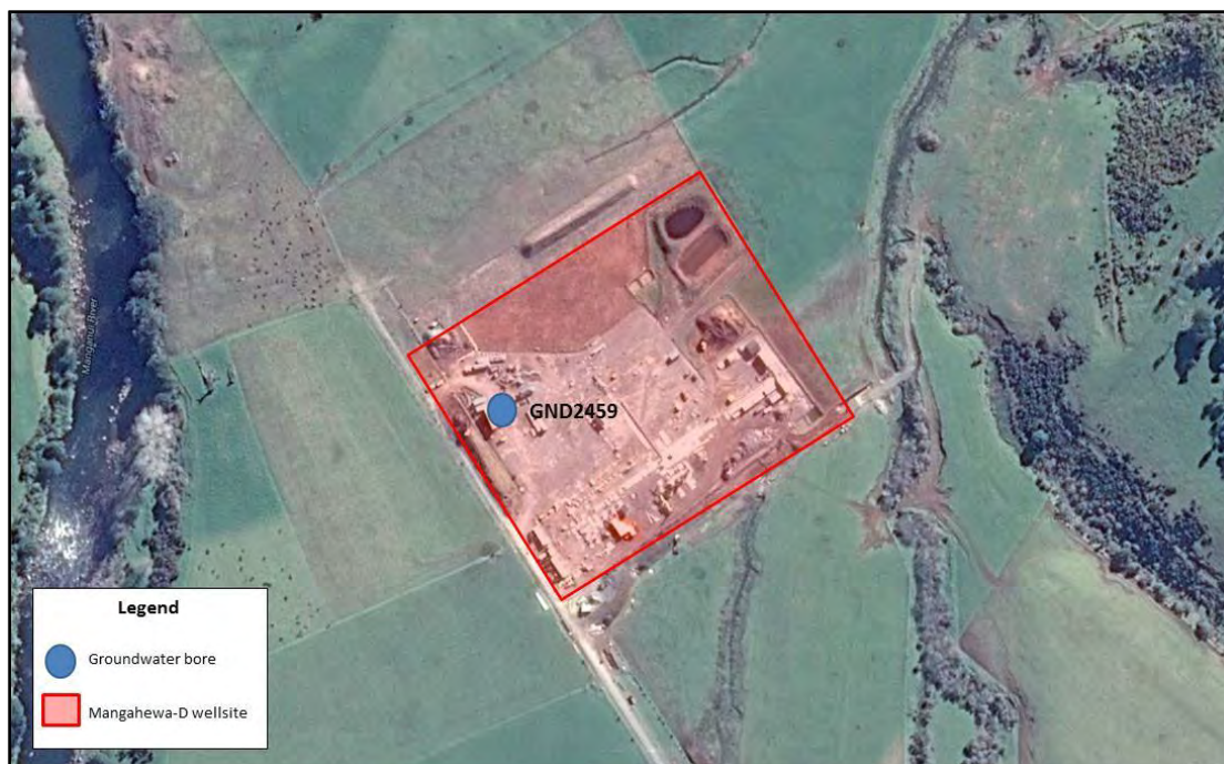
Figure 5 Aerial photo depicting the locality of the Mangahewa-D wellsite and associated groundwater monitoring bore

The monitoring programme provides for an initial 12 months of groundwater monitoring. Groundwater samples will be obtained from the sampling site recorded in Table 3 at the following specified intervals: