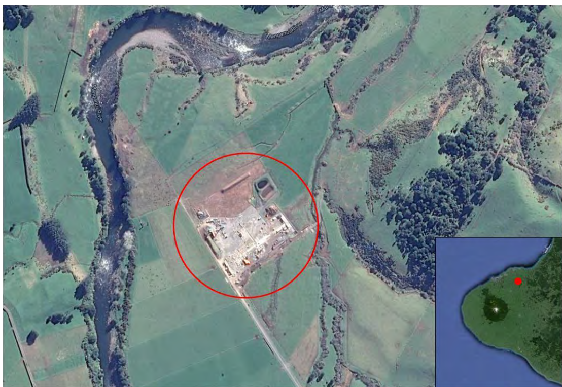
Figure 1 Aerial view depicting the locality of the Mangahewa-D wellsite, with approximate regional location (inset)

The nearest residence is approximately 640 m away from the wellsite. Bunding, earthworks and good site location helped minimise any potential for off-site effects for the neighbours.