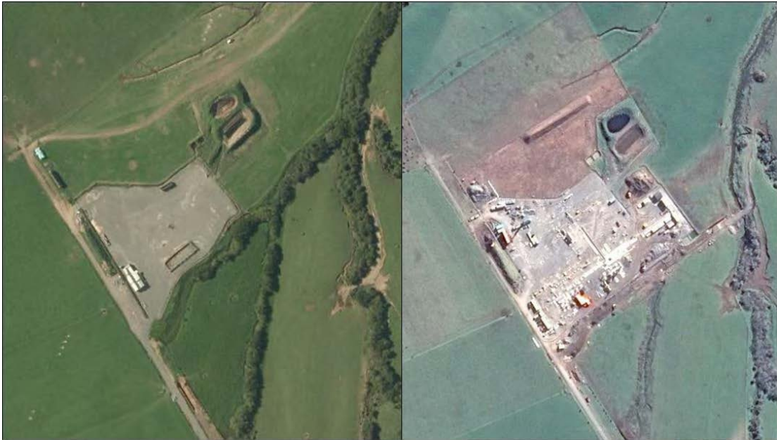
Figure 2 Aerial view of the original Mangahewa-D wellsite (left) and aerial view of the Mangahewa-D wellsite post boundary extension and facility upgrade (right)