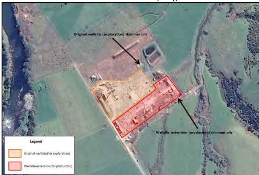
Figure 3 Aerial view of the Mangahewa-D wellsite highlighting the approximate extents of the original (exploration) and new (production) sections of the wellsite, in addition to the localities of the skimmer pits.

Analysis of the samples obtained showed that all but four of the discharges would have complied with resource consent conditions should a discharge have occurred. Results are detailed in Table 1 and sampling locations can be seen in Figure 3.