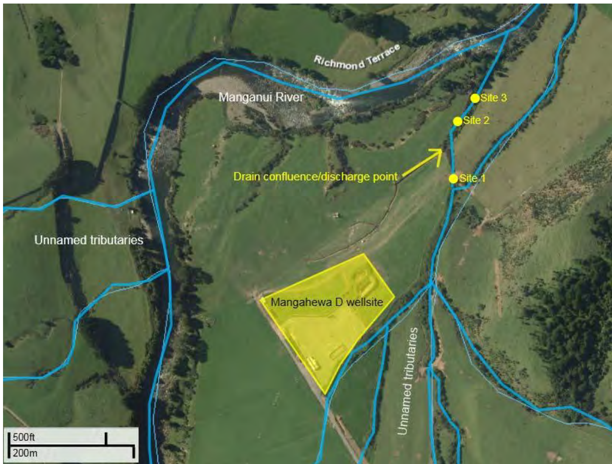
Figure 1 Biomonitoring sites in the unnamed tributary of the Manganui River sampled in relation to the Mangahewa D wellsite

Samples were preserved with Kahle's Fluid for later sorting and identification under a stereomicroscope according to Taranaki Regional Council methodology using Protocol P1 of NZMWG protocols of sampling macroinvertebrates in wadeable streams (Stark et al, 2001). Macroinvertebrate taxa found in each sample were recorded as: