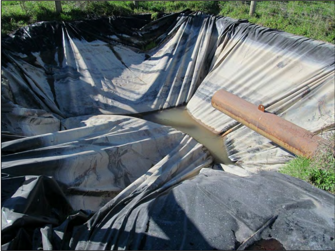
Photo 1 Ballooned lining of the second skimmer pit due to groundwater intrusion, located on the exploration section of the Mangahewa-D wellsite

The skimmer pits were repaired and back to full operational and compliant capacity in due course. This was achieved by pumping out the groundwater that had collected behind the lining. In addition the discharge pipe at the exit of the second pit was also elevated, which allowed for more storage capacity within the pit.