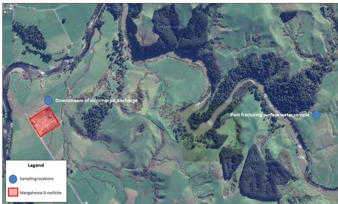
Figure 4 Surface water sampling locations during the period under review

The receiving surface water body was inspected regularly in conjunction with site inspections. No effects were observed and the stream appeared clear with no visual change in colour or clarity. In addition, no odour, oil, grease films, scum, foam or suspended solids were observed in the stream as a result of activities at the Mangahewa-D wellsite during the monitoring period.