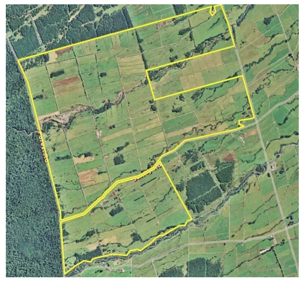
Figure 1 Location of the site and surrounding area. The property boundaries are marked in yellow

A detailed description of how drilling waste is generated in Taranaki, the contaminants associated with the waste, and the landfarming process can be found in the <u>Review of Petroleum Waste and Land Farming</u> (Pattle Delamore Partners, 2013) prepared for the Council. A summary can be found in section 1.1.6 below.