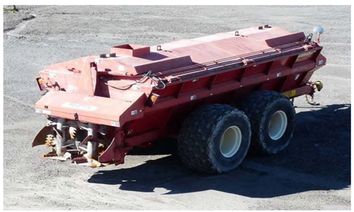
Photo 1 Spreader used for dispersing drilling waste over the landfarming area.

Stockpiled or imported top soil was spread over the disposal area and then reseeded so that it returns to pasture.