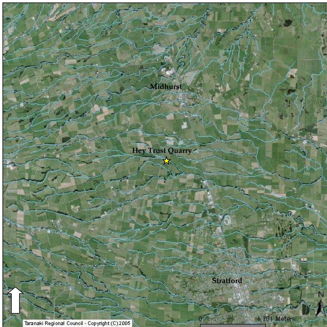
Figure 1 Approximate location of Hey Trust Quarry on Monmouth Road

The consent holder's quarry is located off Monmouth Road, Stratford, on the true right bank of the Kahouri Stream (Figure 1). The consent holder operates a small quarry on a part time basis to supply aggregate mostly for use on their farm, however it occasionally supplies the local market on demand.