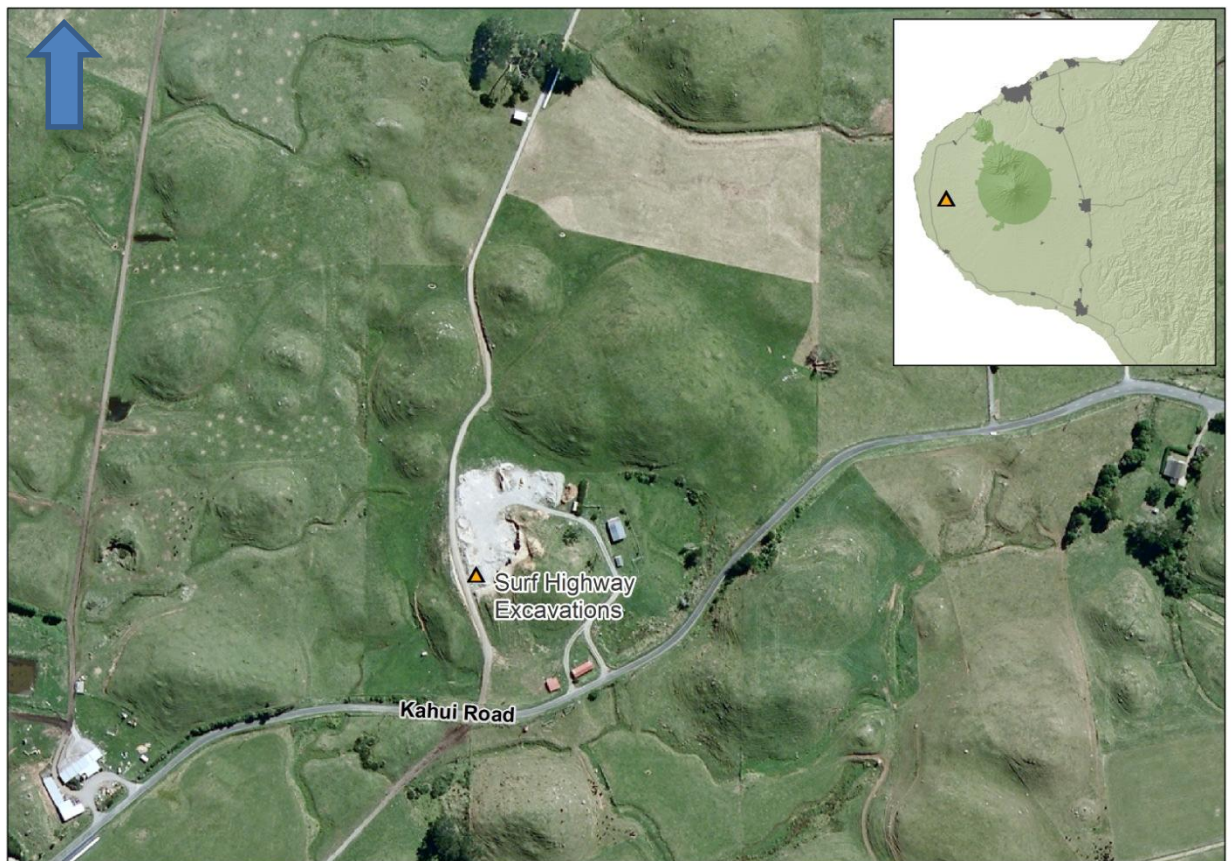
Figure 1 Location of Surf Highway Excavations Quarry

The quarrying area is approximately 1 hectare and the land has a slight slope to the northwest where storm water can run into a pond and soak away.