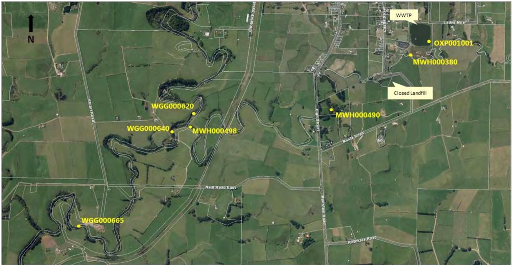
Figure 3 Aerial map showing location of chemical and biomonitoring sampling sites