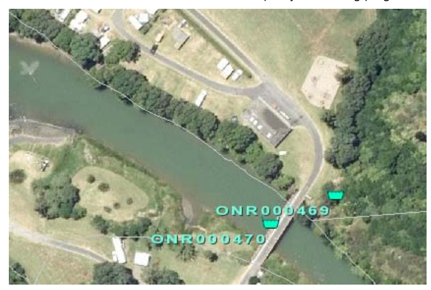
Figure 5 Location of additional sampling site Onaero trib (ONR000469), upstream of pump station bridge

During the second site inspection at Onaero Bay Holiday Park on 10 January 2022, the Council was notified that there had been some observations of a thick scum floating on the Onaero River just upstream of the pump station bridge. Additional samples were taken from a small tributary just upstream of the bridge (ONR000469, Figure 5), believed to be the source of the scum, which returned high faecal bacteria counts and triggered a series of resamples by the Council including testing for PCR markers to determine whether human, ruminant, avian or other. The results of the PCR testing determined the counts were not caused by human contamination, and were inconclusive in determining an origin of the source. The Onaero River continued to be monitored closely throughout the remainder of the summer bathing season via the Councils 'Can I Swim Here' recreational water quality monitoring programme.