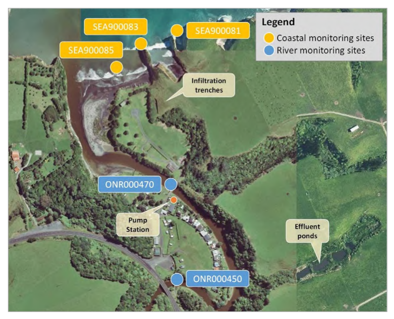
Figure 2 Map of sampling sites and other features of interest at Onaero Bay Holiday Park

In addition to water quality monitoring during inspections, bacteriological samples were also collected from in front of the Onaero Surf Club (SEA900085) as part of the Council's 'Can I Swim Here' Programme over the summer bathing season (November through March).