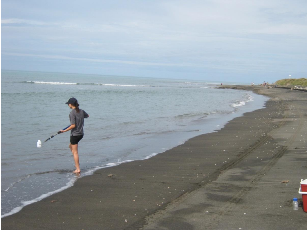
Photo 5 Monitoring of site SEA907095 during the February 2014 inspection