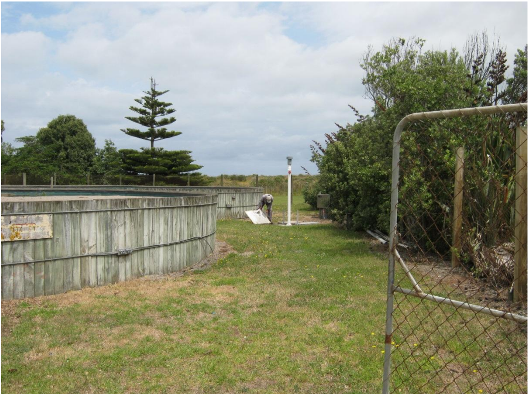
Photo 2 Adjustment of the pump station during the December 2014 inspection