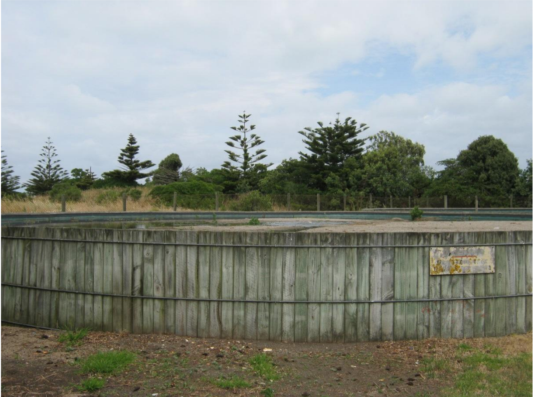
Photo 1 Ponding of water on top of the sand filters during the December 2014 inspection