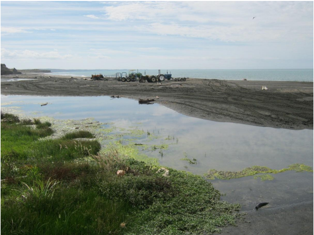
Photo 4 Poned groundwater seepage at the top of Wai-inu Beach, sampled to establish if leaching occurs from the septic system