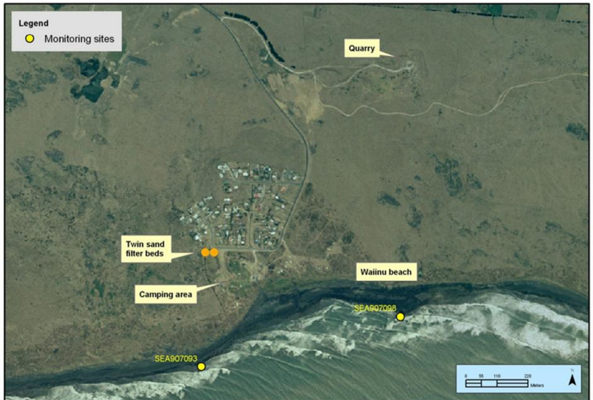
Figure 1 Location of bacteriological sampling sites and treatment system

wastewaters. Air inspections focused on plant processes with associated actual and potential emission sources and characteristics, including potential odour, dust, noxious or offensive emissions.