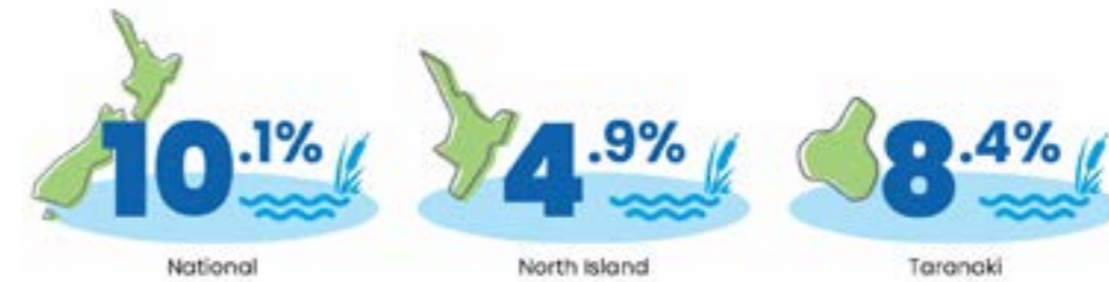
Remaining wetland habitat.

On the ground, identification of swamp forest and urban wetland habitats, in addition to updated modelling of historical wetland extent, has helped improve our wetland extent estimations. During the past five years, 250ha