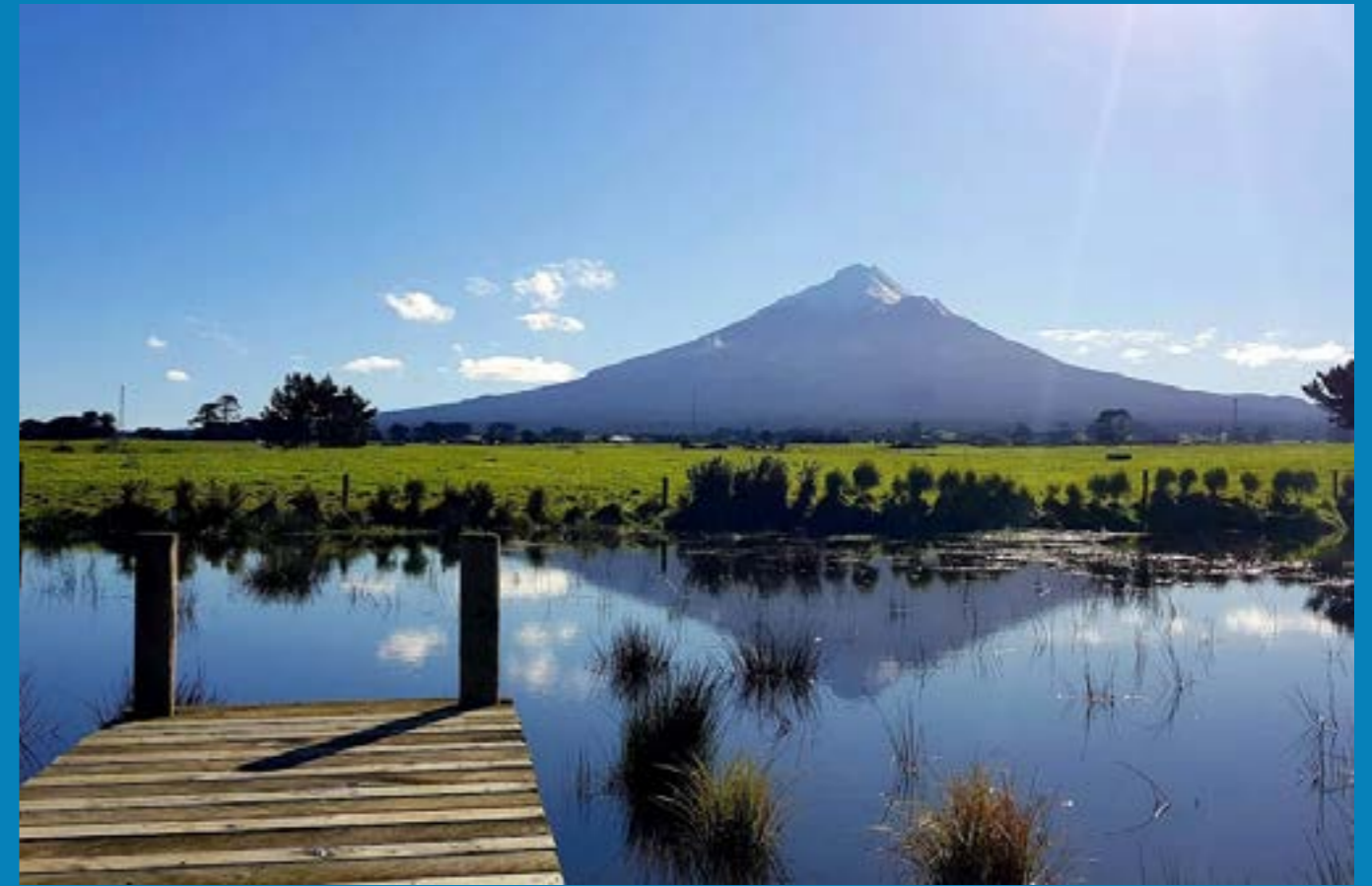
The constructed wetland at Awatuna with Taranaki Maunga in the background.