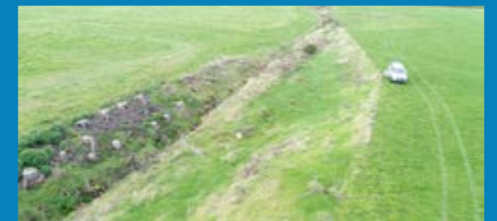
The site of the wetland in May 2019, prior to construction.

"We hope this project will inspire others to consider what they could do to improve water quality in their local area."