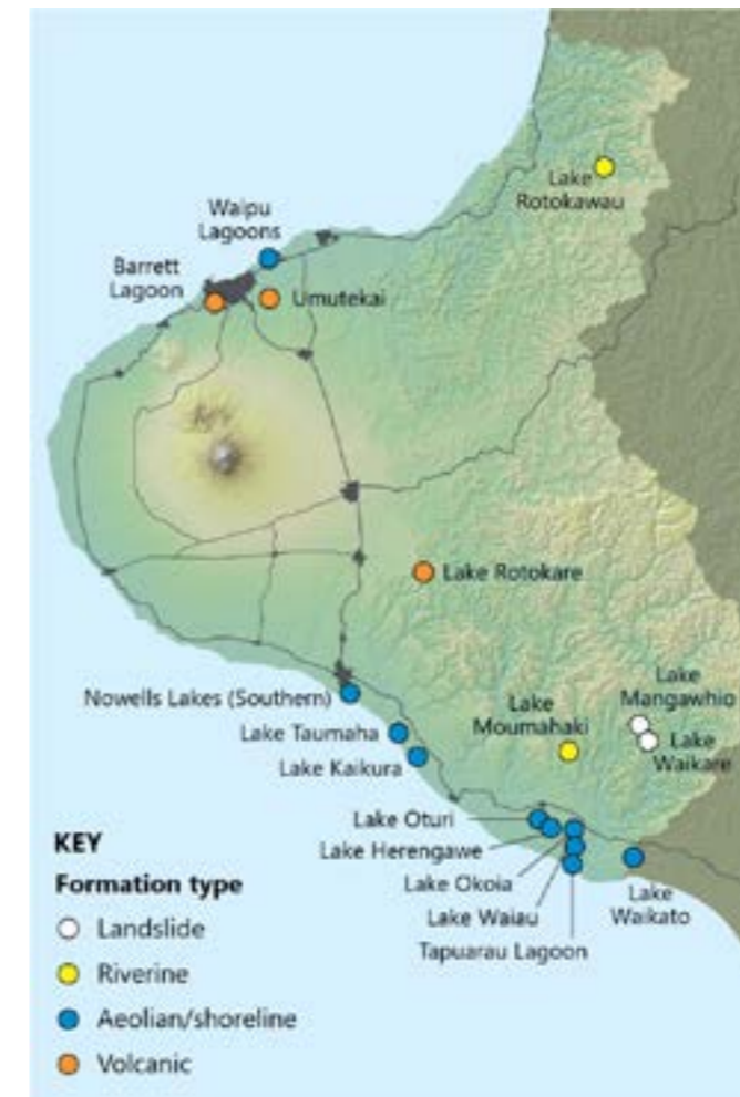
The 17 lakes, comprising four geomorphic types, that have been identified as possible candidates for inclusion in future long-term monitoring.

and Mangawhio) or high condition (Kaikura), with LakeSPI indices between 21% and 66%. The native condition scores of the lakes range from 28% to 52%, while the invasive impact scores ranged from 19% to 79%. For the LakeSPI index and the native condition score, higher scores represent better ecological health whilst for the invasive impact assessment the reverse is true. In time, further surveys will provide an overall picture of the ecological health of Taranaki lakes.