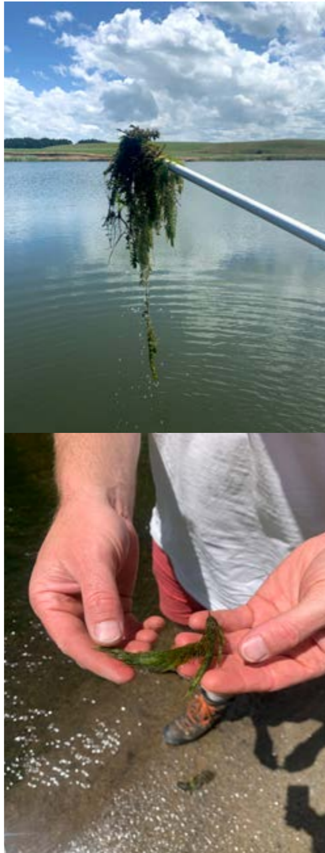
The invasive weed hornwort has established in Lake Rotorangi.

Hornwort is transferred between lakes by contaminated boats and trailers, fishing equipment and eel nets. It can contribute to blockages of waterways and infrastructure and once established, is difficult and expensive to remove. People who see or suspect hornwort should report it to the Council or the Department of Conservation.