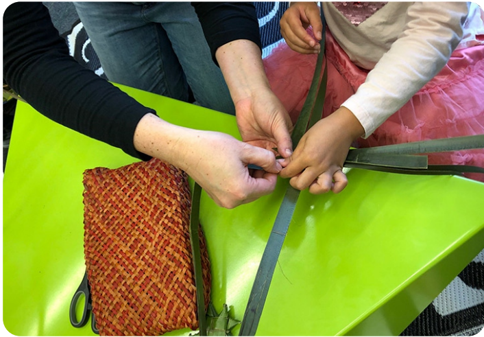
Inglewood Primary School have really enjoyed learning to weave kete and kono. #māoriperspectives