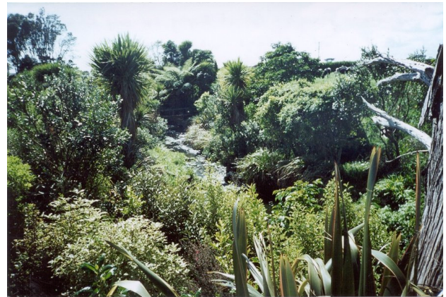
Retirement fencing and planting of the riparian margin

allow the landowner to calculate the costs for any section and includes all operations for successful establishment. The last table provides a list of plant species available through Council's native plant scheme that are suitable for the farm's climatic location. Plants can then be ordered through a Land Management Officer.