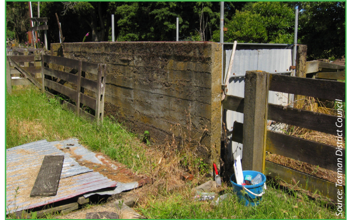
Rectangular shower dip with sump (under corrugated iron)

arsenic if they are collected from surface water downstream of a sheep dip or from a bore located within 300 metres of a sheep dip. Meat, eggs and vegetables raised on a sheep dip site are potential sources of human exposure to arsenic. Eating wildfoods (freshwater mussels, koura and watercress etc.) collected downstream from a sheep dip may also be a source of arsenic exposure. Mushrooms and edible plants (e.g. puha) or ferns should not be collected from the vicinity of a sheep dip.