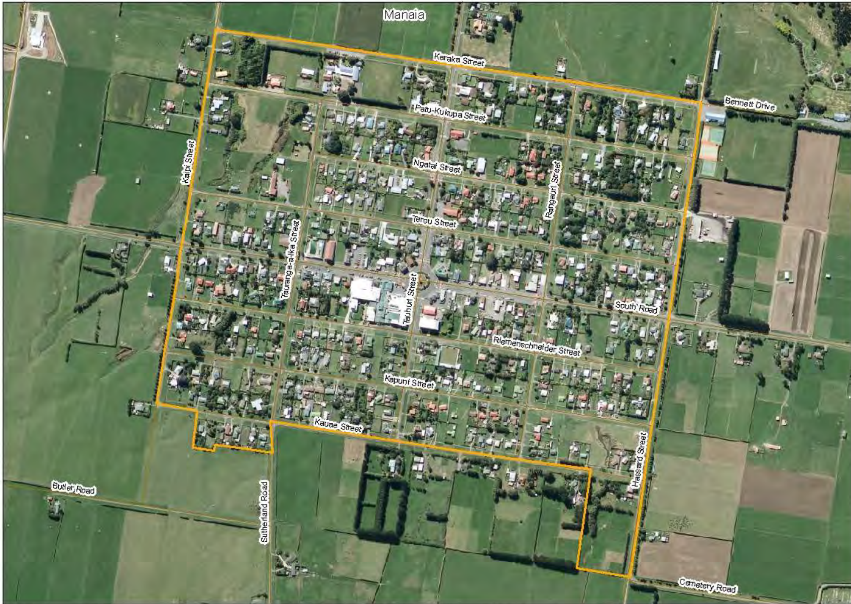
Figure 4: Manaia defined urban area