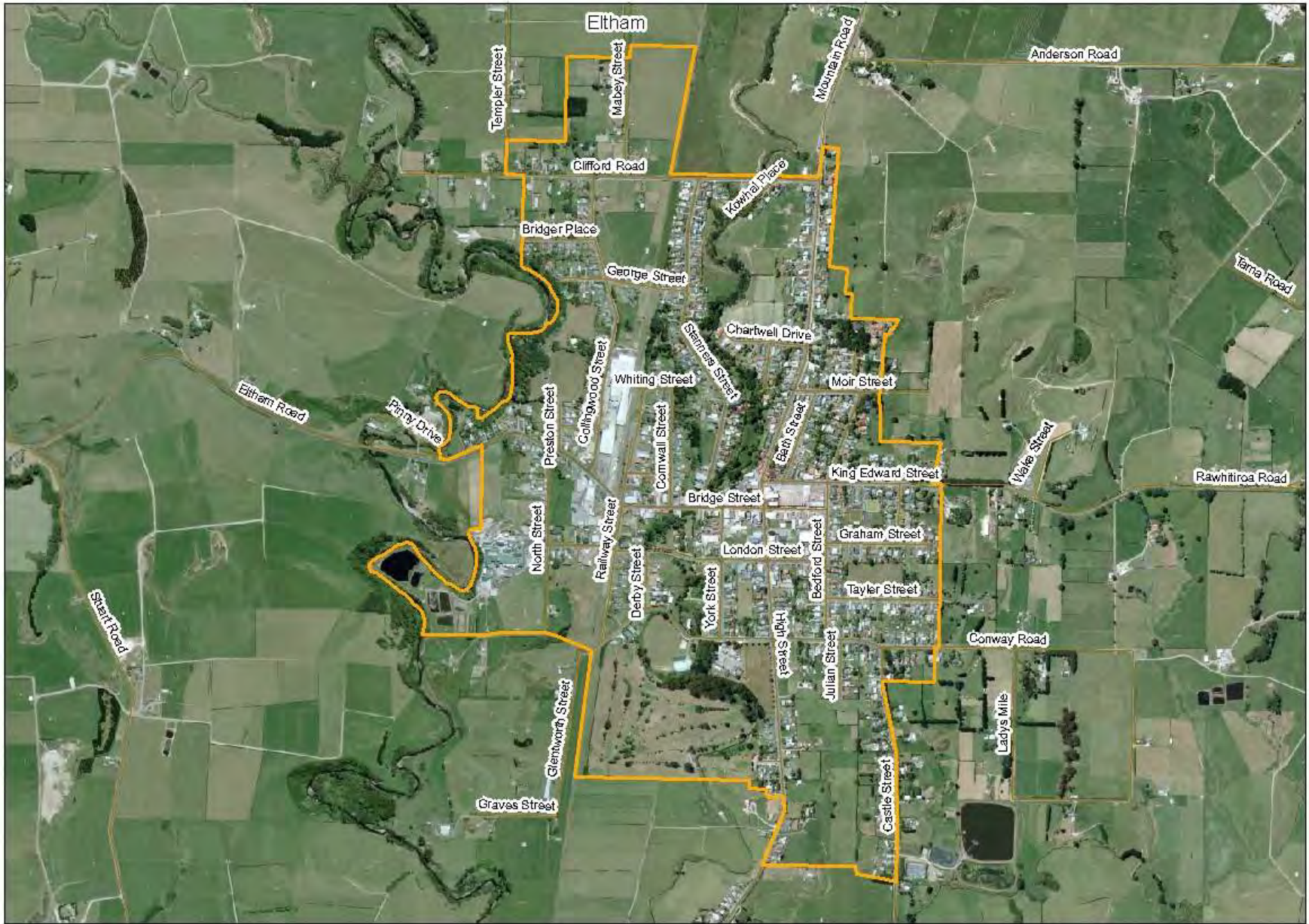
Figure 1: Eltham defined urban area