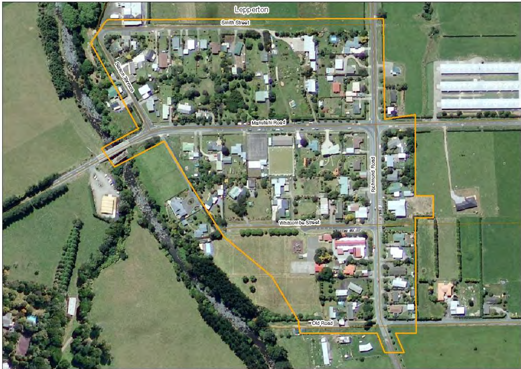
Figure 15: Lepperton defined urban area