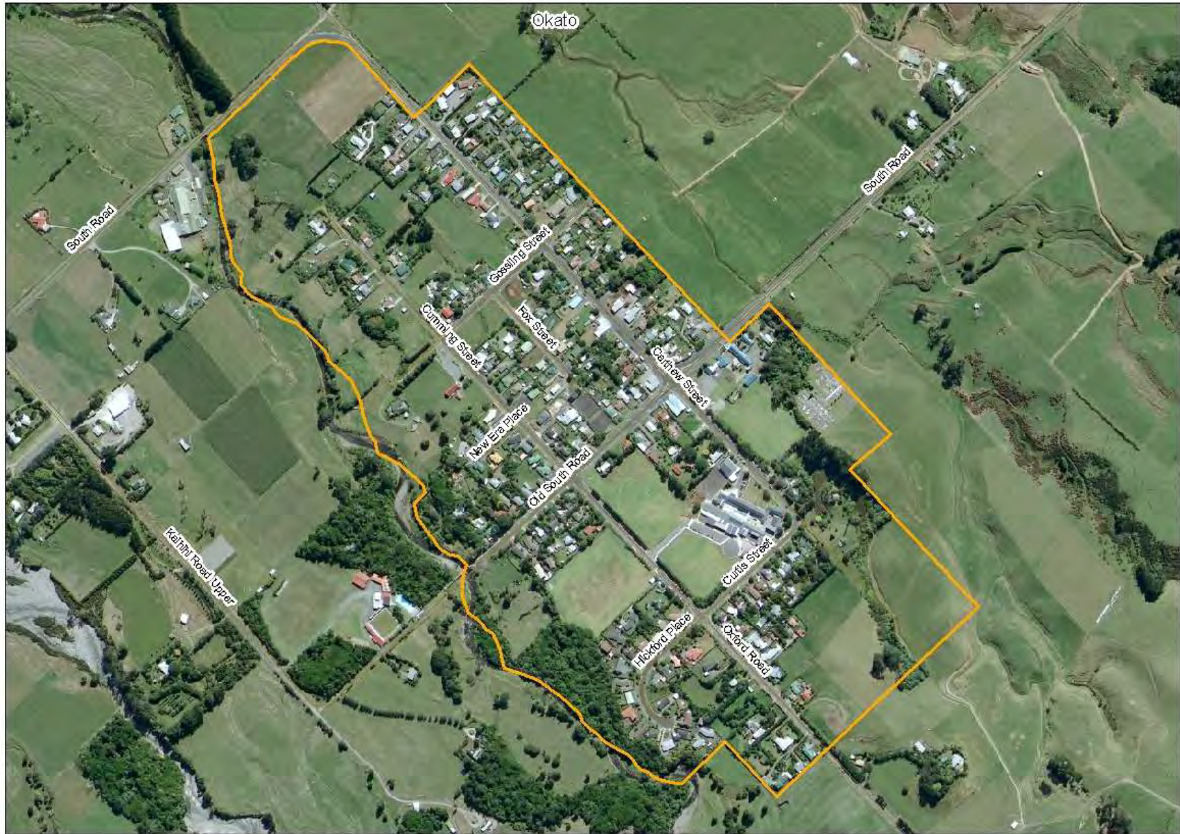
Figure 19: Okato defined urban area