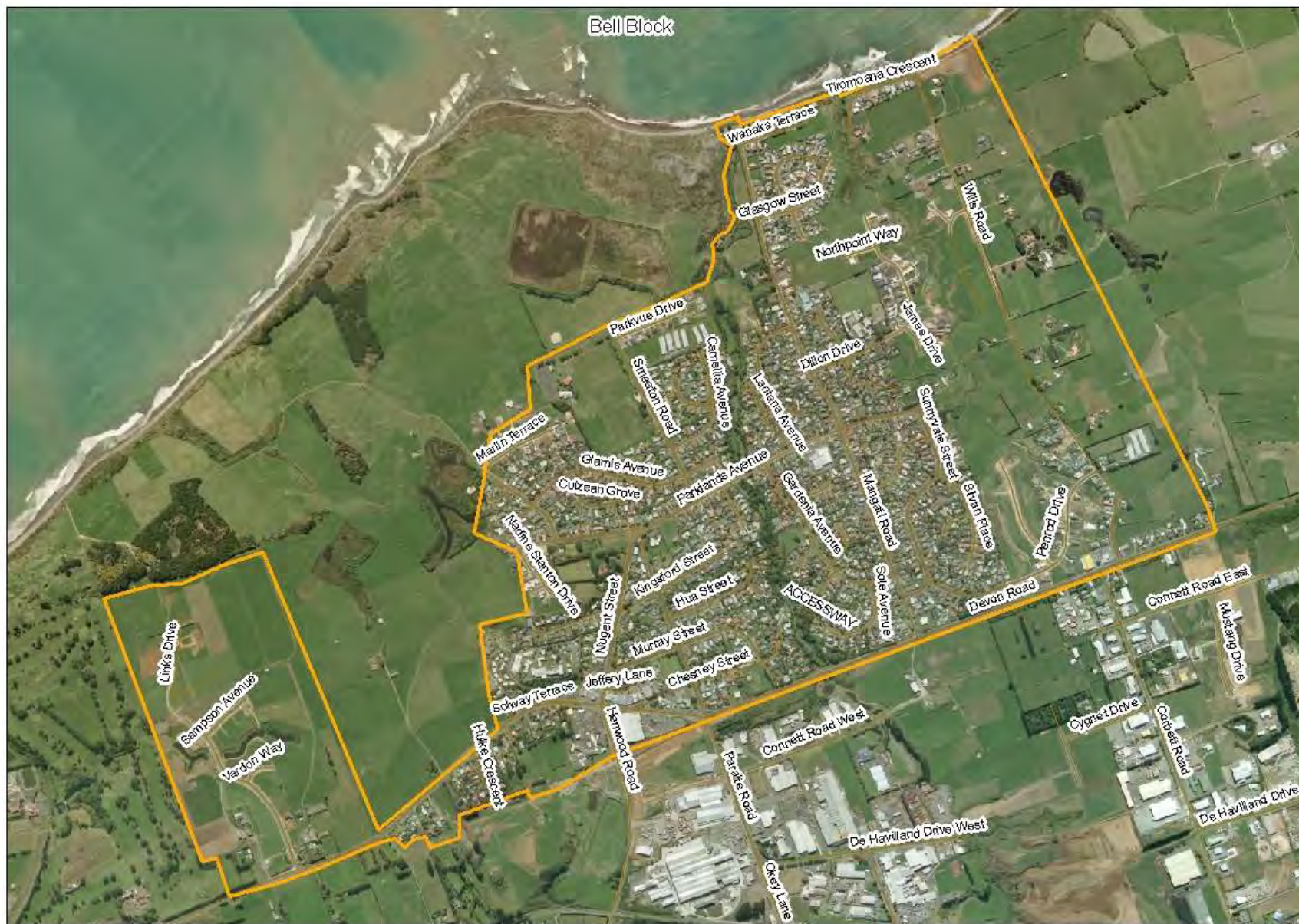
Figure 12: Bell Block defined urban area