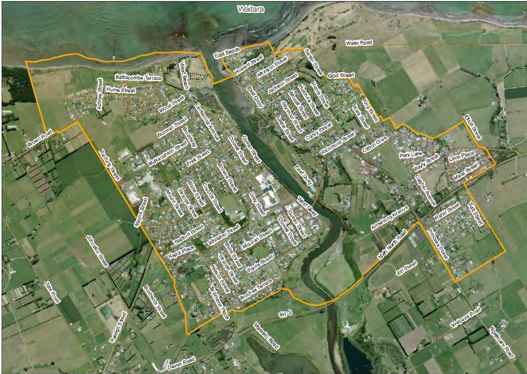
Figure 21: Waitara defined urban area