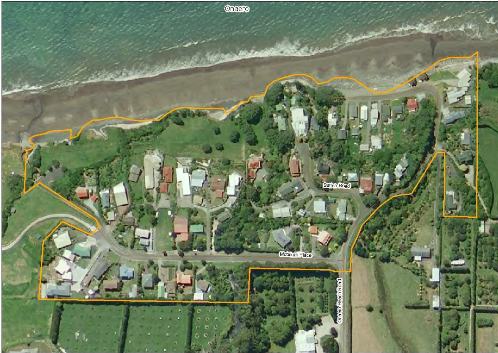
Figure 18: Onaero defined urban area