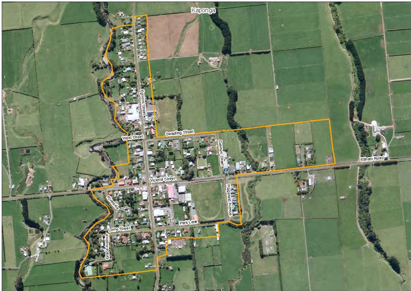
Figure 3: Kaponga defined urban area