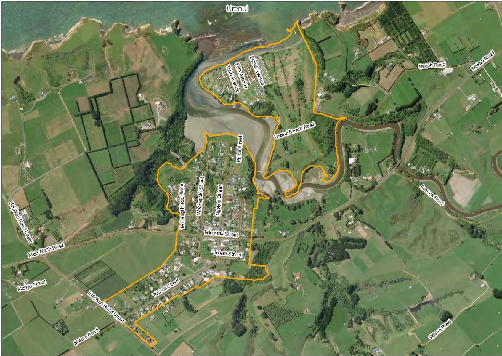
Figure 20: Urenui defined urban area