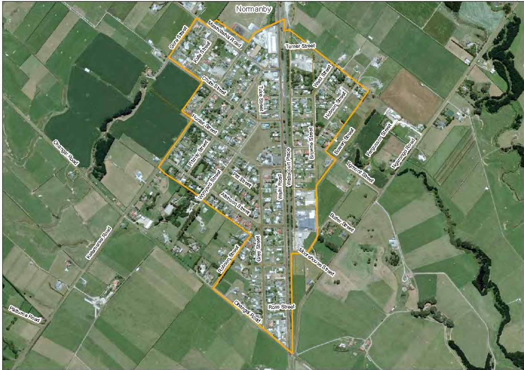
Figure 5: Normanby defined urban area