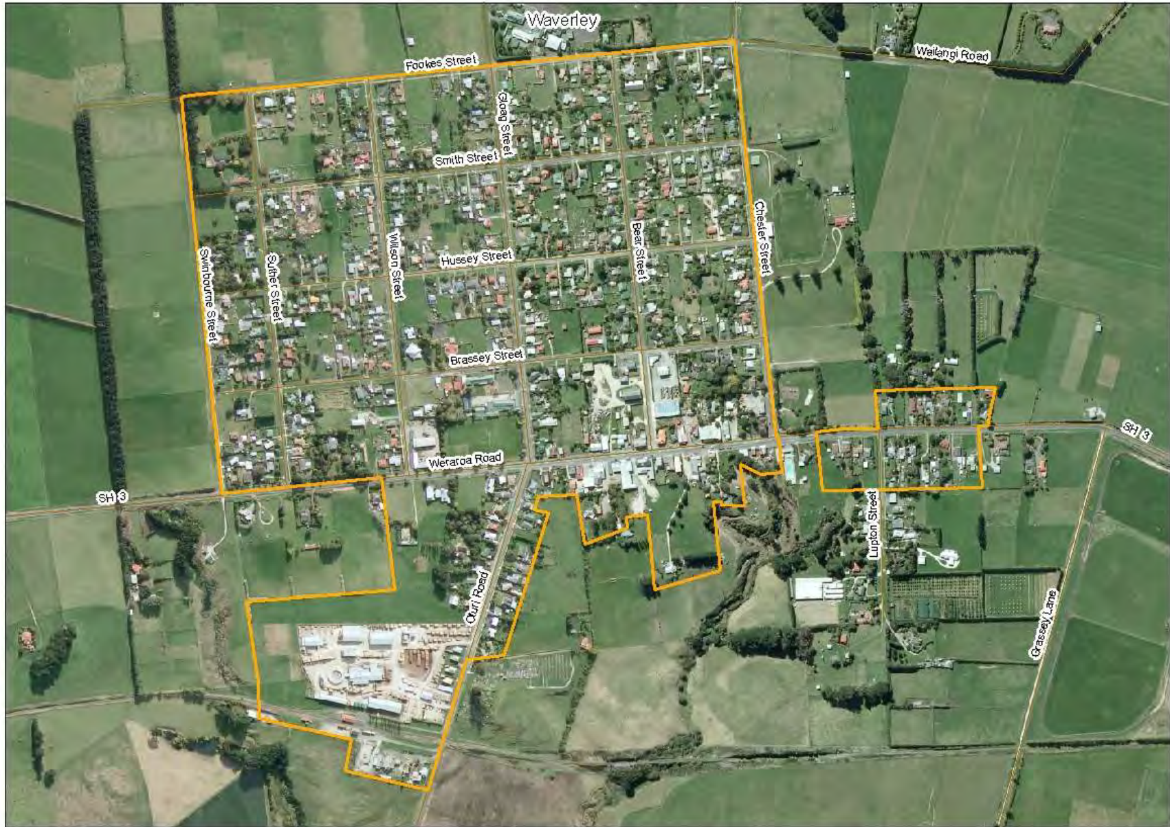
Figure 9: Waverley defined urban area