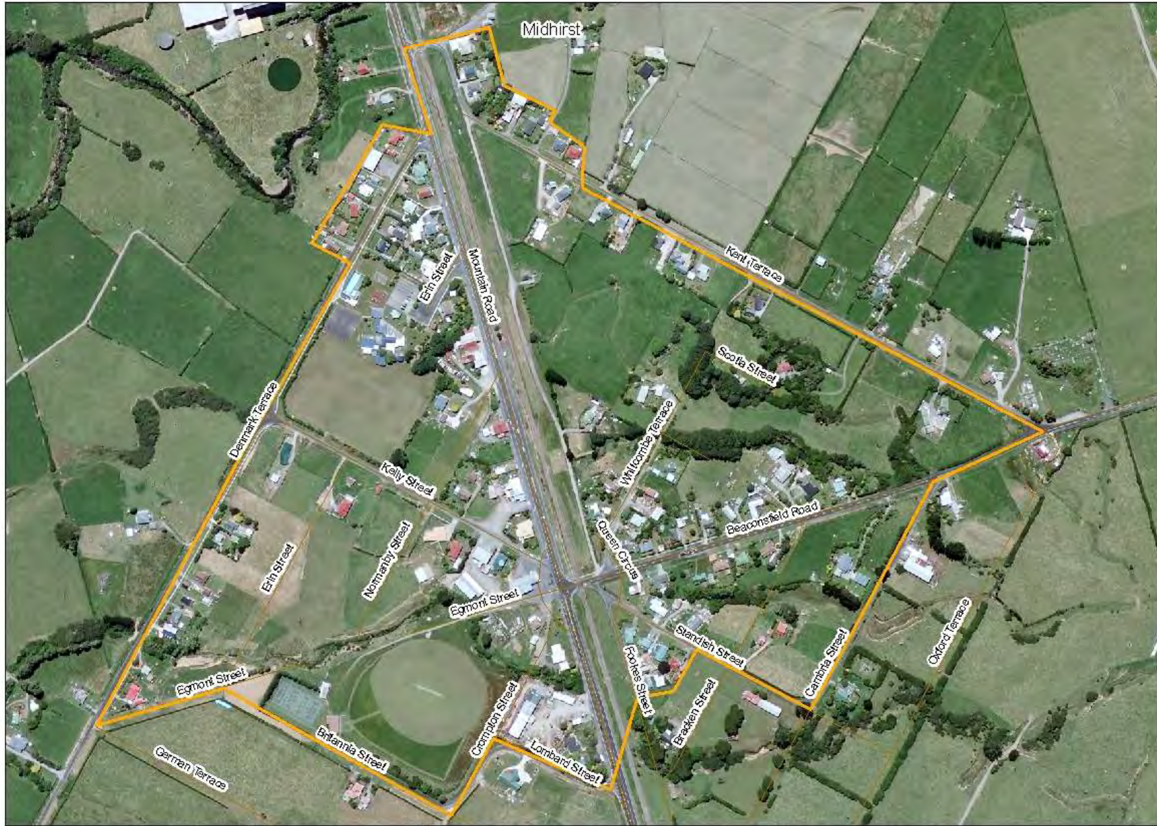
Figure 10: Midhirst defined urban area