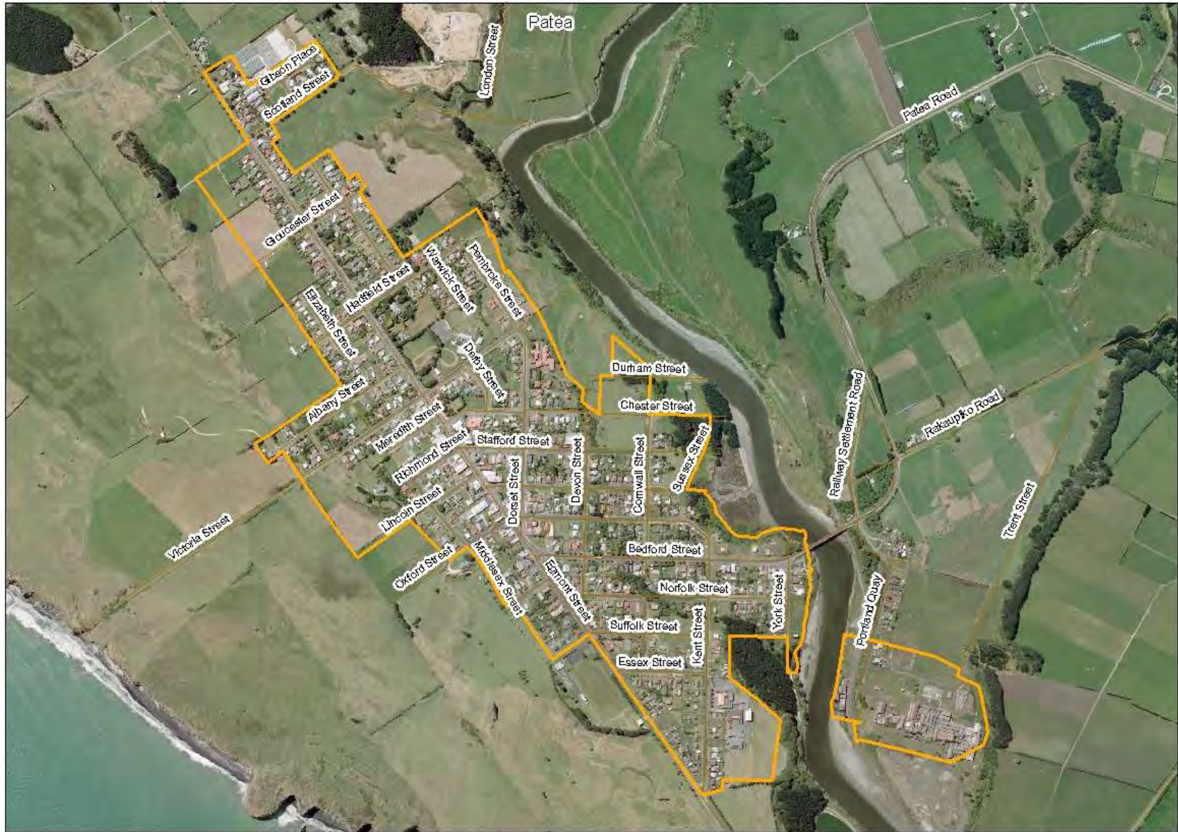
Figure 8: Patea defined urban area