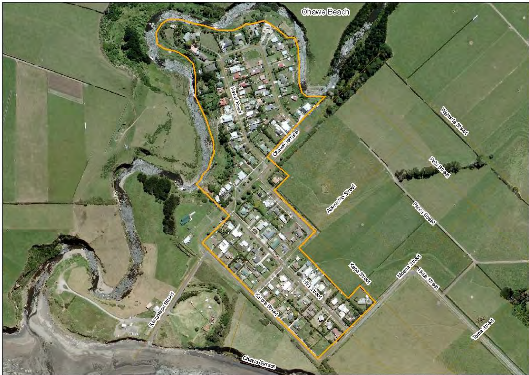
Figure 6: Ohawe Beach defined urban area