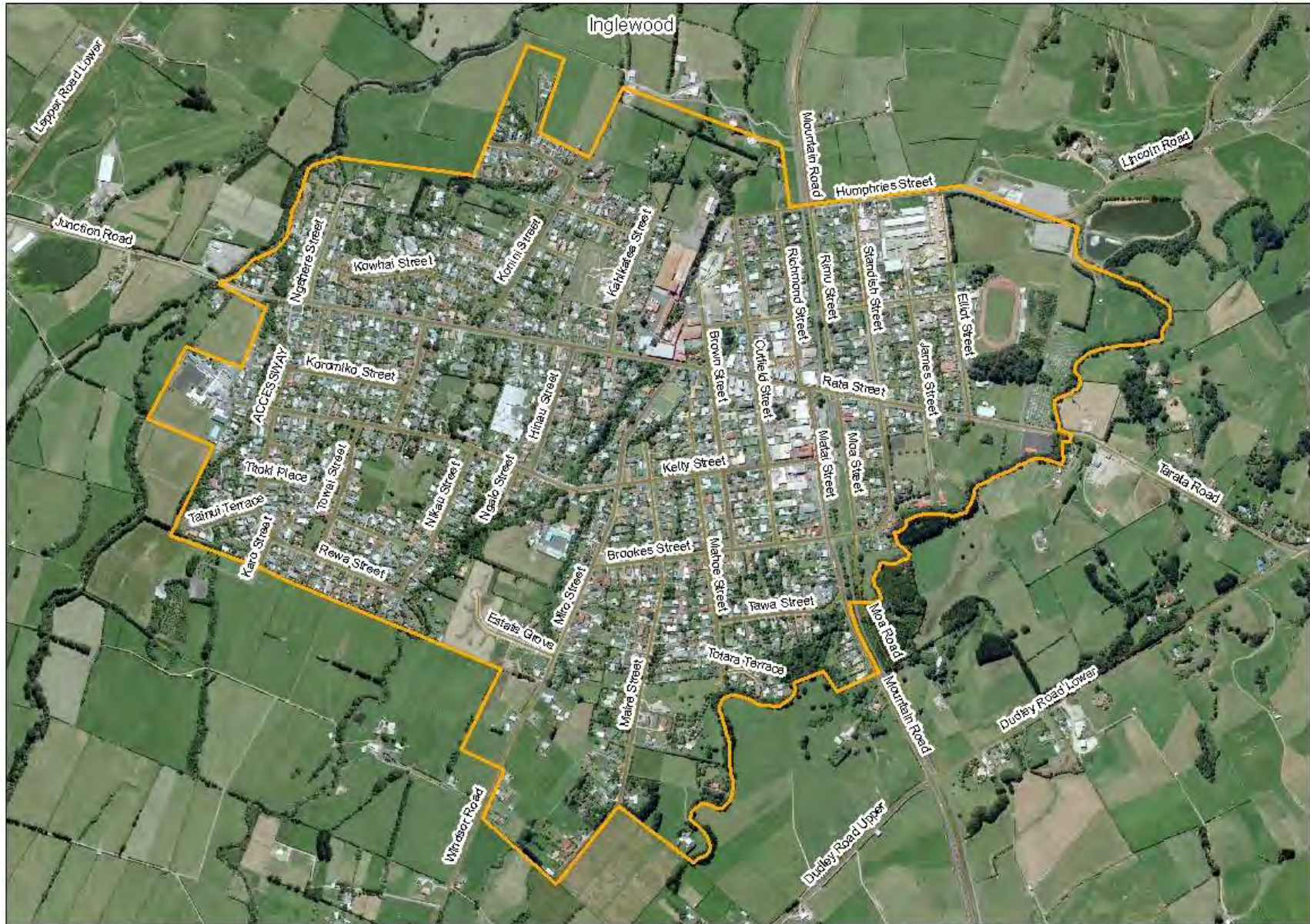
Figure 14: Inglewood defined urban area