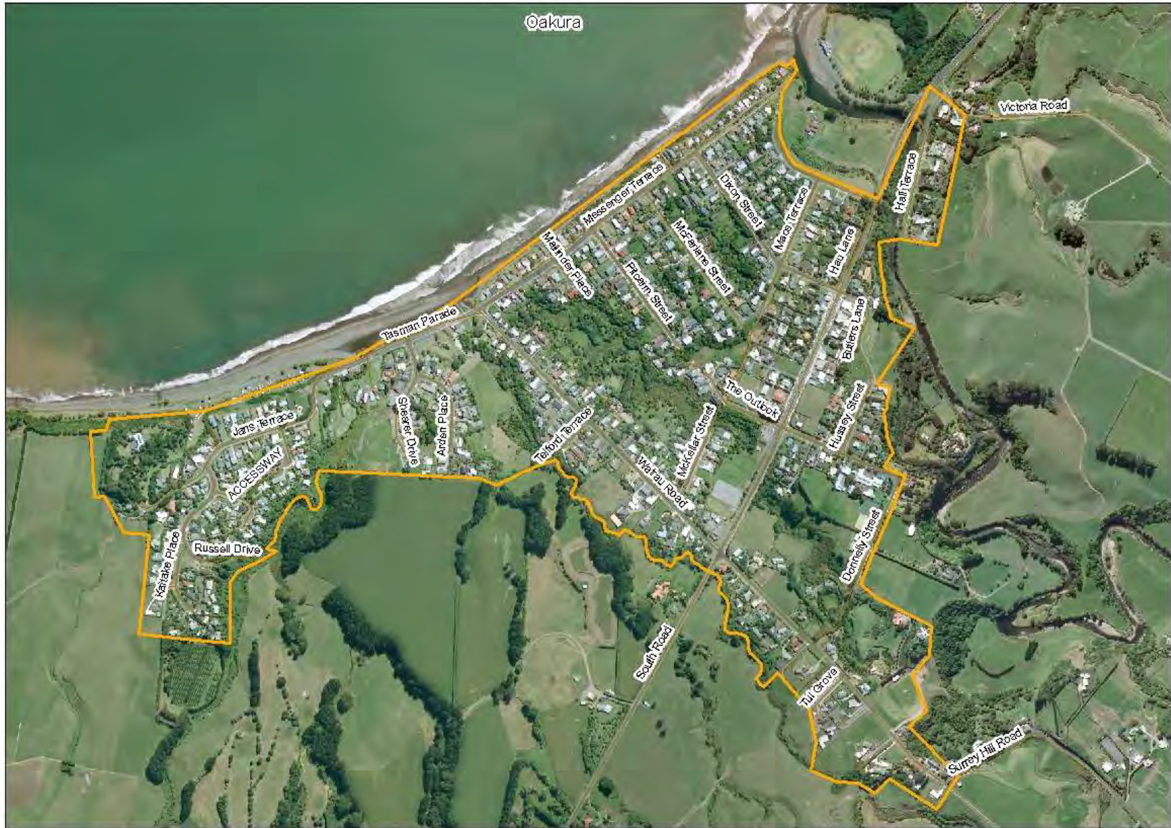
Figure 17: Oakura defined urban area