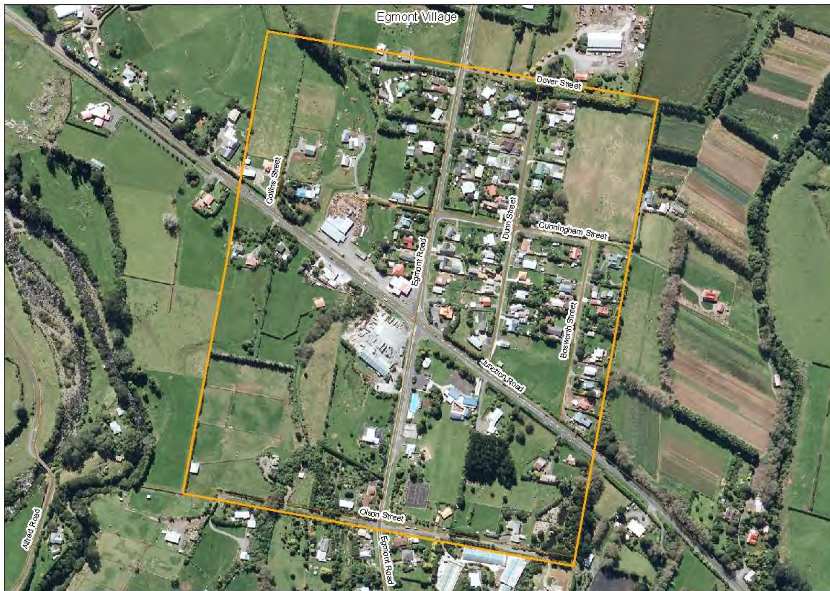
Figure 13: Egmont Village defined urban area