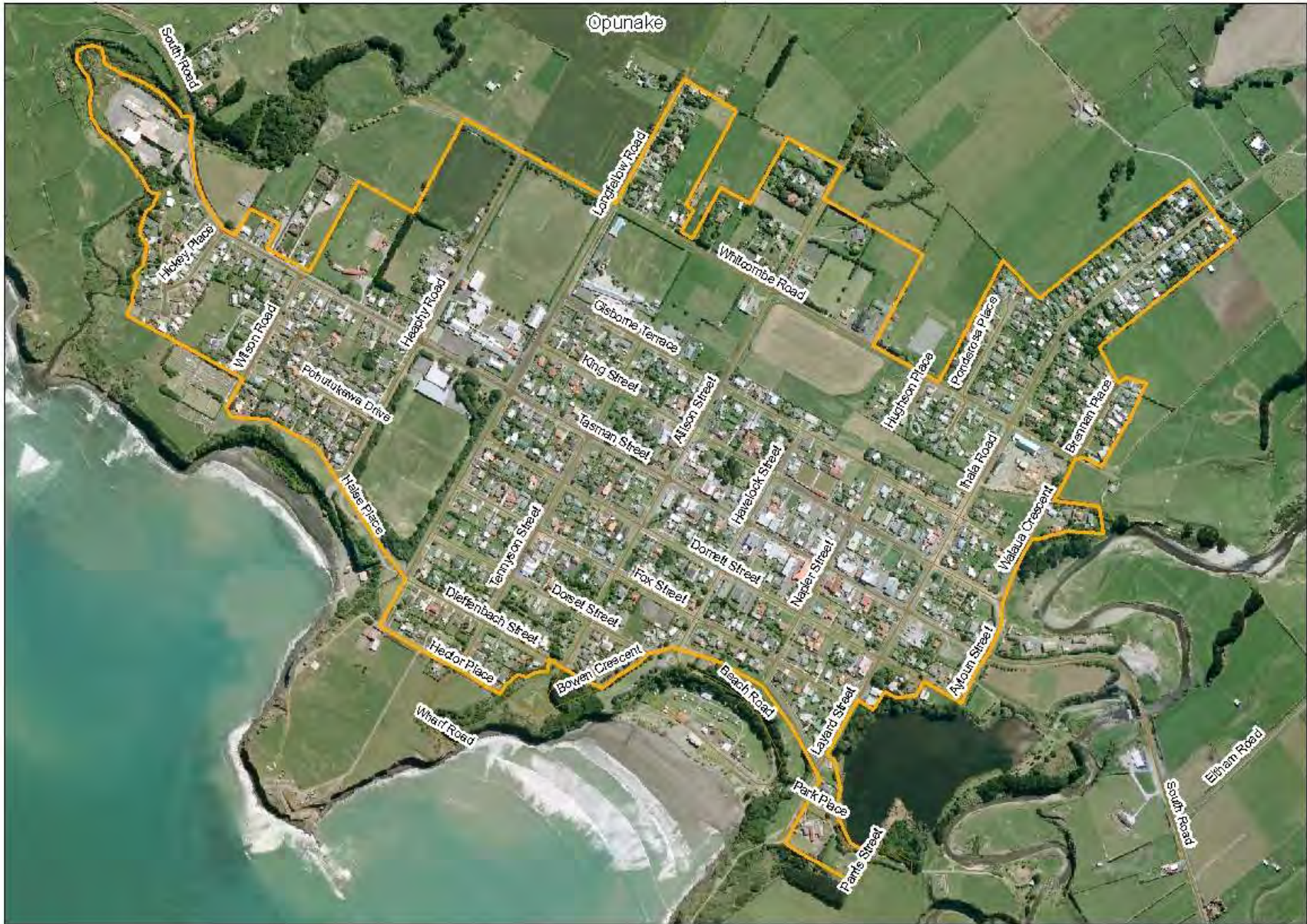
Figure 7: Opunake defined urban area