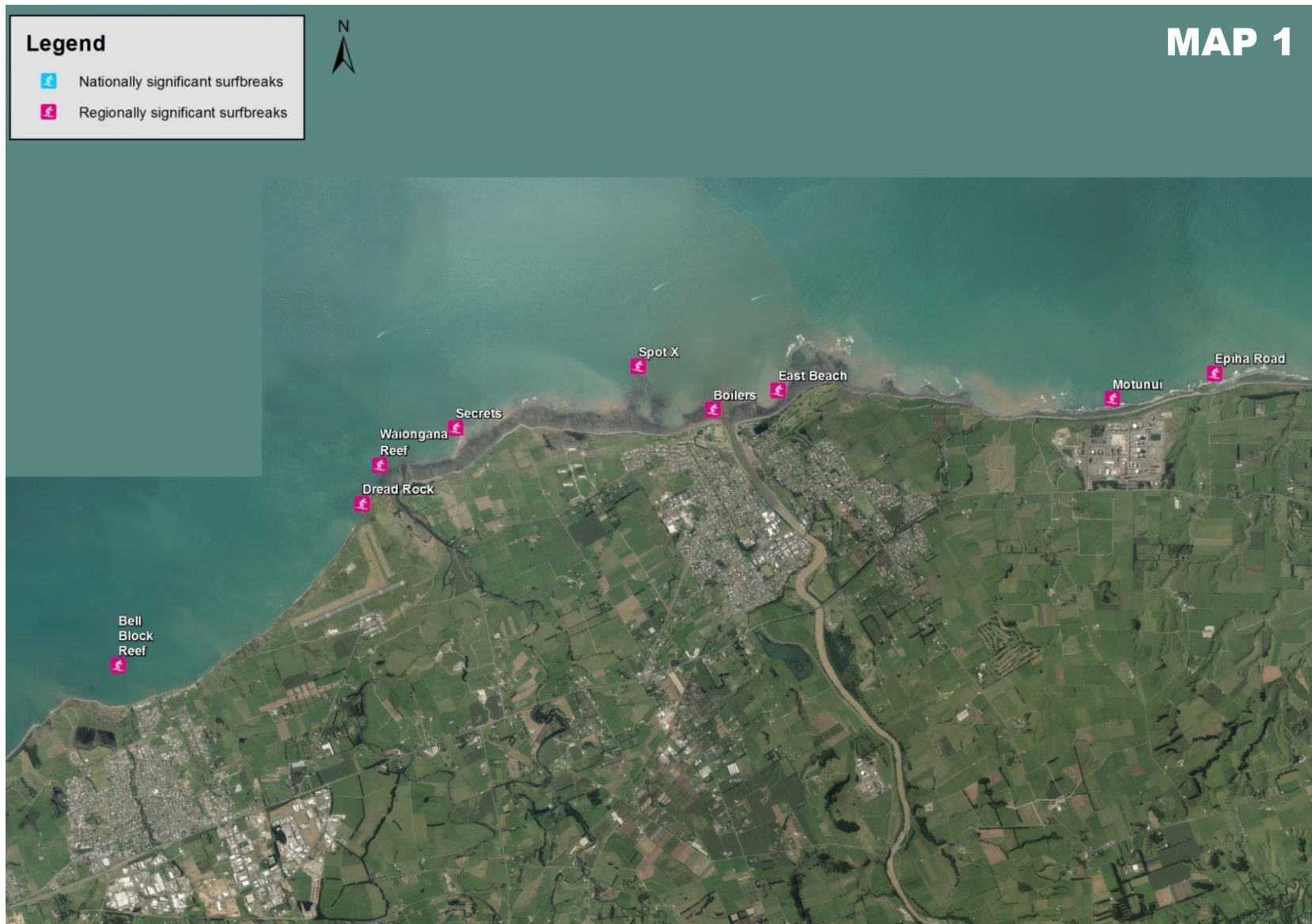
Figure 41: Surfbreaks from Epiha Road to Bell Block Reef.