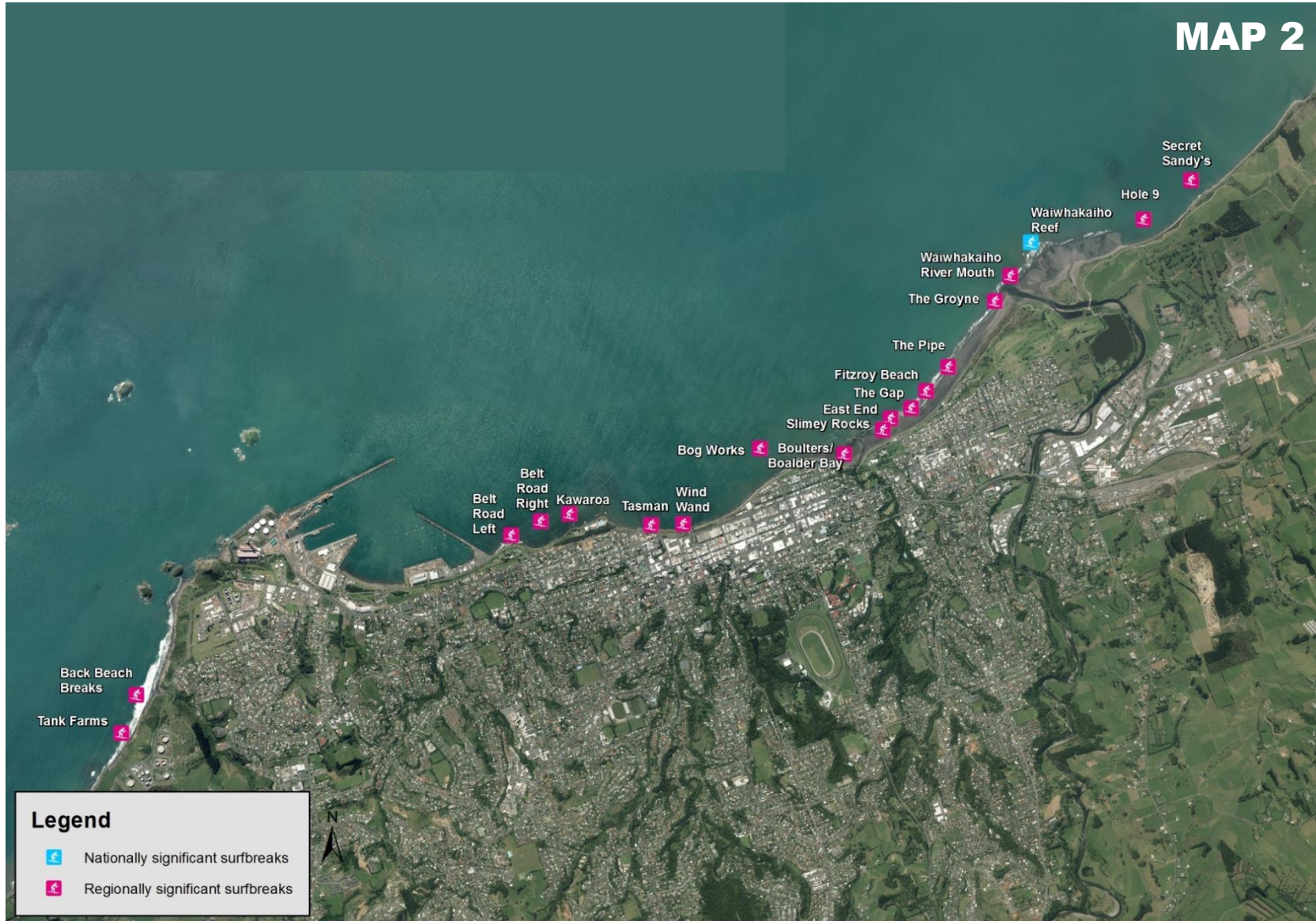
Figure 42: Surfbreaks from Secret Sandy's to Tank Farms.