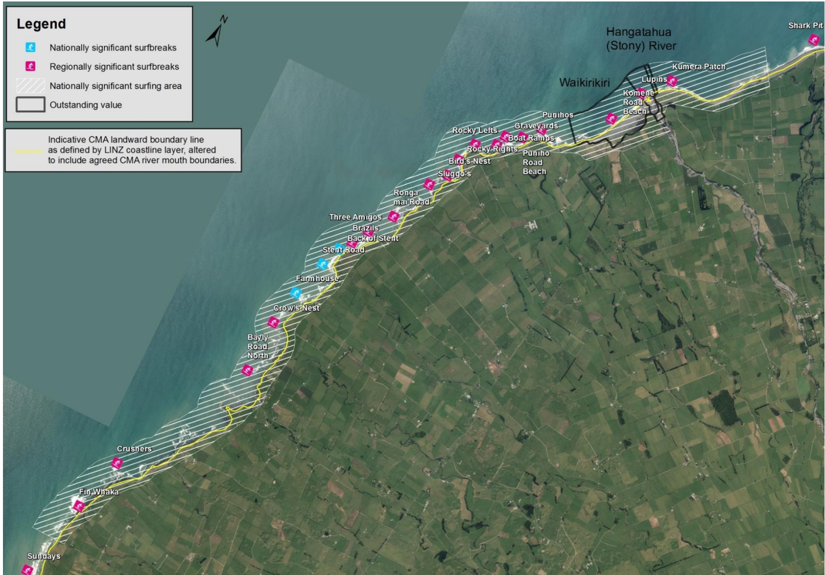
Figure 48: Nationally significant surf breaks.