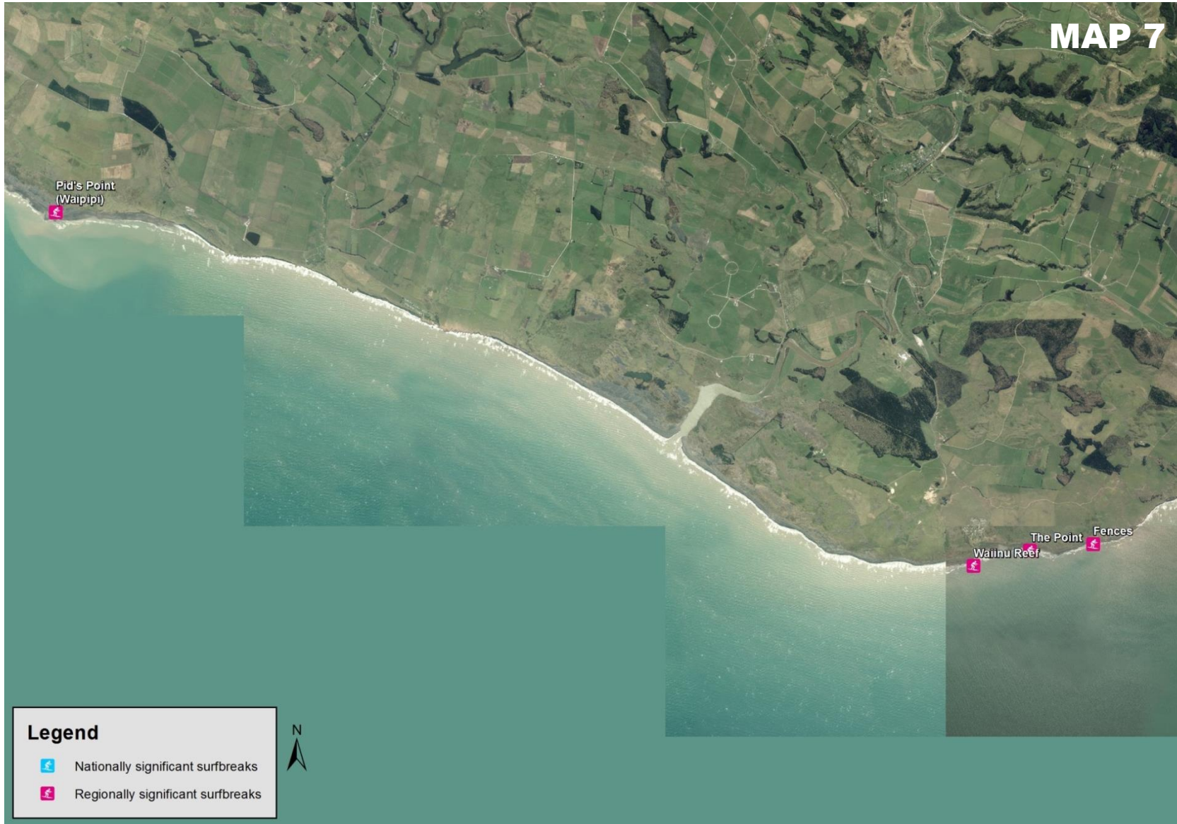
Figure 47: Surfbreaks from Pid's Point to Fences.