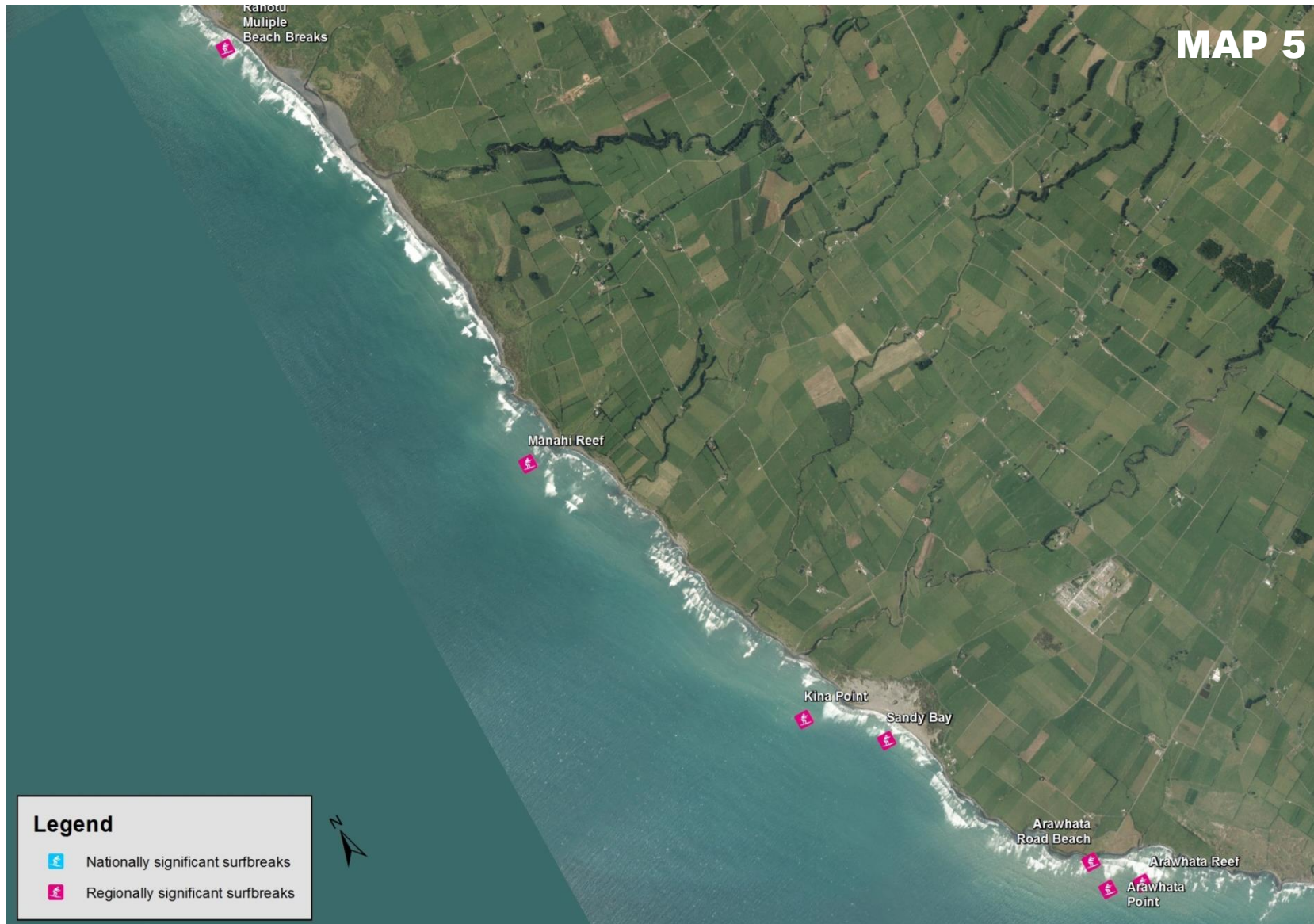
Figure 45: Surfbreaks from Rahotu Multiple Beach breaks to Arahata Point.