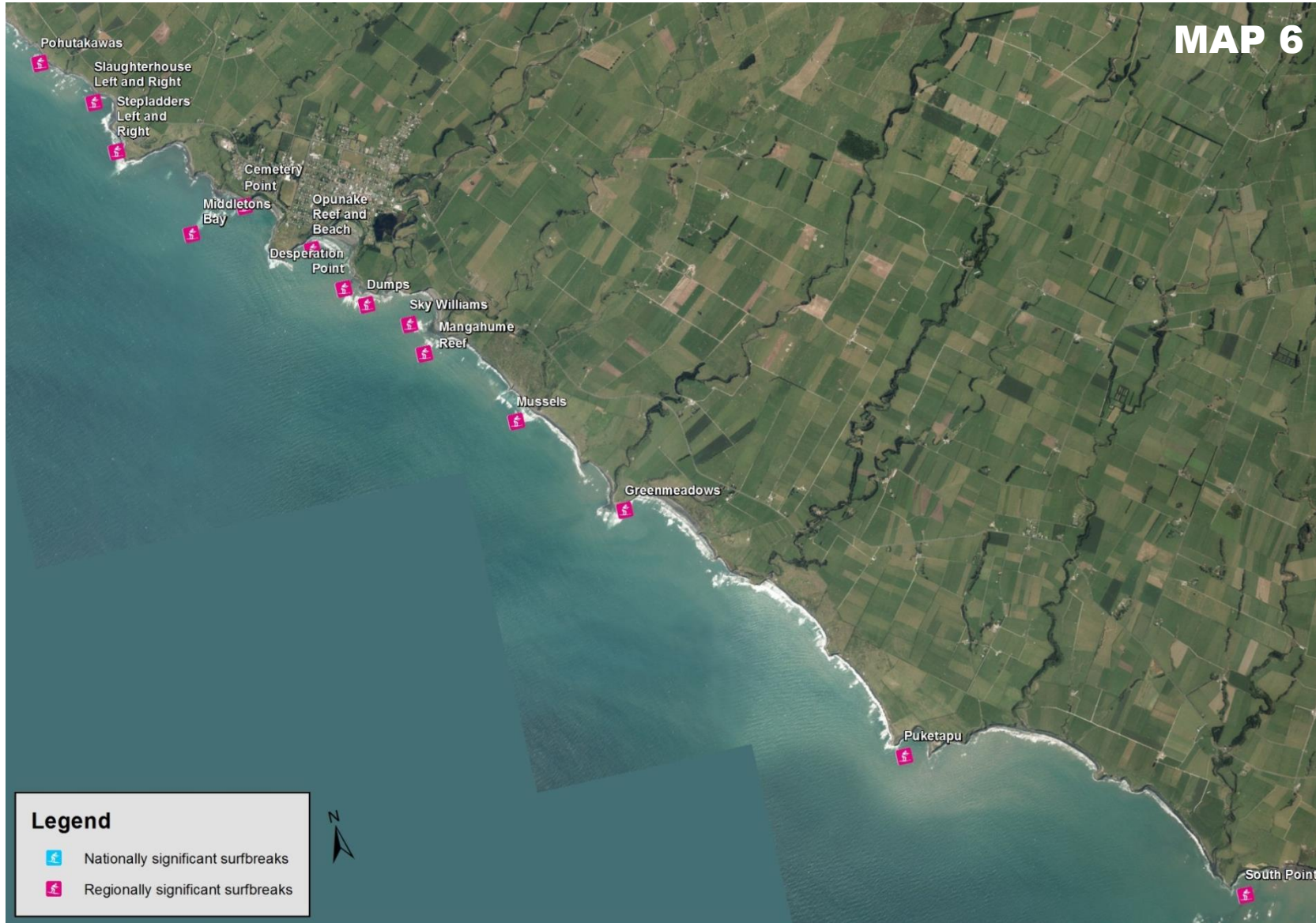
Figure 46: Surfbreaks from Pohutukawas to South Point.