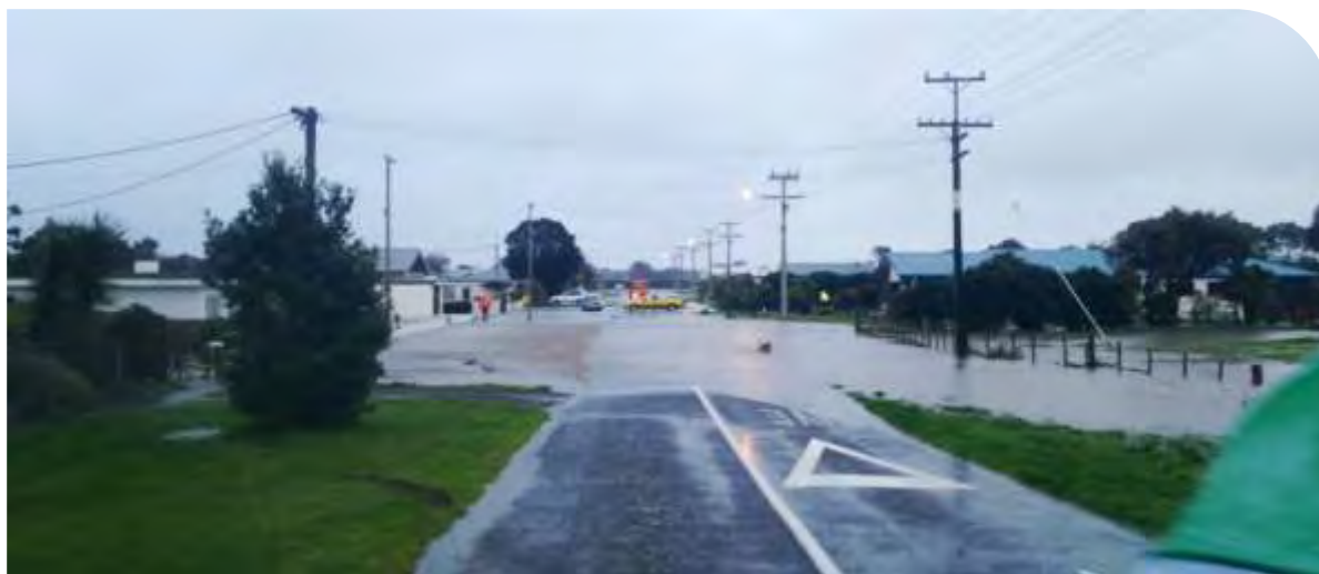
Above: Gisborne Terrace, Opunake, inundated by rain.

It's in two parts: A rural component to divert floodwaters away from the township, and an urban component to upgrade culverts and channels within the township. The urban part will be designed and implemented by the STDC, with the rural component being handled by the TRC. The scheme is designed to protect Opunake from a one-in-100-year (1% probability) flooding event.