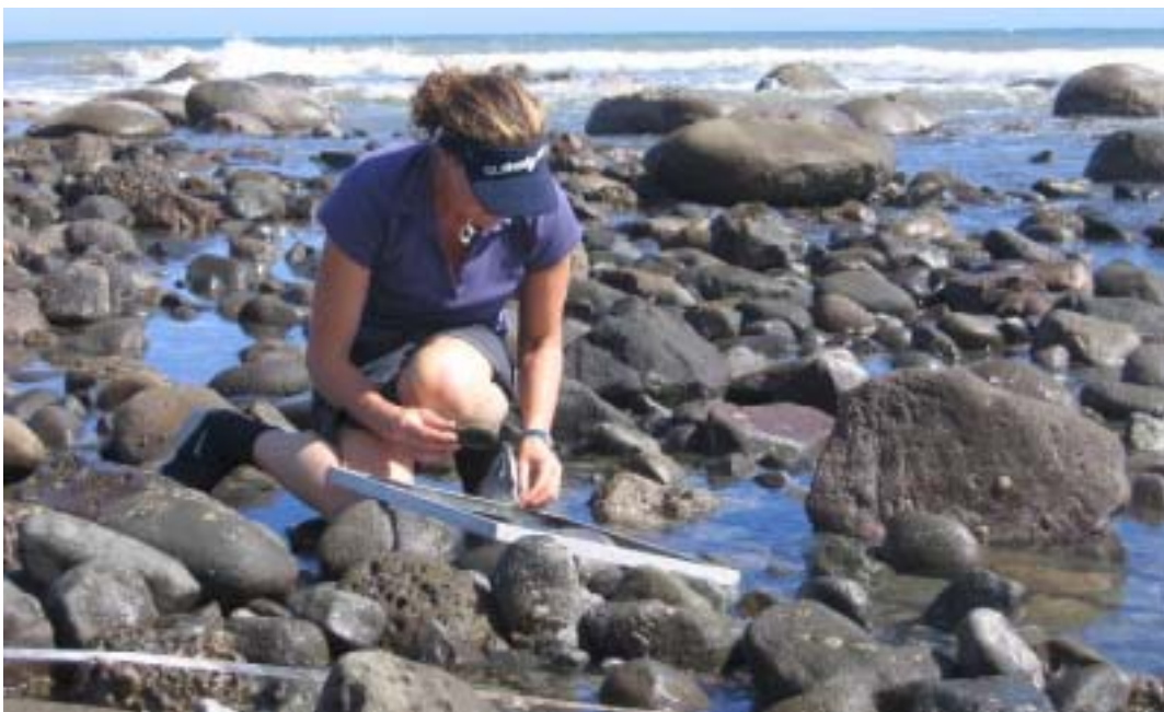
Photograph 8 – Water sampling