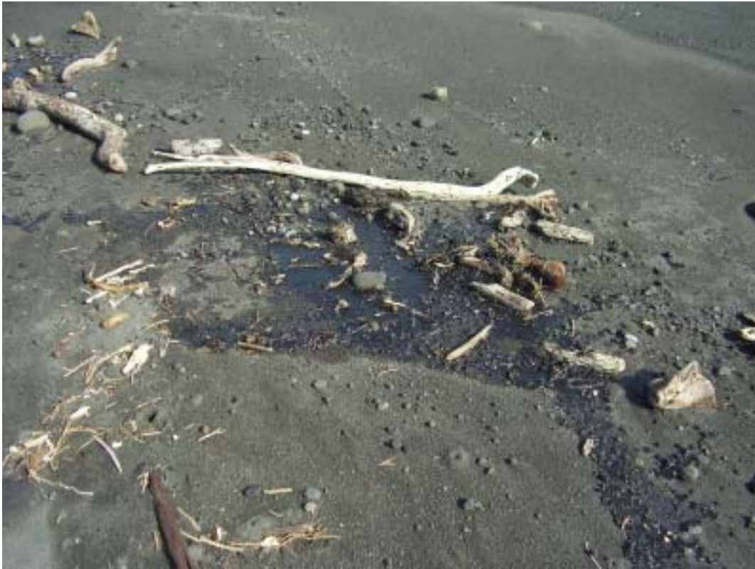
Photograph 3 – Oil on beach at Komene Road 25 October 2007

were taken. Aged tar balls were seen to be washed ashore and a significant amount of oil and tar balls were evident between the rocks.