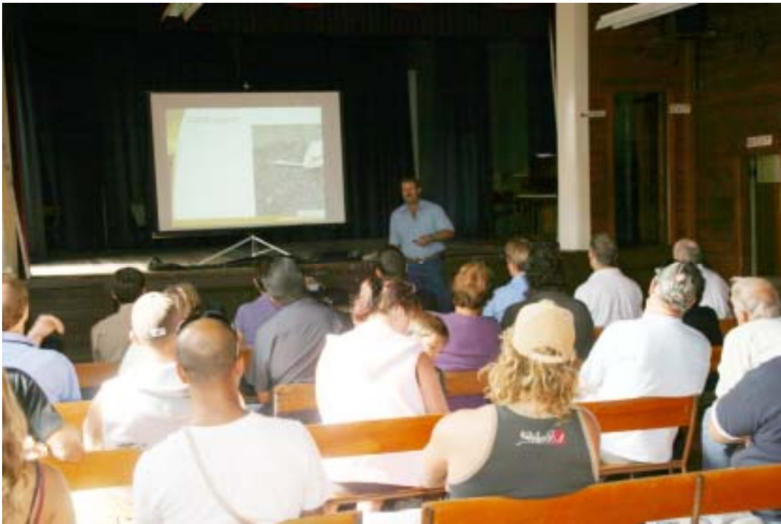
Photograph 7 – Public meeting held in Okato 2 March 2008