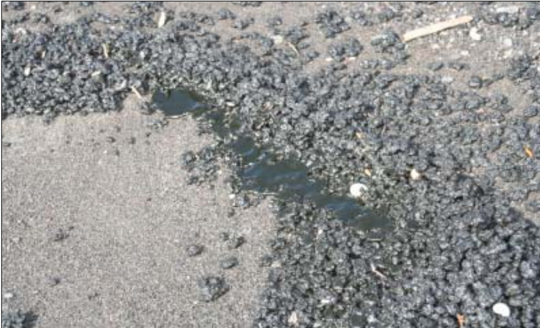
Photograph 1 – Oil on beach at Komene Road 24 October 2007