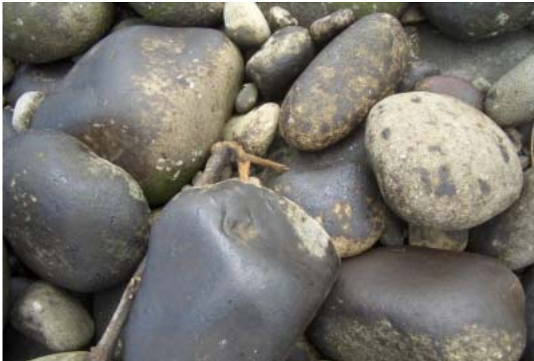
Photograph 5 – Oil on rocks Paora Road 7 November 2007