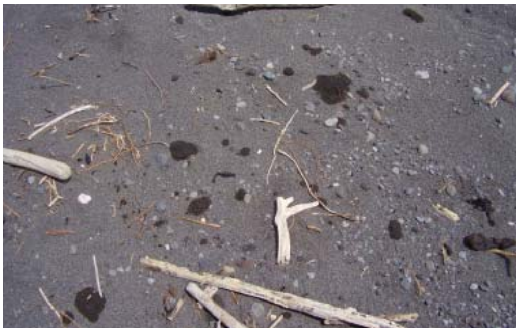
Photograph 6 – Oil still evident on Kaihihi Beach 28 December 2007