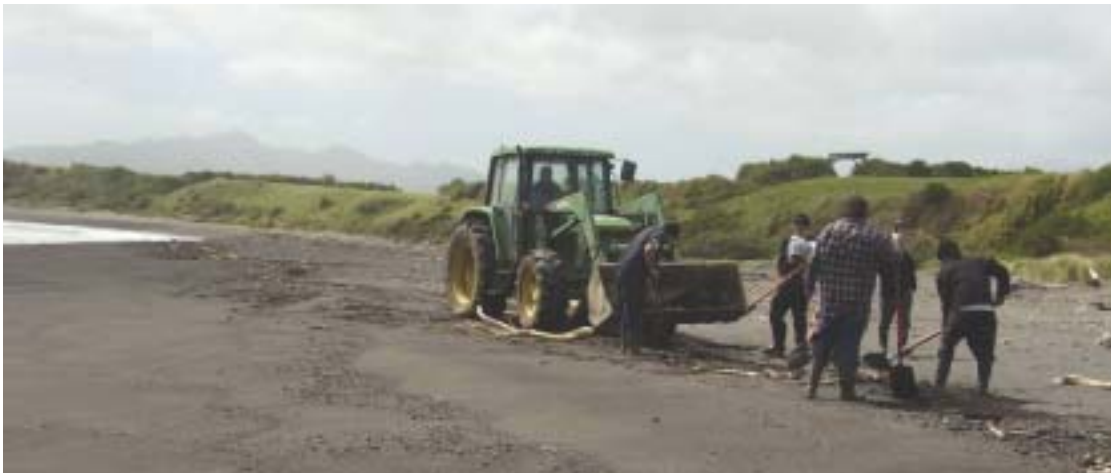
Photograph 4 – Clean up team on the beach