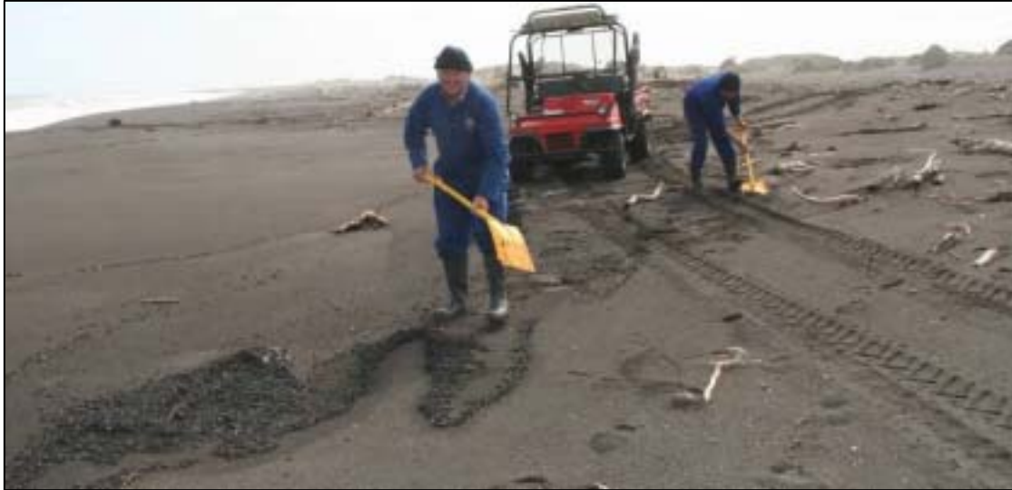
Photograph 2 – Clean up on beach at Komene Road 24 October 2007