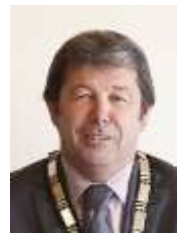
Neil Volzke Stratford Mayor