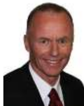
Ross Dunlop South Taranaki Mayor