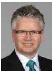
Andrew Judd New Plymouth Mayor

There are structures and systems in place whereby Taranaki's councils work efficiently together and share services. Approximately fifty (50) examples presently exist and these are presented below. Further collaborations are constantly explored and will be progressed if business cases exist.