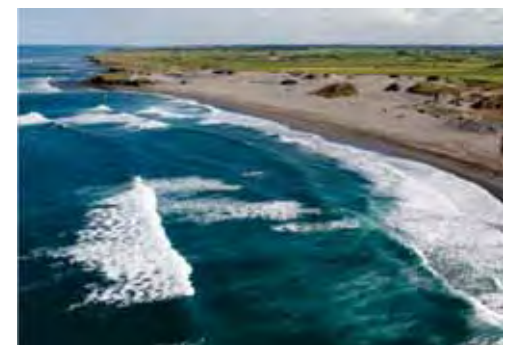
Sandy Bay located north of Opunake.

There are many rocky reefs along our coastline with a rich diversity of marine life. We are fortunate in that we have a number of suitable rocky shore areas suitable for school groups to study.