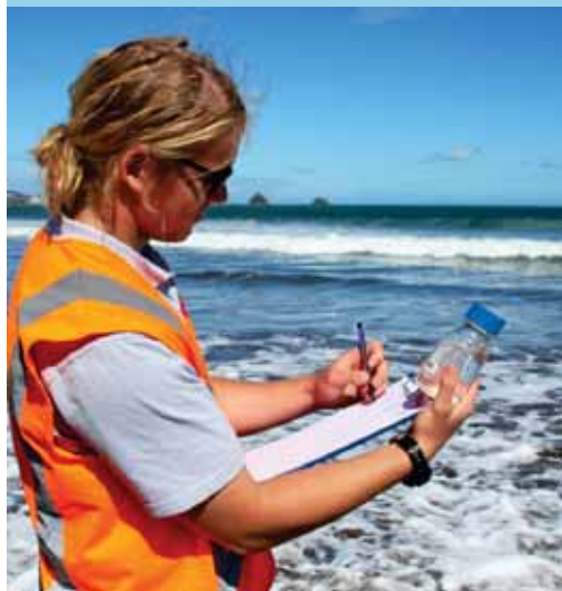
Council Officers carry out regular monitoring.

It takes place mainly during strong winds, high waves, high tides and storm surge conditions which can all lead to coastal retreat and loss of land.