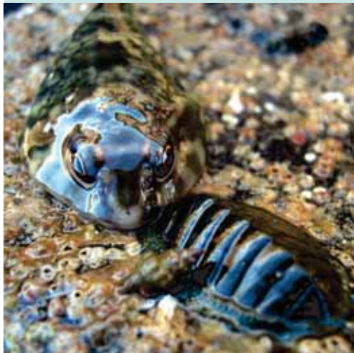
Pictured: Clingfish, Whelk and Chiton.

Can you show their discoveries on either a pie graph or a bar graph.