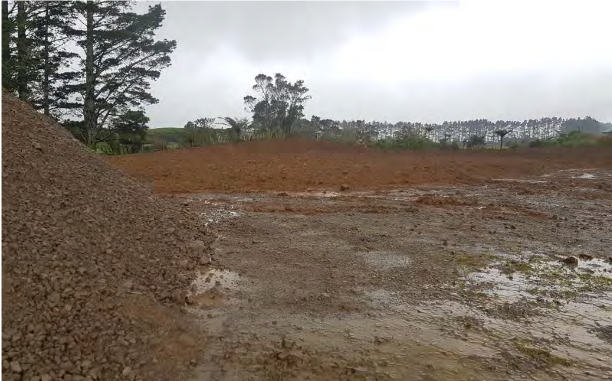
Photo 5 Reinstated Gibson Family Trust Newall Road site

Two compliance monitoring inspections and one final inspection were undertaken at the Newall Road quarry during the 2017-2018 period. There was no quarry work being undertaken at the time of inspections and the quarry was compliant with resource consent conditions. Process areas were appropriately bunded and contoured to direct all runoff to the stormwater settlement ponds. No dust or odour effects were observed, and no impacts on surface water bodies were observed. The final inspection on 20 August 2018 found the active quarry site to be reinstated and all sediment ponds had been backfilled. Piles of metal and the high wall had been left upon land owners request (Photo 5). The consent has been surrendered.