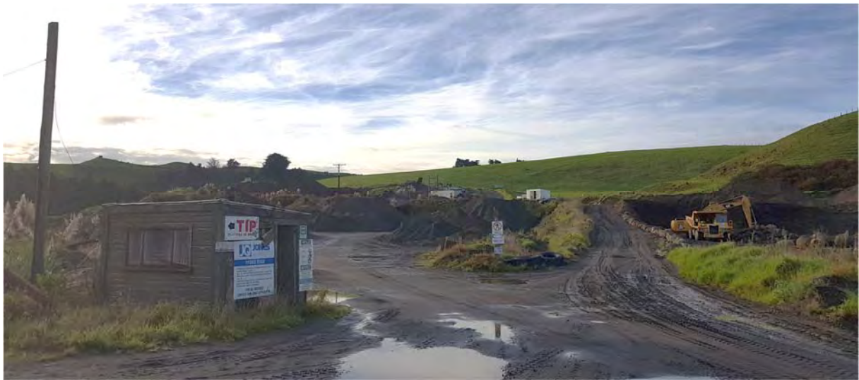
Photo 8 Hydro Road quarry and cleanfill from site entrance

Three inspections were undertaken at the Company's Hydro Road quarry during the 2017-2018 period (Photo 8). Inspections of the stormwater system after rainfall showed all water directed to the pond system and discharge was running clear. It was noted that it was good to see low points along the access track were well banded, preventing runoff to the river. One inspection of the washwater system showed runoff was contained and directed to the pond system; wash plant was not operating during other inspections. During one inspection of the cleanfill, it was noted there were large amounts of tanalised wood and some tin present (Photo 9). The Company was advised that these items need to be removed and that if found in future the Company could face enforcement action. Cleanfill discharge during all inspections was clear.