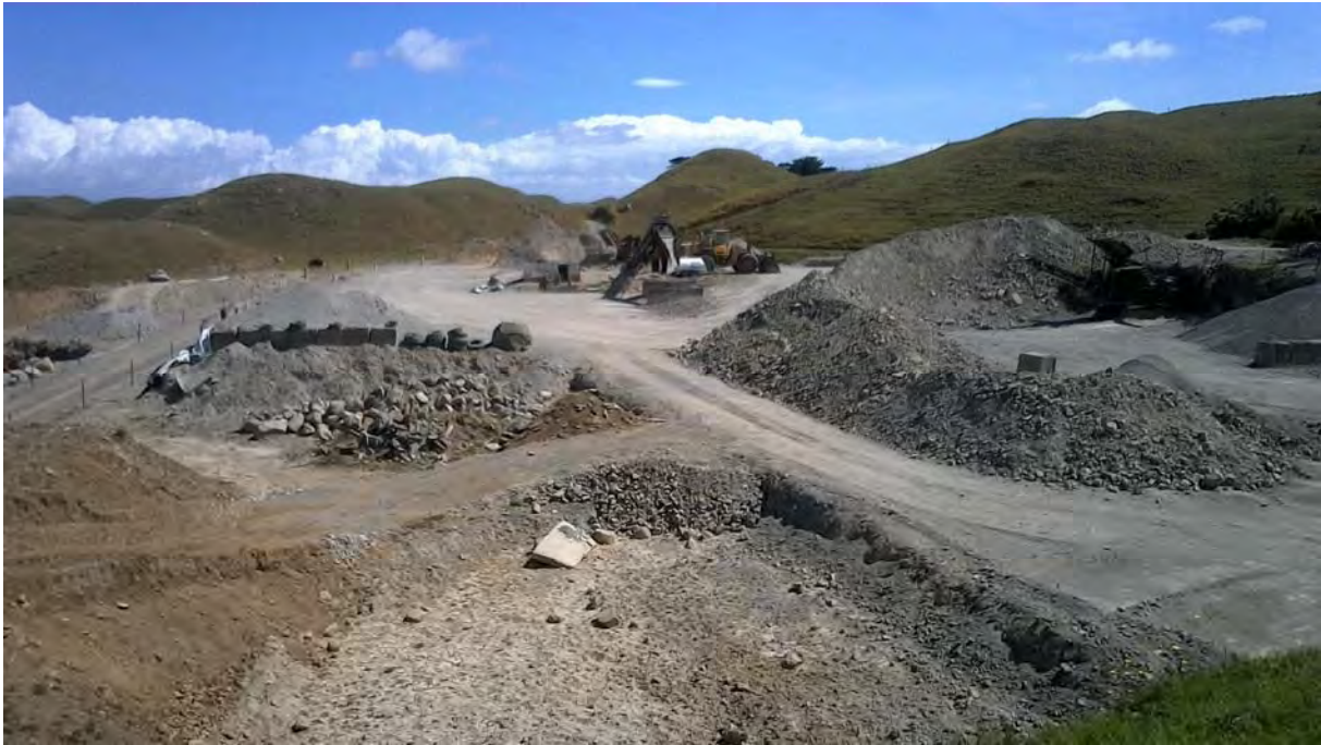
Photo 7 Goodin AG Limited quarry site

Two inspections were undertaken at the Company's quarry during the 2017-2018 period. There was no activity occurring onsite during the inspections. One inspection was undertaken after rainfall and the site was discharging stormwater into an adjacent paddock; it was noted to be clear and compliant. The site was well maintained, generally tidy and visually compliant with resource consent conditions (Photo 7).