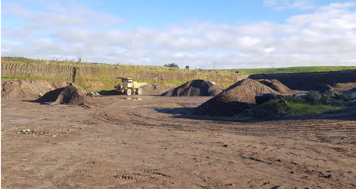
Photo 1 AA Contracting Ltd Quarry pit July 2018

Two inspections were undertaken at the Te Arei Road quarry (Photo 1) during the 2017-2018 period. The site was found to be generally well maintained and tidy during inspections, and all consent conditions were being complied with. No objectionable dust or odour effects were observed, bunding was well maintained and site contouring was adequately directing all contaminated runoff to the stormwater settlement ponds. It was noted on one inspection that works could be undertaken to clean some sediment out of the settlement ponds, otherwise no issues were noted.