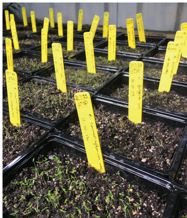
Seedlings germinating at Pukeiti