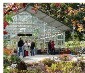
Rhododendron Species Botanical Garden in Federal Way, Washington State