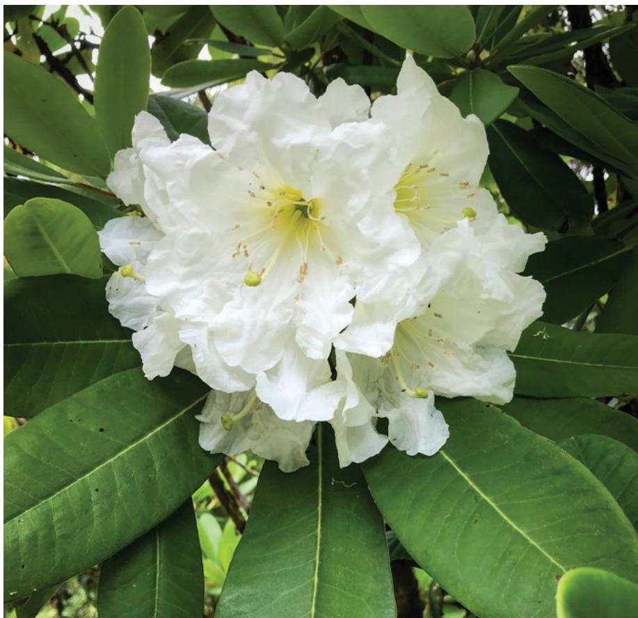
December flowering R. decorum grown from seed collected on Pukeiti's first trip to Yunnan, China in 1990 led by Ron Gordon.