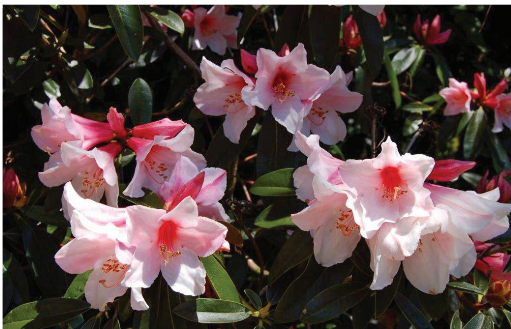
R. 'Maddy Bern' raised at Pukeiti.