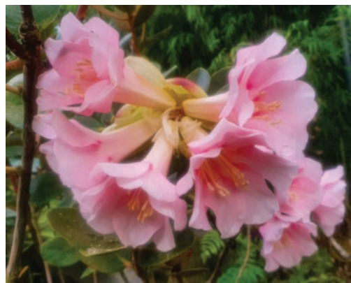
R. 'Koha' a vireya raised at Pukeiti.

The notion of registration in conservation is an interesting one, as in reality it preserves the chosen name only. What guarantee does it give for the plant's survival if only one or two people are growing it? I know I am guilty of registering a couple of hybrids while having no real interest in their broad distribution, but a seemingly