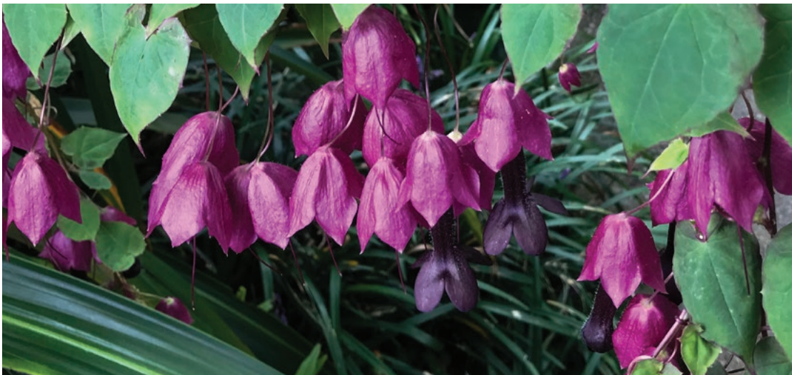
Rhodochiton atrosanguinea The purple bell vine growing in the vireya houses at Pukeiti