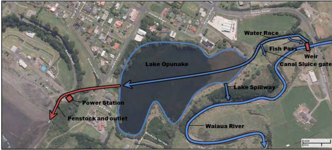
Photo 1 Opunake Power Limited scheme on the Waiaua River