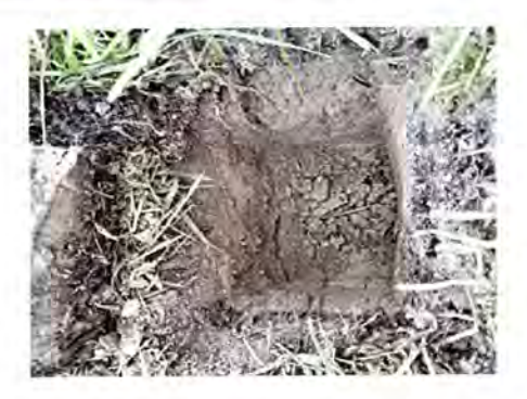
Figure 1. Photos showing test pit.

The assessment of the soils in the test pits indicated the top 300 mm of the soil profile consisted of 300 mm of a silty clay loam. The presence of mottles and gleying in the profile indicates that drainage is impeded.