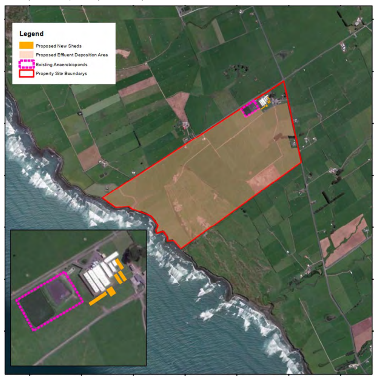
Figure 3 Existing and proposed piggery buildings and effluent storage ponds

The addition of these sheds will allow for re-organisation of the farm's younger pigs generally to the north and older pigs to the south (further from the closest dwelling). The shed expansion and proposed area for effluent discharge are displayed in Figure 3 and Figure 4.