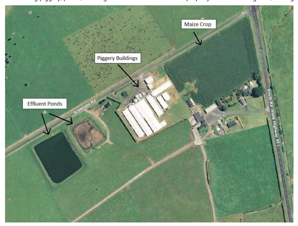
Figure 1 Location of Stanley Bros Trust Piggeries current buildings and effluent ponds

The existing piggery, ponds, and irrigation areas in relation to the property are shown in Figure 1, and Figure 2