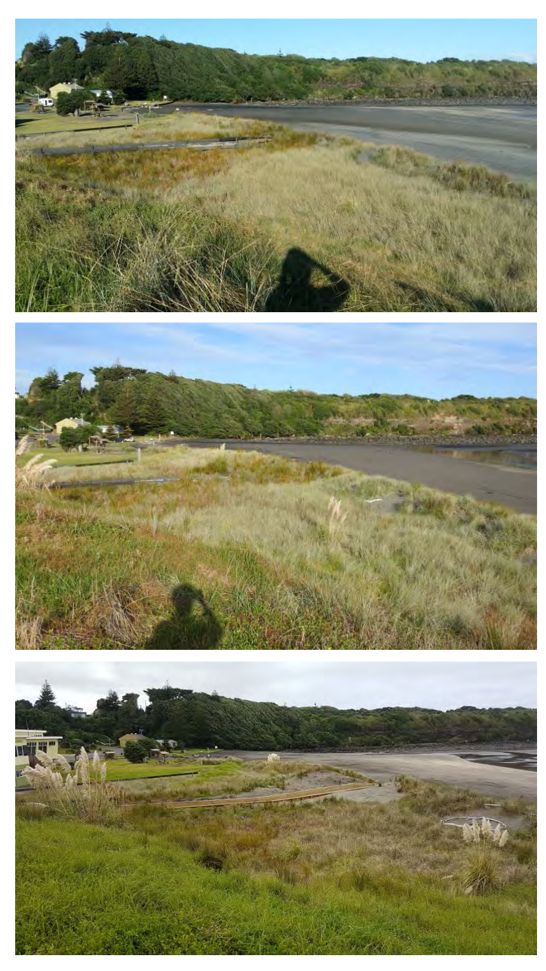
Photo 11 Dune planting at Opunake Beach (top May 2015, middle May 2016, bottom April 2017)