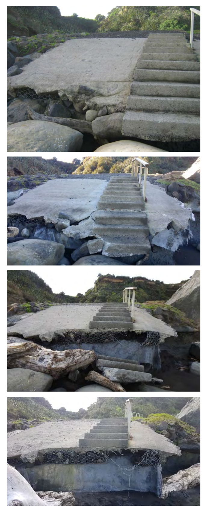
Photo 12 Access way to Waihi Beach, Hawera (top May 2014, middle above May 2015, middle below May 2016, bottom April 2017)