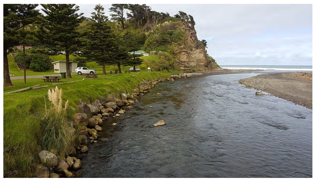
Photo 3 Looking upstream along rock protection works in the Kaupokonui Stream (April 2017)

Subsequent to these investigations, applications for a coastal permit ( 5983 ) (for those works within CMA, the upstream boundary being 5 m downstream of the footbridge) and for a land use consent (for those works upstream of the CMA) were received from the STDC.