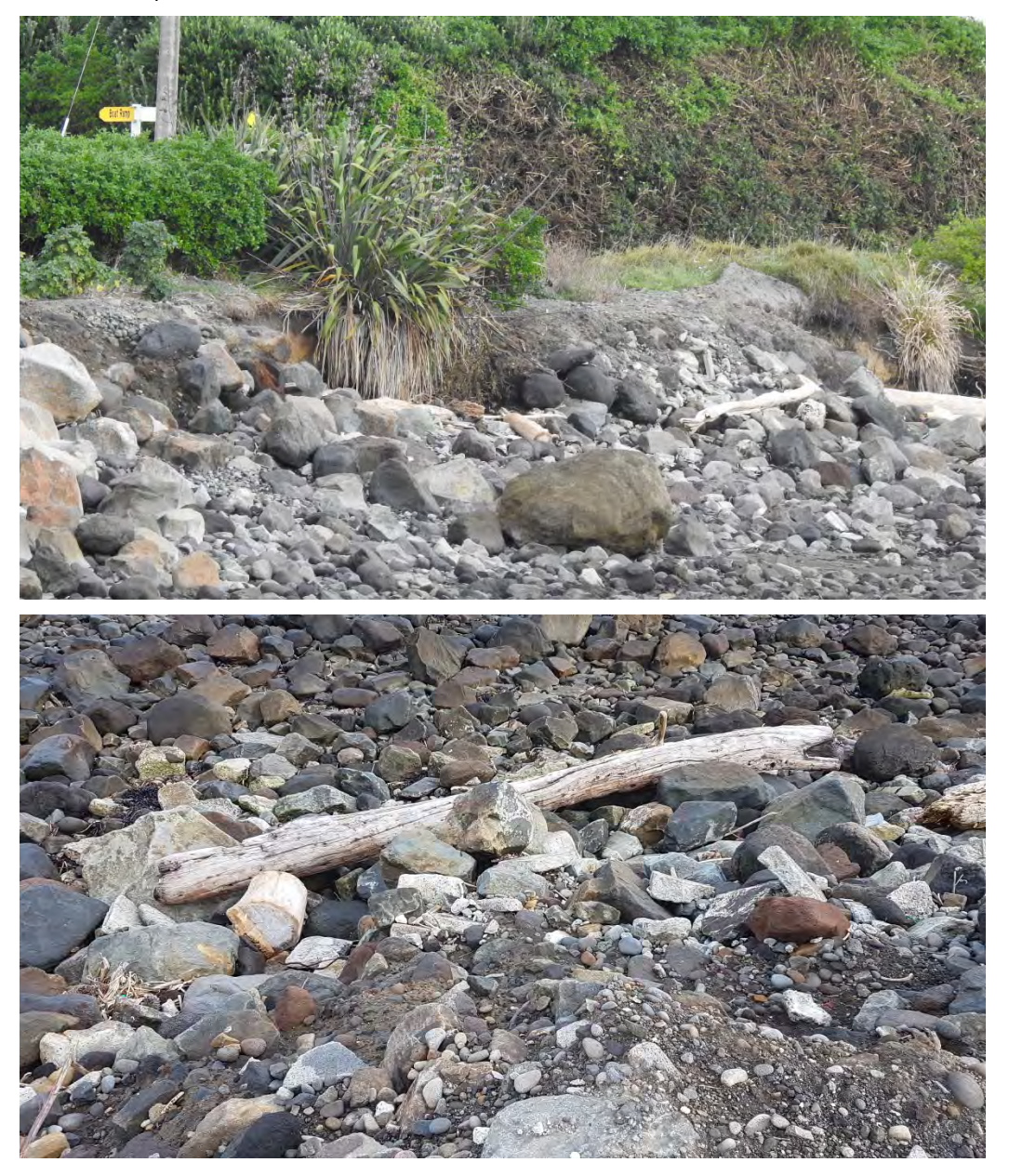
Photo 8 Bayly Road seawall (top rubble used to prevent further erosion May 2016, bottom rubble remaining in place April 2017)

An inspection of the Bayly Road seawall was undertaken on 19 April 2017. The rip rap appeared satisfactory and areas of previous erosion at the south remained filled in with rubble (Photo 8).