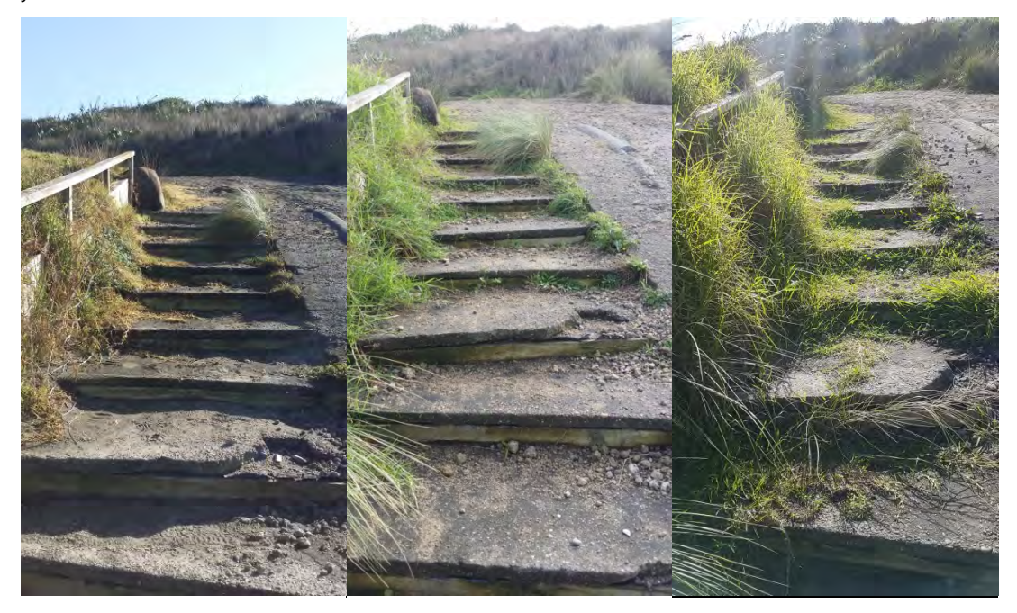
Photo 15 Access to Caves Beach, Waverley (left May 2015, middle May 2016, right April 2017)

Waverley Beach was visited on 19 April 2017. In general, the access ramp down to Waverley Beach was in a satisfactory condition. The access to Caves Beach had sections of concrete missing from the middle steps (Photo 15). This area of damage showed no significant deterioration since the previous inspection in May 2016. During the April 2017 inspection the top steps were overgrown with vegetation compared to previous years.