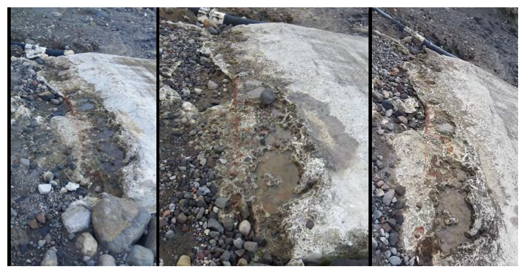
Photo 10 Top section of the Opunake Beach boat ramp (left May 2015, right May 2016, April 2017)

An inspection of the Opunake Bay boat ramp was undertaken on 19 April 2017. The structure appeared to be in satisfactory condition. There was some erosion above the top end of the boat ramp which could potentially cause access difficulty for some vehicles. Erosion immediately above the ramp had not worsened over the last few years (Photo 10). The access track leading down to the consented structure looked more eroded than previous years as a result of recent heavy rainfall.