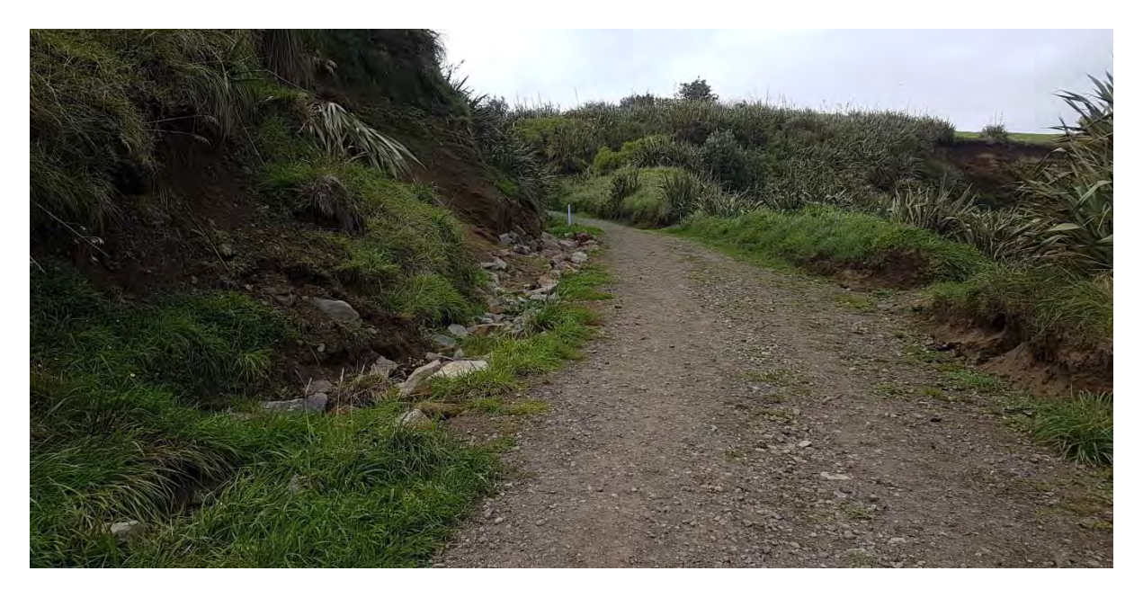
Photo 4 Beach track at the end of Denby Road leading to the gabion mattress consented under 6736 (April 2017)