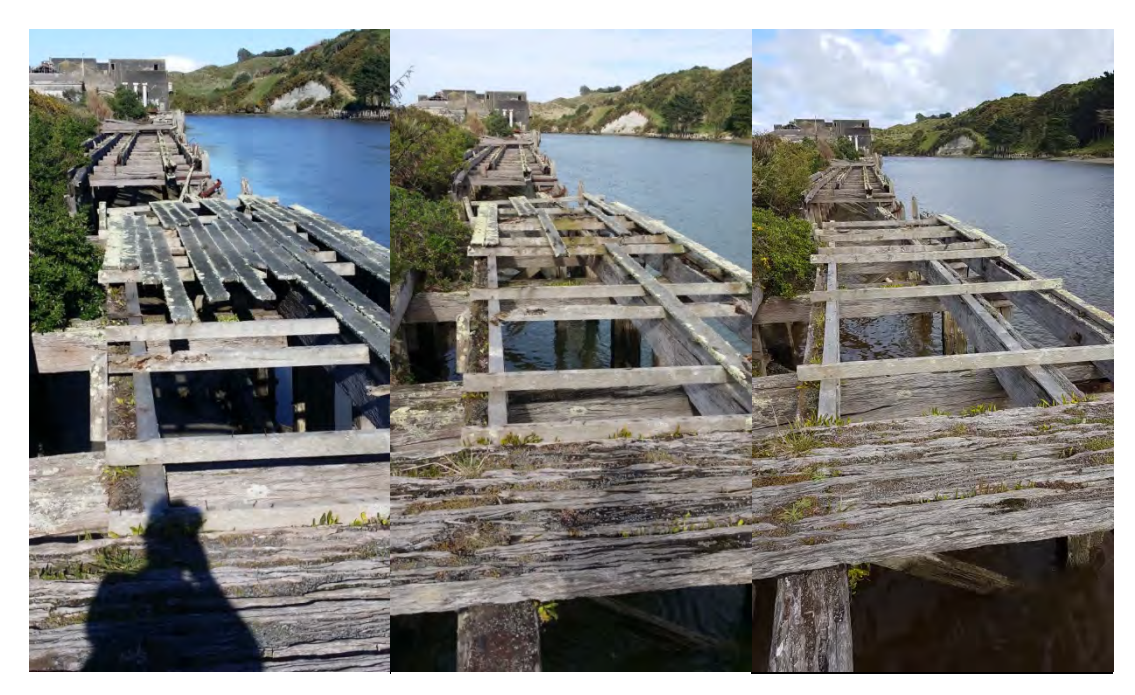
Photo 14 Old Patea wharf (left May 2015, middle May 2016, right April 2017)