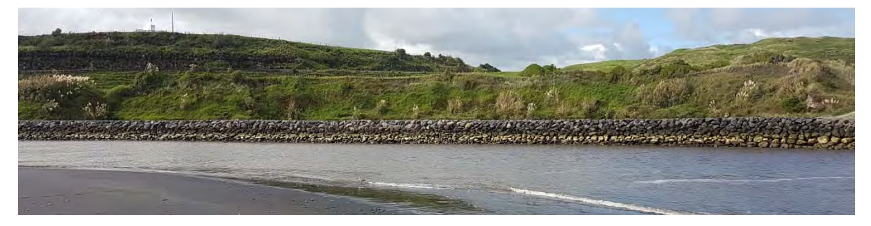
Photo 13 Training wall at Patea shown on the far side of the river (April 2017)

STDC have been undertaking significant repairs in this area, since works began in 2006. STDC continued repair works to the Patea groynes and training walls over the 2013-2014 period with an expenditure of approximately $40,000 associated with repairs to the eastern training wall in 2013. No repairs or maintenance works were required during the 2016-2017 monitoring year.