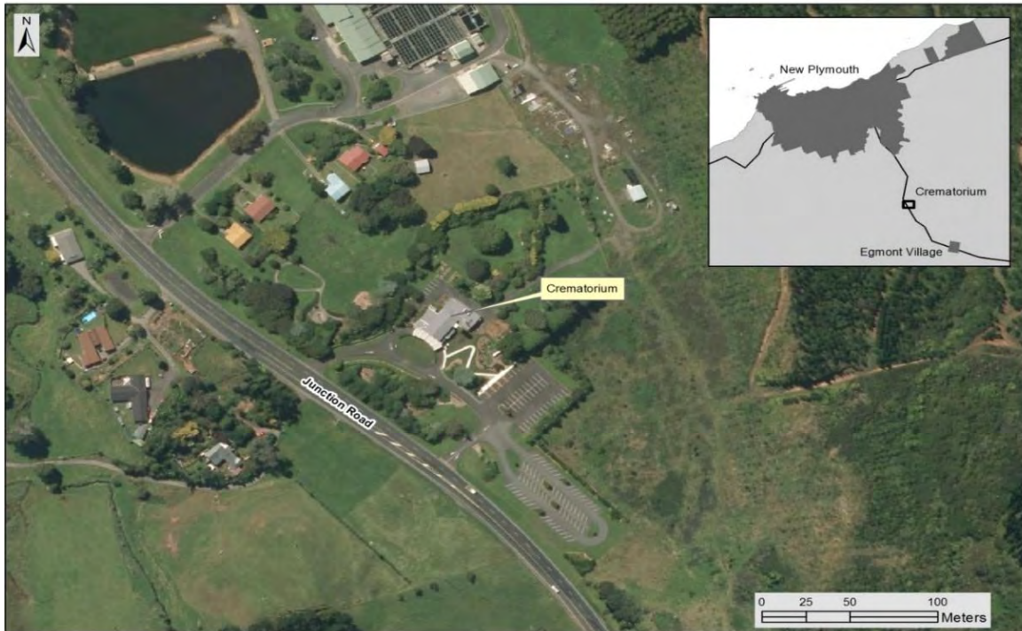
Figure 1 Location of New Plymouth crematorium

As shown on the graph in Figure 2, the establishment of the crematorium of W Abraham Ltd crematorium resulted in a substantial reduction in the number of cremations in 2009-2010 at the NPDC crematorium, and numbers remained similar at just over 335 cremations during the years following with 375 cremations carried out in the 2018-2019 period. 224 cremations were via the Newton cremator and 151 cremations via the Elecfern cremator.