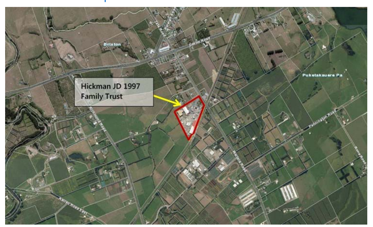
Figure 1 Aerial location map of Hickman JD 1997 Family Trust

This site was originally the Brixton Dairy Factory until it shut down and the discharge resource consent was transferred into Hickman JD 1997 Family Trust.