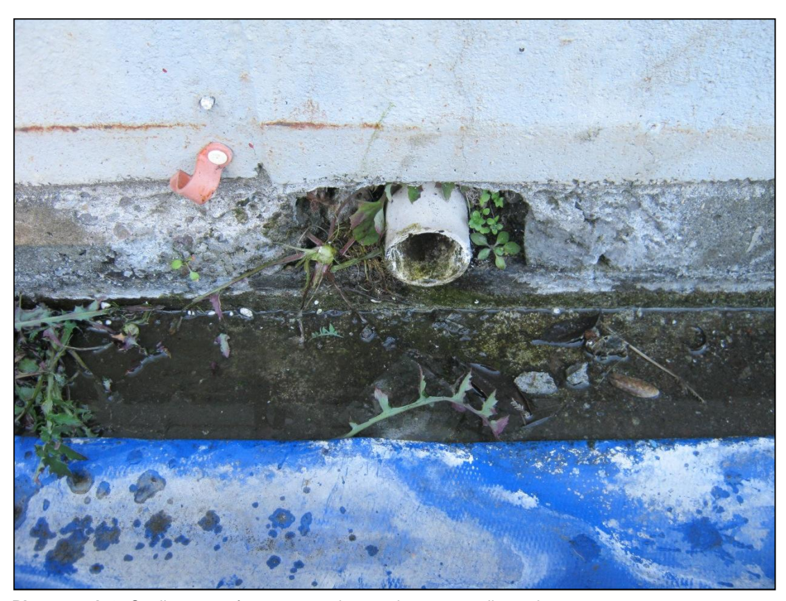
Photograph 3 Cooling water from evaporative condenser sampling point