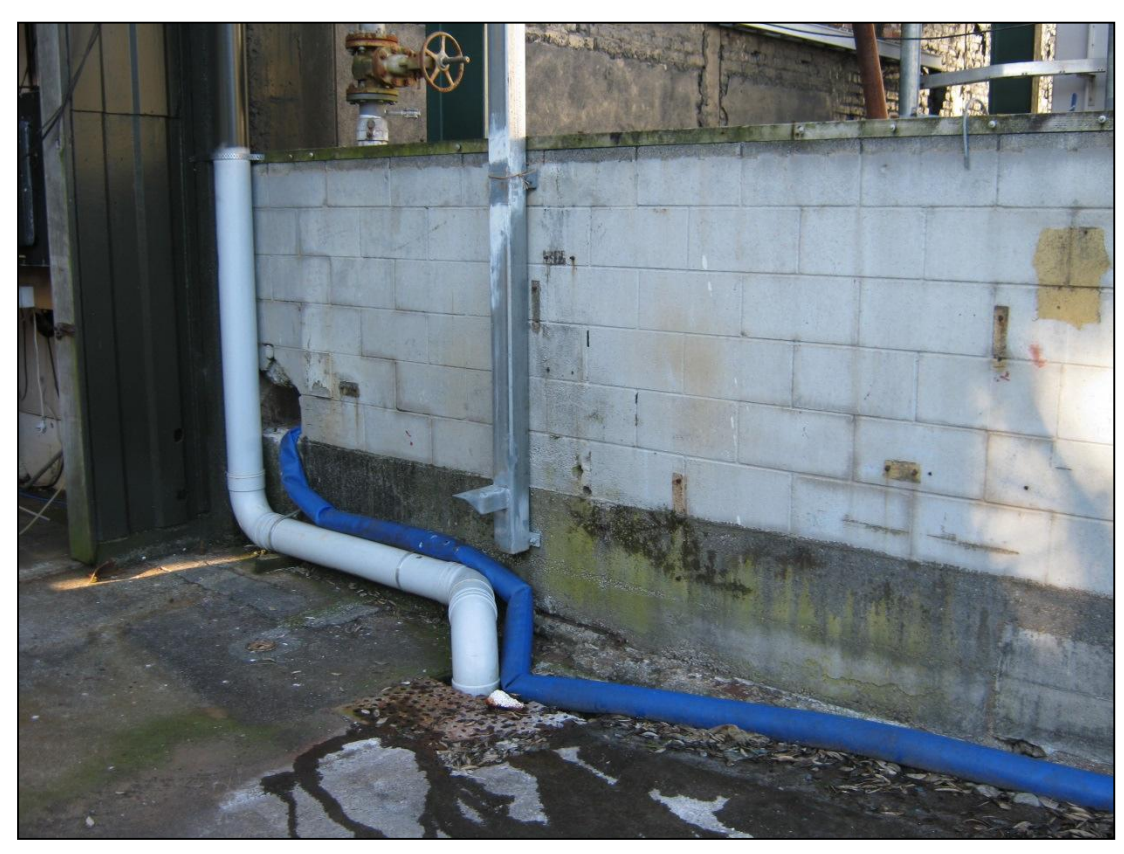
Photograph 1 Oil cooling water sampling point at end of blue hose