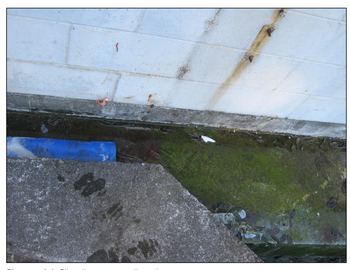
Photograph 2 Oil cooling water sampling point