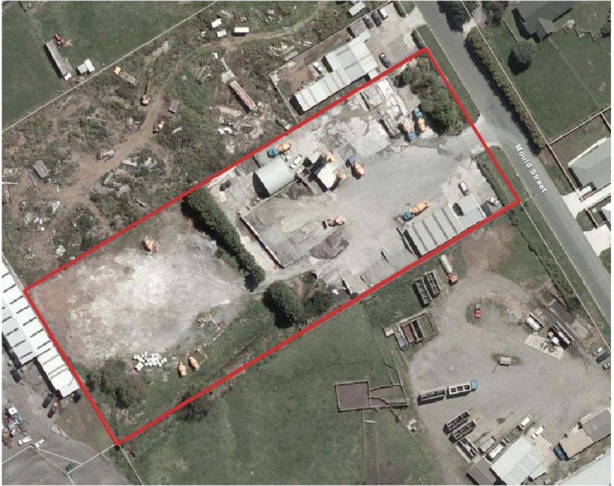
Photo 2 Location of Allied Concrete site, Mould Street, Waitara