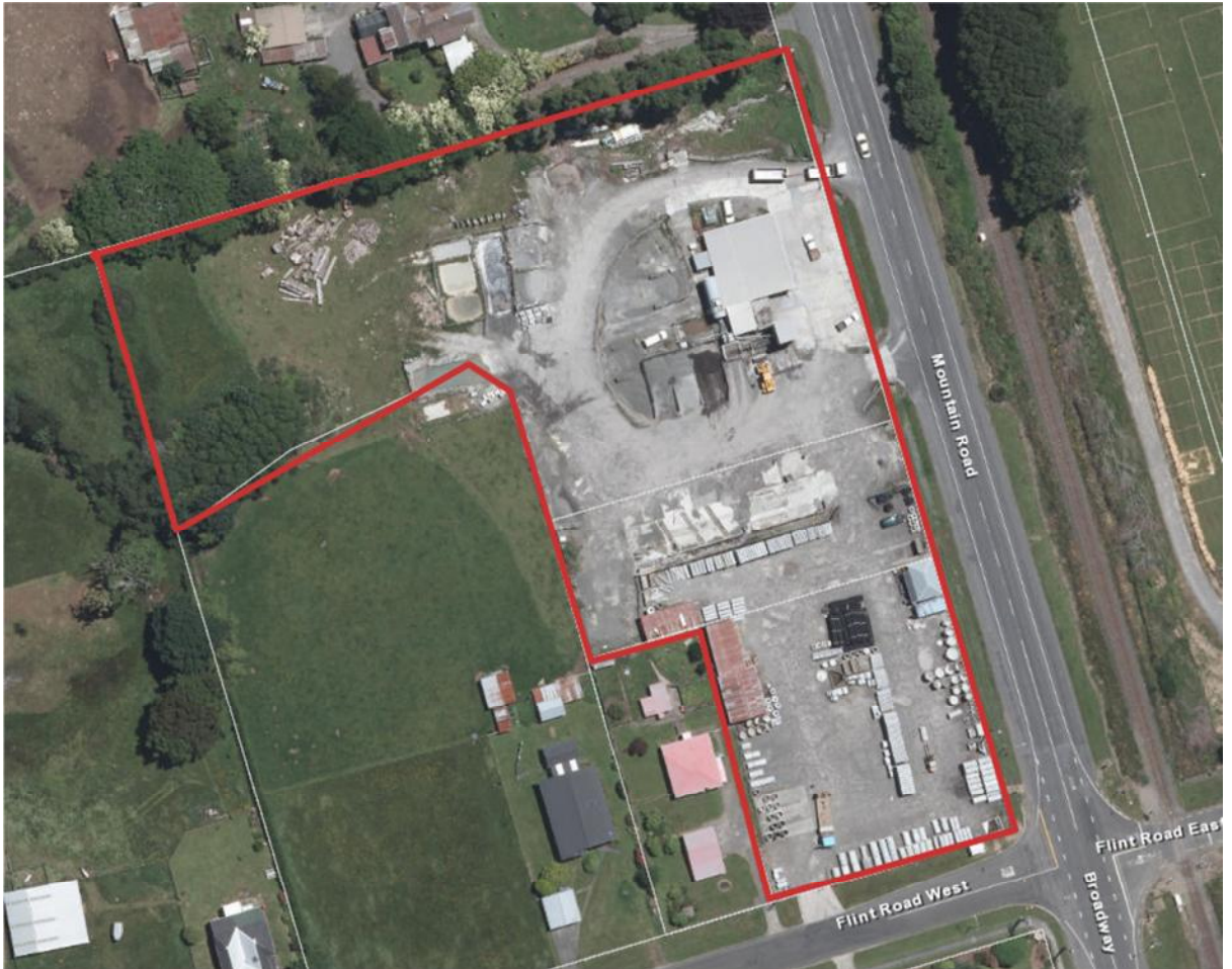
Photo 3 Fletcher Concrete site (Firth & Humes Pipeline systems), Stratford