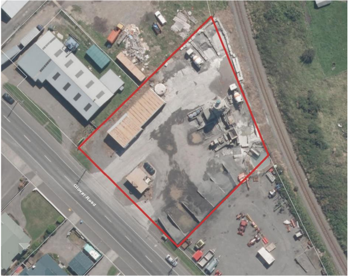
Photo 1 Location of Firth Industries site, Glover Road, Hawera