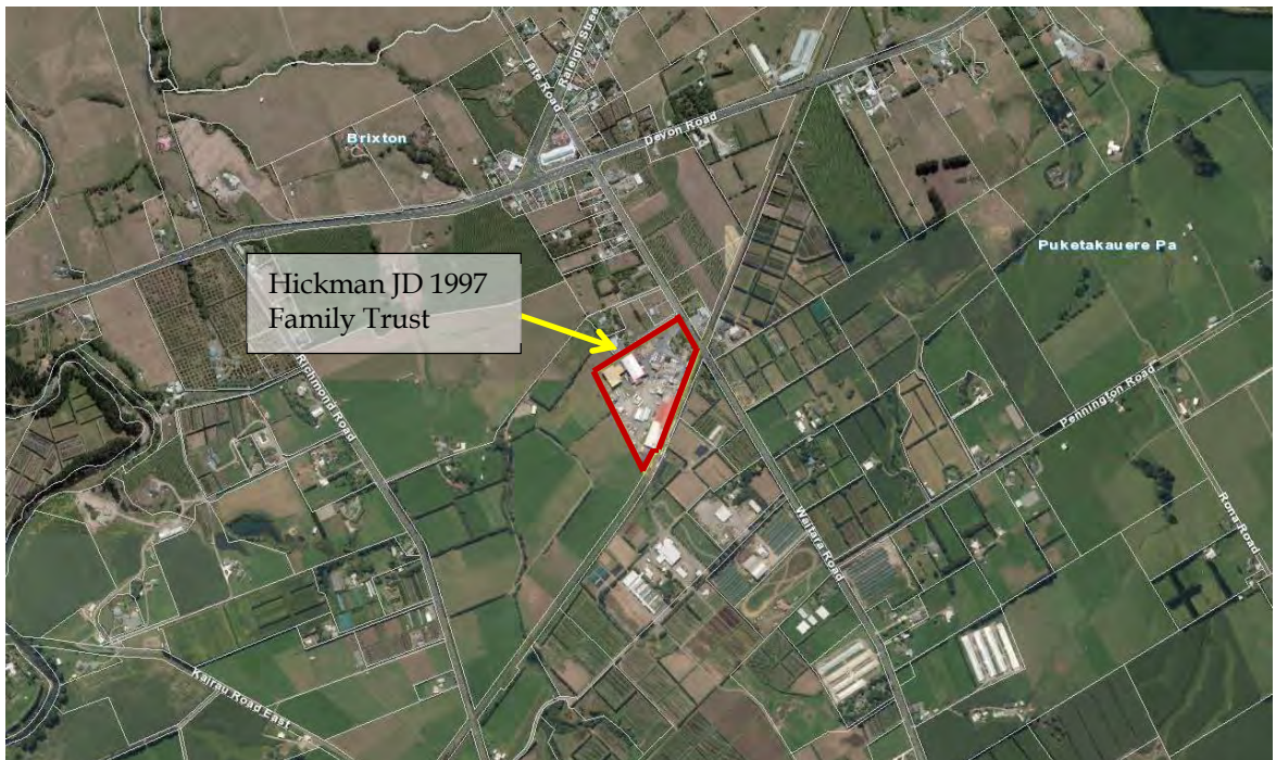
Figure 1 Aerial location map of Hickman JD 1997 Family Trust

The site also has a truck workshop area, and an area to steam clean vehicle parts. This area drains to a series of three interceptor sumps where grease/oil/hydrocarbons are collected and removed off site prior to the wash water then being directed to the stormwater system.