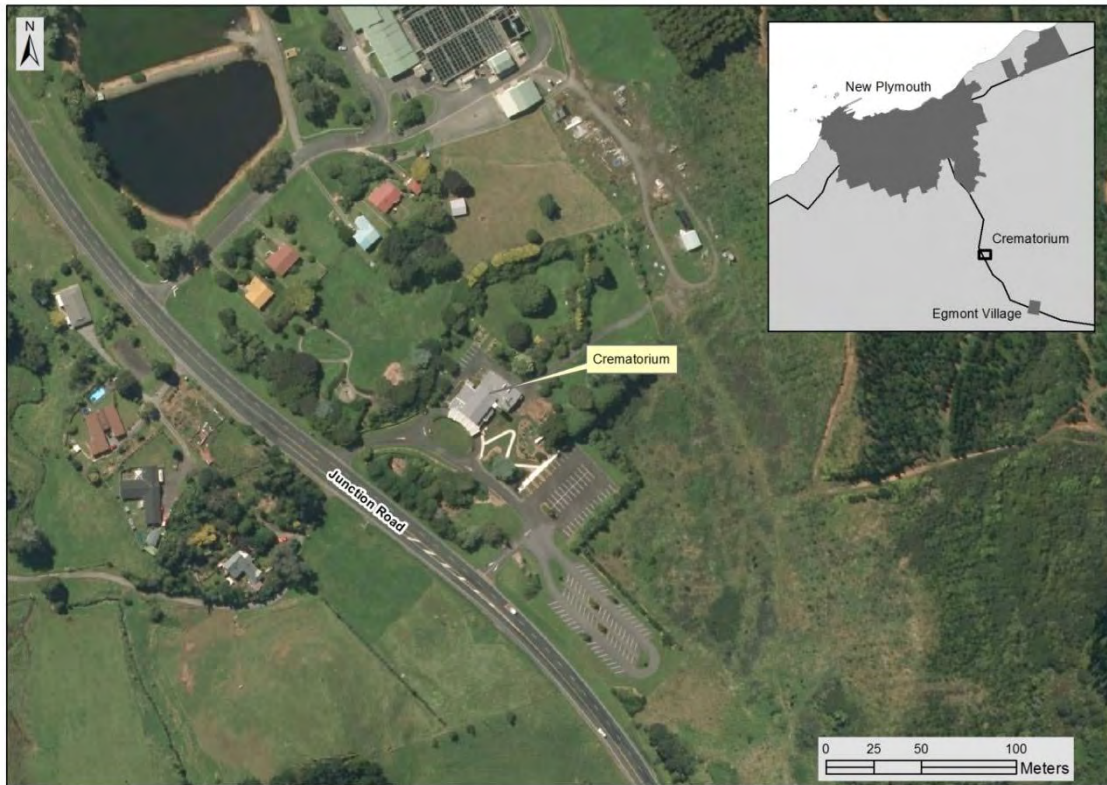
Figure 1 Location of New Plymouth crematorium

The New Plymouth crematorium has been operating at its site on Junction Road (Figure 1), 5 km south of the city, since 1961. It was the only crematorium in the Taranaki region until March 2009, when of W Abraham Ltd crematorium commenced operation at Bell Block. Approximately 300 cremations are undertaken annually.