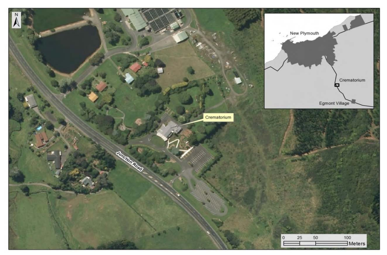
Figure 1 Location of New Plymouth crematorium

The New Plymouth crematorium has been operating at its site on Junction Road (Figure 1), 5 km south of the city, since 1961. It was the only crematorium in the Taranaki region until March 2009, when of W Abraham Ltd crematorium commenced operation at Bell Block. Approximately 320 cremations are undertaken annually.