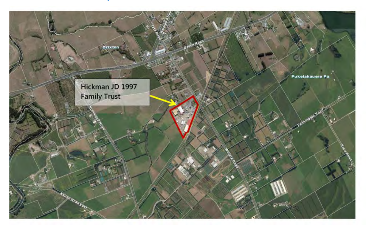
Figure 1 Aerial location map of Hickman JD 1997 Family Trust

This site was originally the Brixton Dairy Factory until it shut down and the discharge resource consent was transferred into Hickman JD 1997 Family Trust.