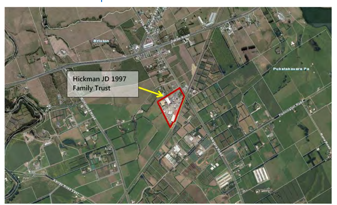
Figure 1 Aerial location map of Hickman JD 1997 Family Trust