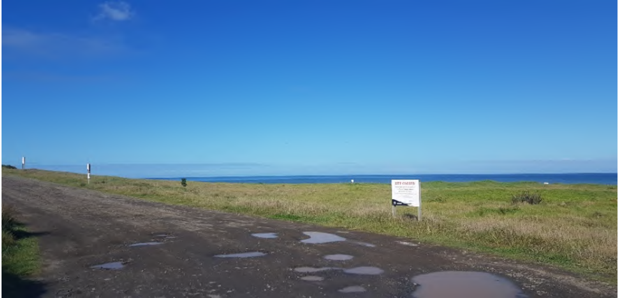
Photo 2 Patea green waste site inspection 22/04/2021

The closed Patea green waste site was inspected during fine weather conditions. The site was in good condition with no signs of erosion or inorganic material. No green waste had recently been deposited to the site at the time of the inspection. The 'No Dumping Signs' along the roadway were in place. The area appears to be well vegetated and there was no sign of stormwater erosion at the site.