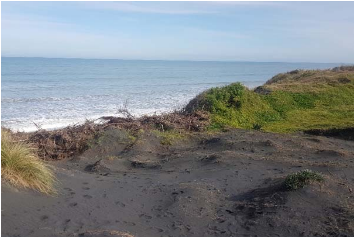
Photo 1 Patea green waste site inspection 05/08/2021

A site inspection was carried out at the disused green waste site during fine weather conditions. It was noted that some organic matter appear to have been intentionally deposited in an area to prevent further erosion and help sand dune stabilisation. This area looked in good condition. No green waste had recently been deposited to the site at the time of the inspection. The 'No Dumping Signs' and vehicle barriers along the roadway were in place. The area appears to be well vegetated in mainly grasses and weed species with some flax bushes. There was no sign of stormwater erosion at the site. There were no issues with exposed inorganic material along the coast line.