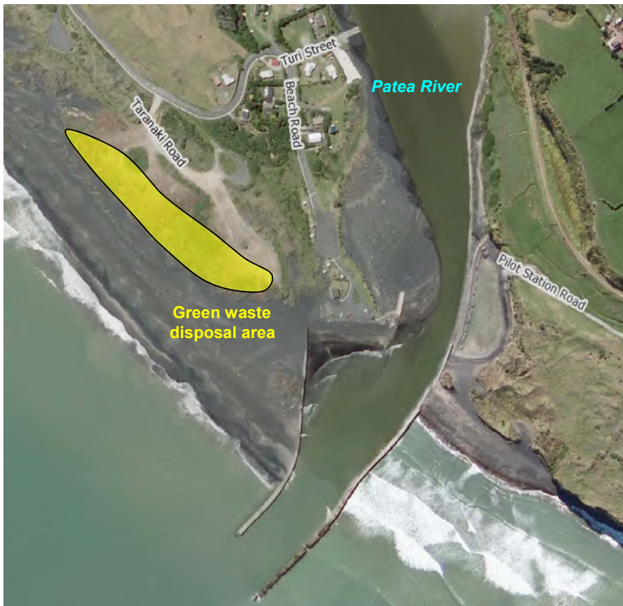
Figure 2 Aerial view of the Patea Beach green waste disposal area