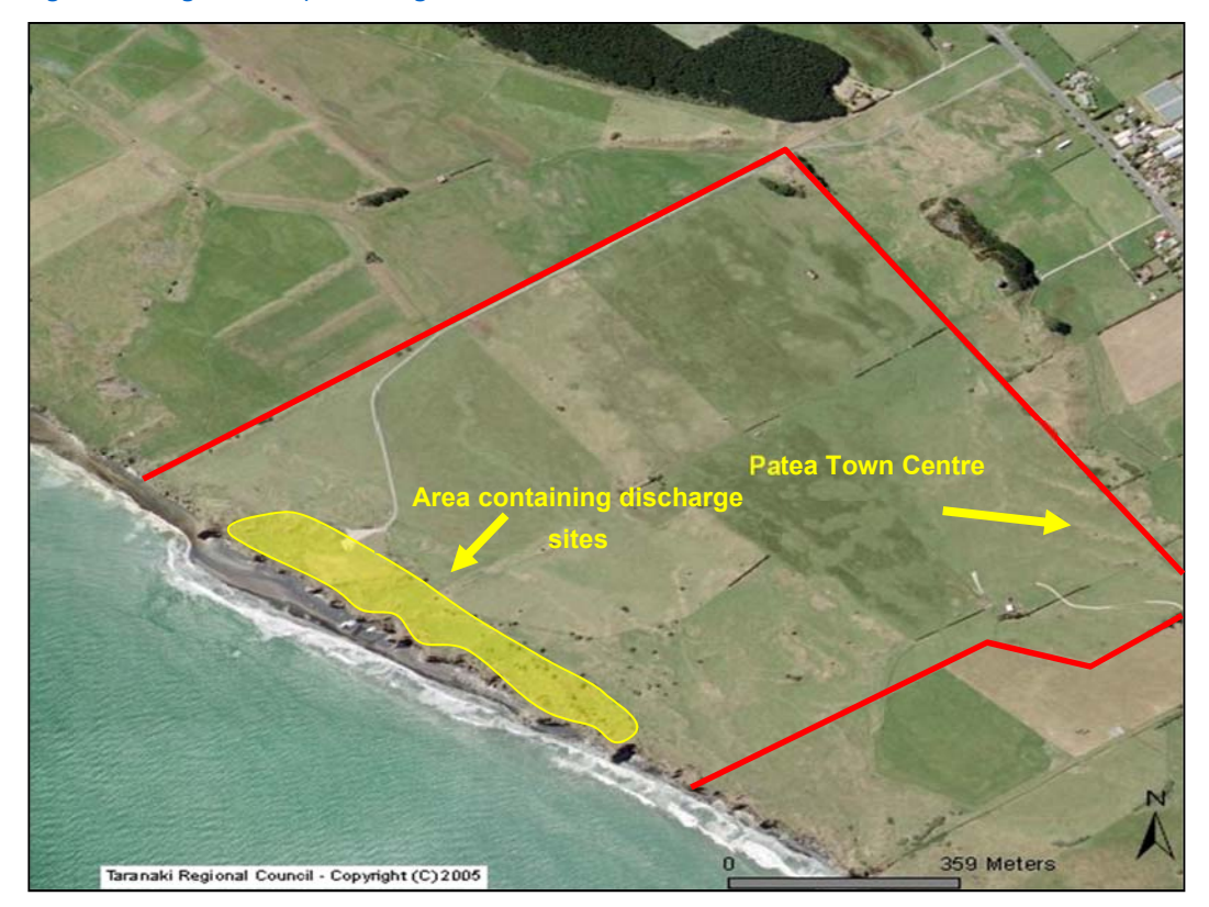
Figure 2 Aerial image of the Malandra Downs property disposal area